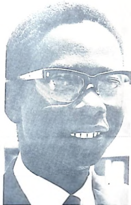
Dibba, his brother's bututs.

Our rather bald news item last week, that Sheriff Dibba had resigned as Vice-President of The Gambia while keeping his Finance portfolio, did not give the full story behind the resignation. Now The Gambia News Bulletin has published the resignation letter of Mr. Dibba and Westminster Jawara's reply, observing the Westminter proprietaries, right down to the "Dear Sir Dawda", and the "Dear Sheriff". Dibba recalls in his letter that the President informed him on September 13 that the Landrover recently involved in a smuggling incident, and arrested in Senegal, had collected his brother at No. 1 Marina Parade, and the contraband goods reportedly impounded by the Senegalese authorities were allegedly loaded into the Landrover at the same address. Mr. Dibba condemned the "shameful crime" which had caused serious embarrassment to the government and to himself, and it was his view that the culprits should be brought to justice. In view of the circumstances he