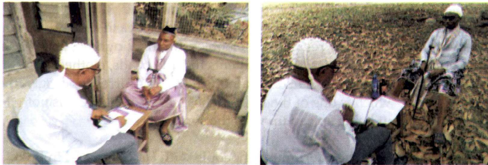
Personal Interview with some respondents