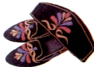
Shoe & Cap