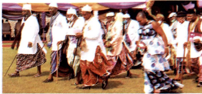
Men in Usobo During Ritual Ceremony