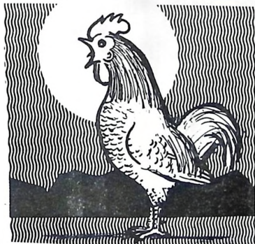
"Cock crow at dawn", Sunday at 9.30 a.m. and Friday at 9. p.m.