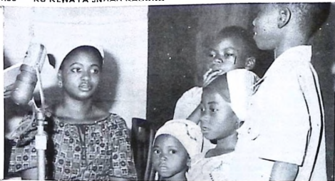
For Schools, Mon. at 8.45 hrs.