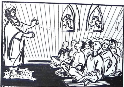
Muslim Sermon every Friday at 0615 Rpt Fri, 1230hrs

0530 STATION CALL SIGNAL 7531 NATIONAL ANTHEM, PLEDGE AND OPENING ANNOUNCEMENT 0532 READING FROM THE HOLY QURAN 0547 PROGRAMME PARADE IN ENGLISH AND HAUSA 0600 NEWS AT DAWN 0603 MOMENT FOR THOUGHT FROM THE NIGERIAN EDITORIALS 0605 MOSLEM SERMON (RPT FROM FRI 1230)HRS 0645 STATE NEWS IN BRIEF 0650 SHORT AND SWEET 0700 NATIONAL NETWORK NEWS 0715 NEWS ANALYSIS 0720 BARKA DA JUMMA'A - A REQUEST PROGRAMME IN HAUSA 0800 NEWS SUMMARY IN KANURI HAUSA AND FULFULDE 0815 YAKAMUASO - HOUSEWIVES PROGRAMME IN KANURI (RPT FROM WED 1615)HRS 0845 ZABEN MAI GABATARWA 0900 DON IYA'IEN KU - A FAMILY REQUEST PROGRAMME IN HAUSA 1000 INDIAN MUSIC BY D.C.A. 1030 INDA ACE - A LIGHT HEARTED ENTERTAINMENT PROGRAMME IN HAUSA (RPT FROM SUNDAY 1730)HRS