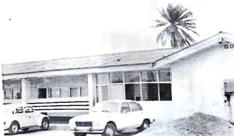
Radio Lagos Building