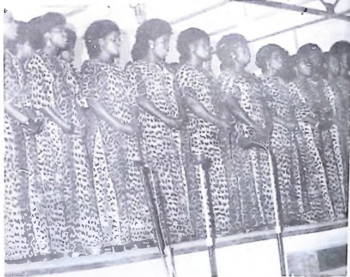
Choral singing, Thursday at 0845 hrs.