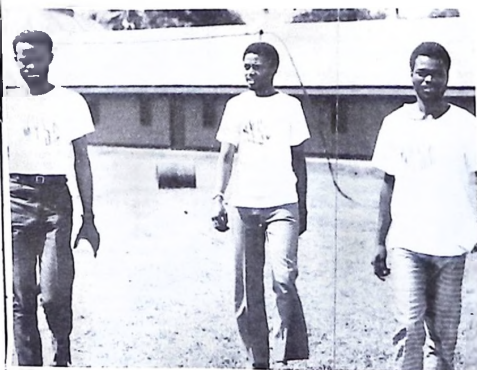
NYSC Calling, Friday at 1830hrs.