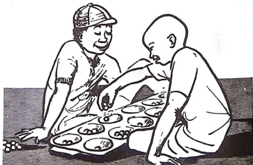
"Ere Ayo" a popular yoruba game, can be seen on channel 5 Lagos, on Thursday at 7 p.m.