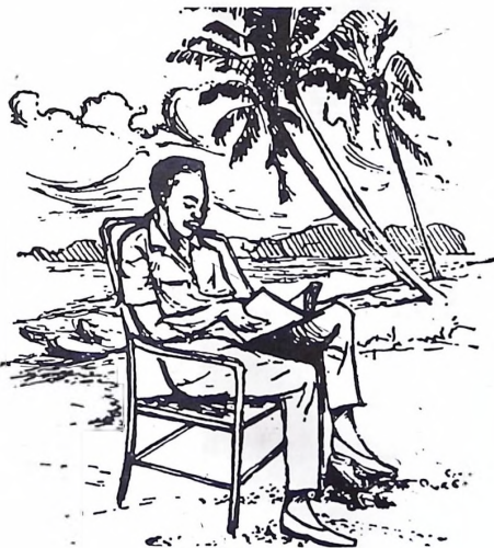
Book Review/Ayewo Iwe on Saturday at 6.45 p.m.