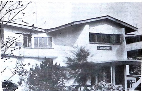
Laboratory Building Federal Institute of Industrial Research, Oshodi.