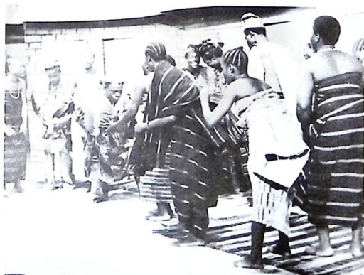
From the archives, one of the scenes from "Play of the Week" every Wednesday at 9.30 p.m.