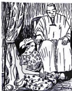
Greeting, the traditional way