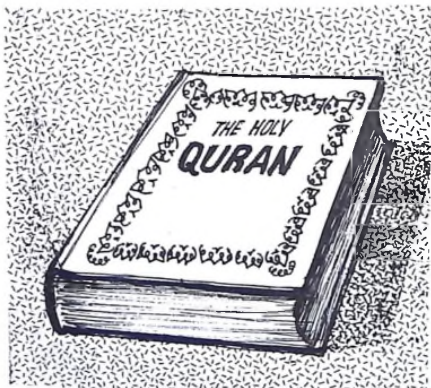
Reading from the Holy Quran, Wednesday at 0605 hrs. daily