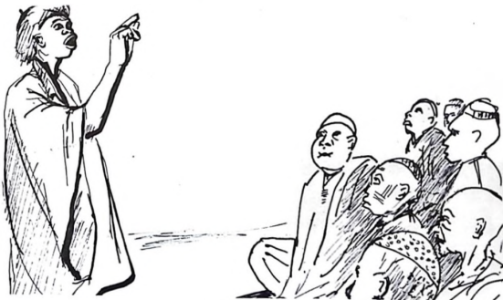
Islamic Talk - Friday: 12.30