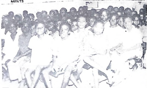
Children waiting for the Doctor at a Health Centre Radio Plateau brings up the programme "Your Health" on Saturday at 08.10.