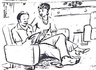
"Toko Taya" Tuesday at 8.30 P.m.