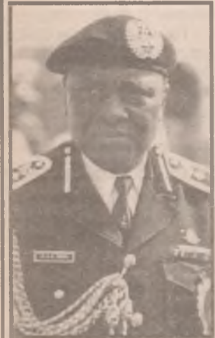
Musiliu Smith, Police IG

An angry mob in Hadejia went on rampage over the weekend, setting a police station ablaze and the house of a district head, protesting high rate of ritual killings in the area.