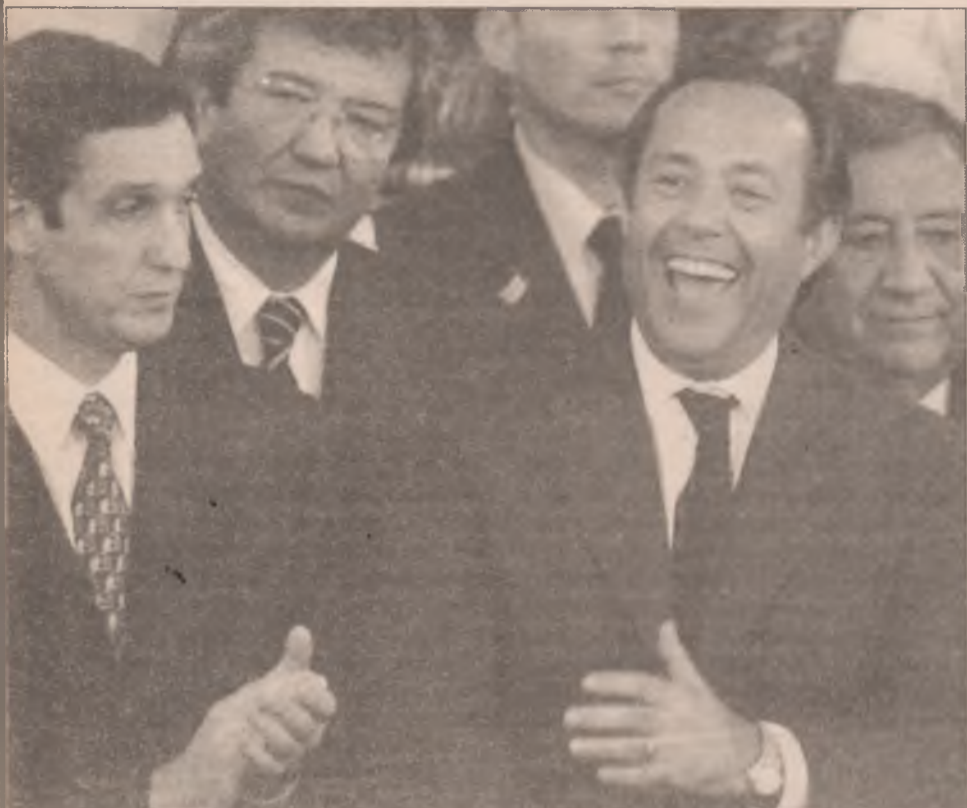
Argentina's interim President, Adolfo Rodriguez Saa laughs during the swearing-in ceremonies for his new ministers at the Government House in Buenos Aires. From left are: Interior Minister, Rodolfo Gabrielli, Foreign Minister, Jose Maria Vernet, Rodriguez Saa, and Labour Minister, Oraldo Britos.