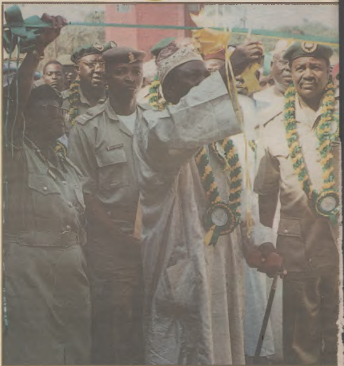
Chief Sunday Afolabi (JD), Hon. Minister of Internal Affairs being assisted by the Comptroller-Ge. at the commissioning of the new Medium Security Prison, Ile-Ife, Osun State.

It was therefore against this background that the prisons service deemed it necessary to establish Reference Hospitals across major prisons in the country, the first being in Lagos commissioned in 1994, and Kaduna followed suit in 1999. Not relenting in its efforts and the priority for all major prisons across the country to have a reference hospital, the prisons service this year com-