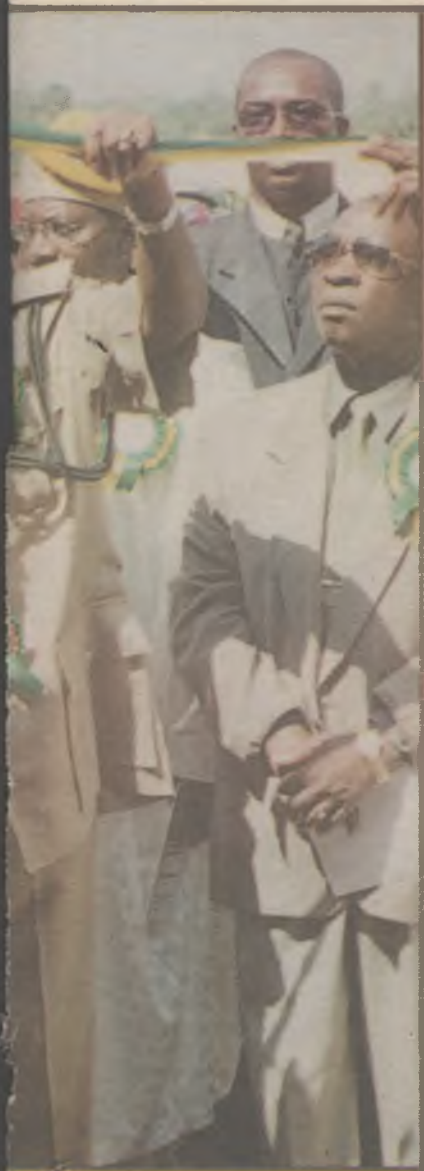
Comptroller-General of Prisons, Alhaji Ibrahim Jarman

enhances the scope of the prisons service in handling the problem of prison congestion, and gives room for proper classification of prisoners in the various prisons. This enhances the goal of treatment and rehabilitation of offenders. It encourages the prospect of good penal practices in Nigeria, and the observance of the rights of prisoners.