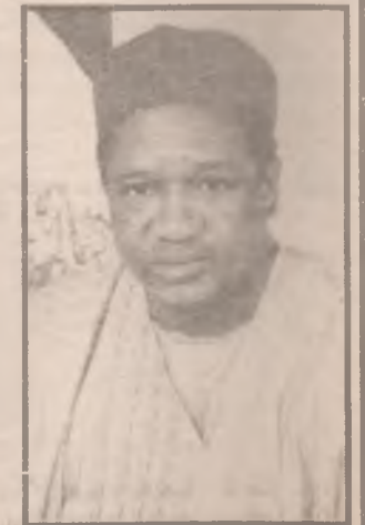
Governor Abba Ibrahim of Yobe State.

He said this would be a big boost to the public schools, which need to be repositioned for optimal efficiency.