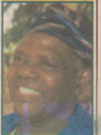
Gov Bisi Akande of Osun State