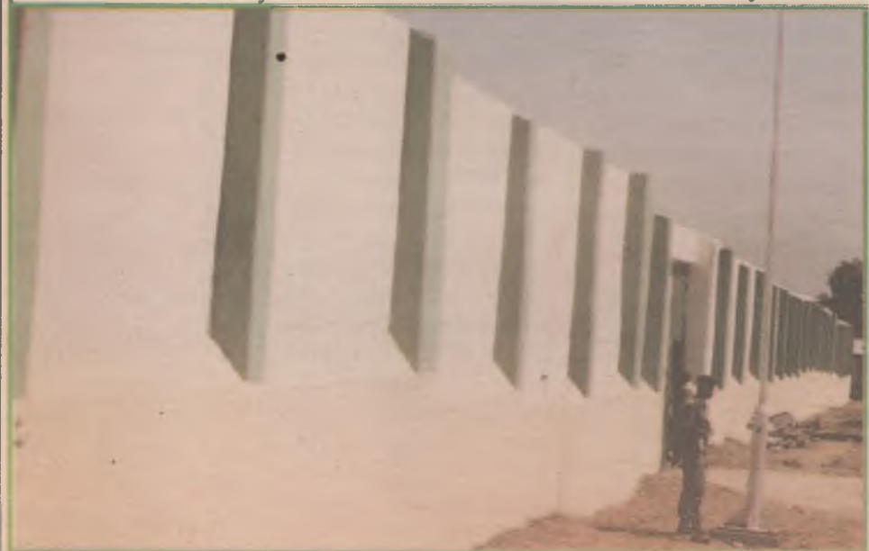
Walls of the New Minna Medium Prison

The Nigeria Prisons Service in its effort to modernize the penal institution, and to ameliorate the psychological and emotional trauma experienced by inmates, therefore decided to replace the old prison facilities, of which 79 per cent have been in existence from the colonial days, and could no longer support the full demands of the contemporary penal philosophy on the treatment of offenders. Owing to certain constraints in the past, initiated