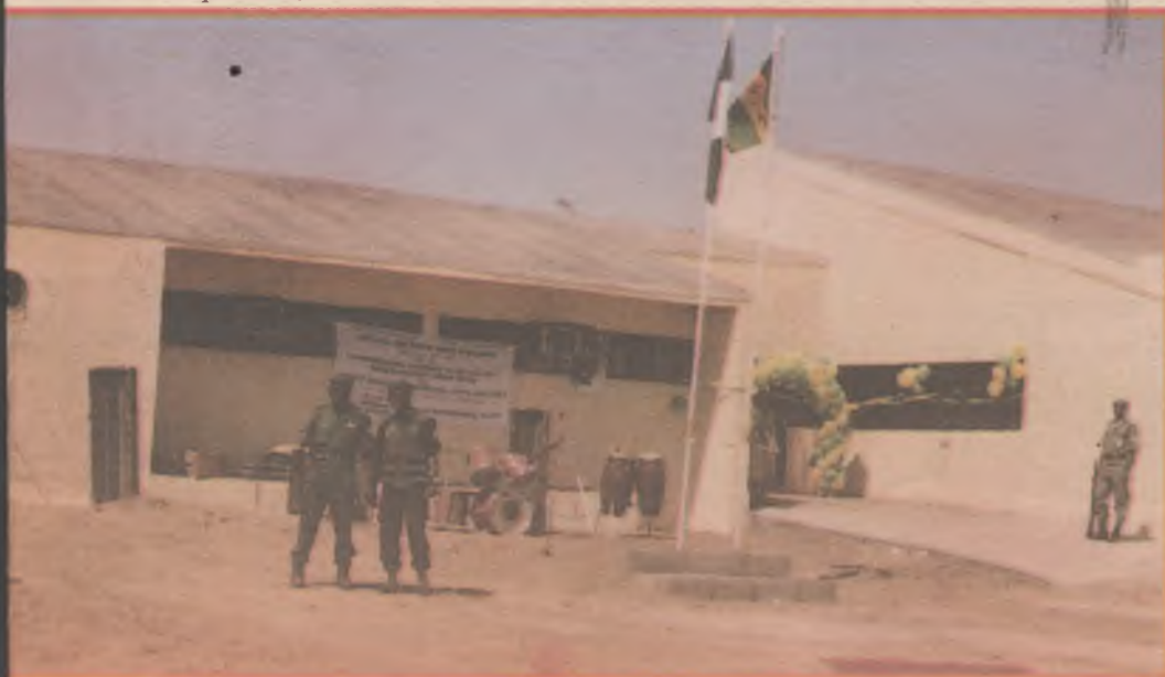
Entrance to the New 160-bed medium security prison Minna.

ing, religious and vocational training etc, adequate space therefore is required to enhance their effective co-ordination.