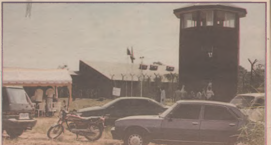
The watch tower of the New Ile-Ife Prison, commissioned recently by the Honourable Minister of Internal Affairs, Chief S.M. Afolabi