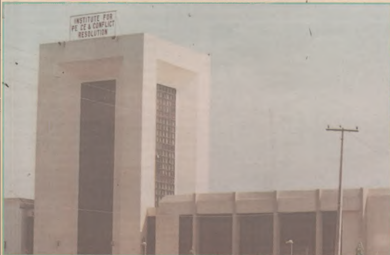
Institute for Peace and Conflict Resolution, Abuja.