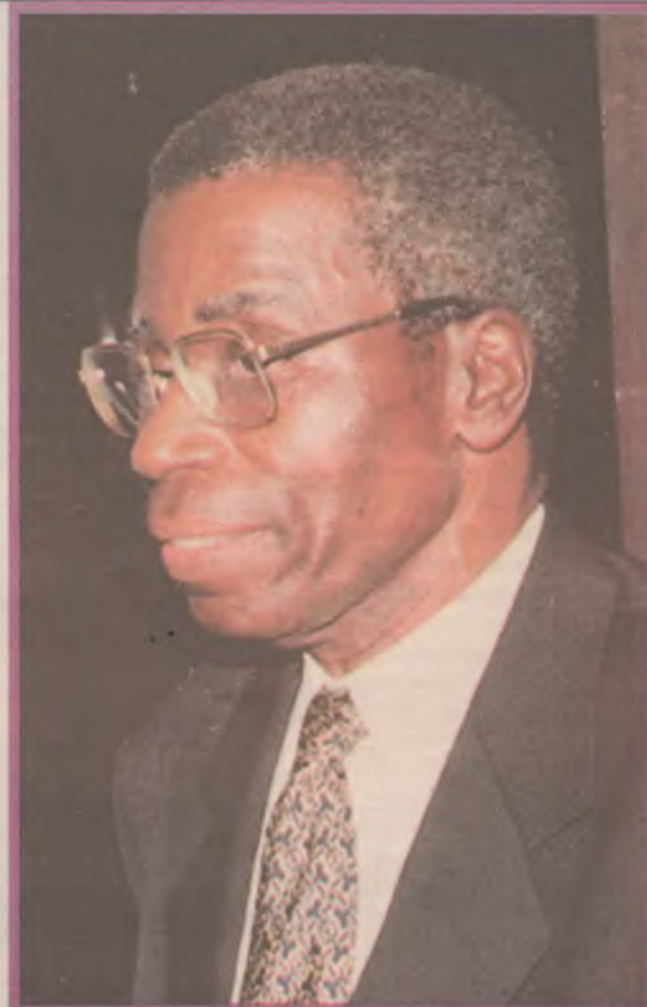
Late Chief Bola Ige

He also called on President Olusegun Obasanjo to declared a one-week of national mourning and also set up a judicial commission of inquiry to unravel the circumstances surrounding the late minister's death.