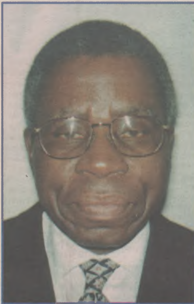
Late Chief Bola Ige