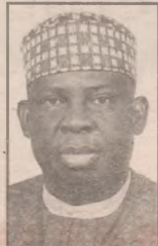
Min. of Health, Prof. A.B.C. Nwosu

The participants who agreed on the introduction of Environmental Education (E.E) in the curriculum of secondary schools, sought for the reintroduction of Environmental Sanitation at National, State and Local Government levels.