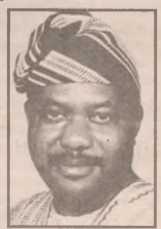
Gov George Akume

It would be recalled that the state is still undergoing a 12 p.m. to 5 a.m. curfew, arising from the recent students demonstration in Makurdi, over soldiers' reprisal attacks on villages in Logo, Ukum and Katsina-Ala local government areas of the state.