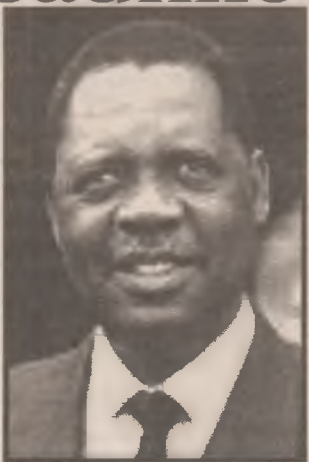
Hayatou, CAF boss

"By their silence, the NFA assumed and correctly so that the players would be released to join their colleagues to prepare for the Nations Cup and then take part in the friendly matches arranged for the Eagles against the Pharoahs and the Elephant", he said.