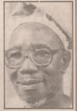
Governor Lam Adesina of Oyo State.

Kilani also noted that the state government, through the Ministry of Education, was providing bursary allowance to people with disabilities in tertiary institutions in various parts of the country.