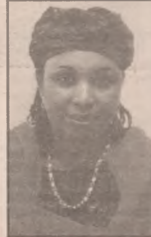
Aisha Isma'il, Minister for Women Affairs.

A frontline woman politician in Kano State,