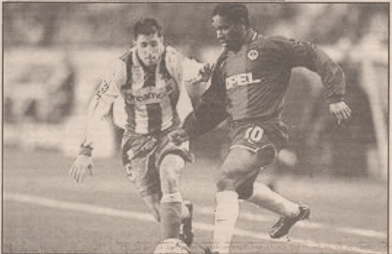
Austin Okocha in action for Paris St Germain. Okocha will join his mates in Ota, to begin camping for the Nations Cup fiesta on Thursday.

"If we fail to win the Nations Cup I shall be very disappointed. We're still the team to beat in Africa."