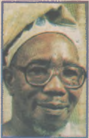
Gov Lam Adesina of Oyo State

The No. 8, Akinlabi Sanda Close, Bodija, residence of the late minister was jampacked with sympathisers, political associates and top government officials from Oyo, Osun, Ekiti, and