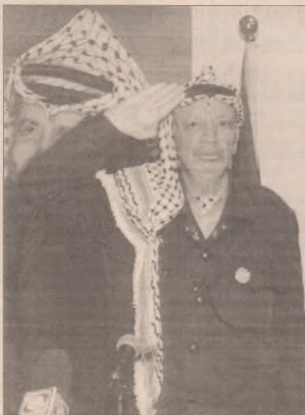
Palestinian leader, Yasser Arafat salutes during the Palestinian national song during his visit to the Palestinian education ministry in the West Bank town of Ramallah ... Sunday.

They claim the system will add to Tanzania's debt burden just as Western nations - led by the UK - are attempting to relieve it. Britain has written off £100m of the country's debts.