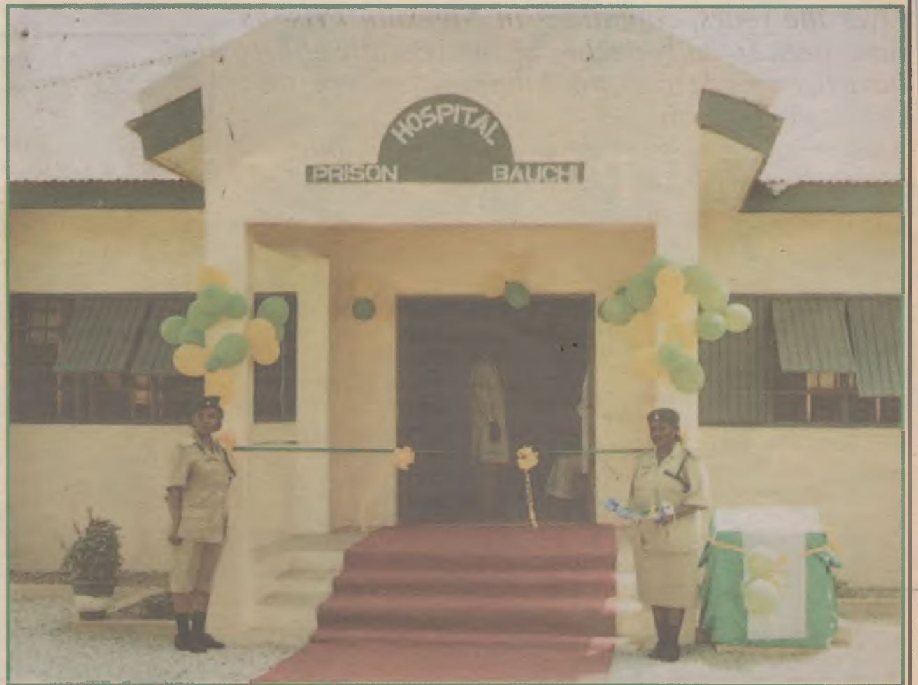
The Prison Reference Hospital, Bauchi

The ultra-modern 160-bed medium security prisons commissioned recently at Ile-Ife and Minna have striking qualities and better facilities, which differ in quite significant ways from the dilapidated prison facilities of the past. Apart from having environments conducive for the better training and treatment of offend-