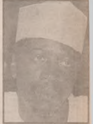
Gov Attahiru Bafarawa

Her case has been a cause for concern for the Federal Ministry of Justice as well as human rights activists both at home and abroad.