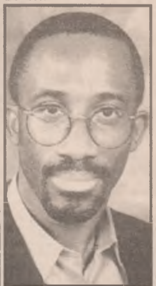
Hakeem Belo-Osagie, UBA Boss.

Chairman of United Bank for Africa Plc. (UBA), Dr. Hakeem Belo-Osagie has said that the new Central Bank of Nigeria (CBN) guidelines on public sector lending will save the nation from the straits of bank industry distress.