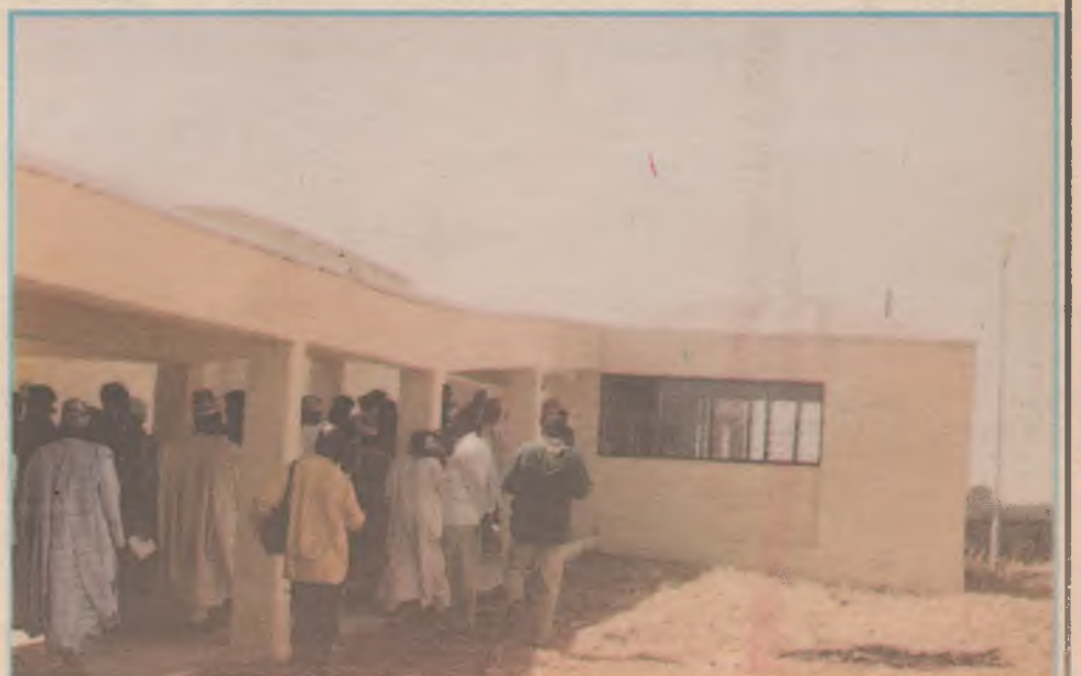
Dignitaries inspecting facilities at the newly commissioned Minna New Prison