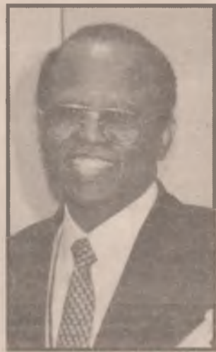
Joseph Sanusi, CBN Governor.

However, if the speculations are the industry is anything to go by, indications are that the apex bank may soon reduce the MRR in order to make the economic environment more amenable to the real sector of the economy.