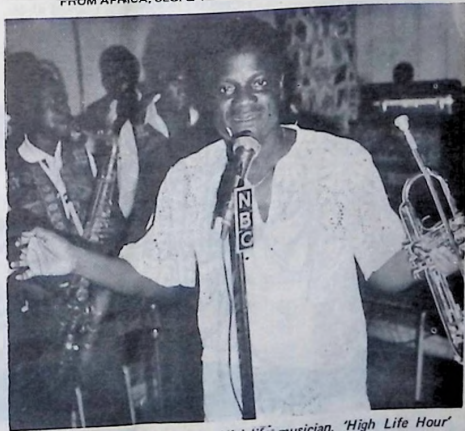
Victor Olaiya, a veteran Nigerian Highlife musician. "High Life Hour" from Radio Nigeria Kaduna is on Wed .09.05

0458 DRUMS SIGNAL 0459.30 NATIONAL ANTHEM