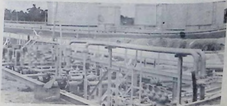
L.N.P.C. Oil Depot at Mosimi. Is the era of an oil boom gone forever?

For the OPEC-members, the urgency of the present situation calls for cooperation among the member-nations. They must sink their differences, bury their petty narrow national interests and make temporary sacrifices in order to reap better future benefits.