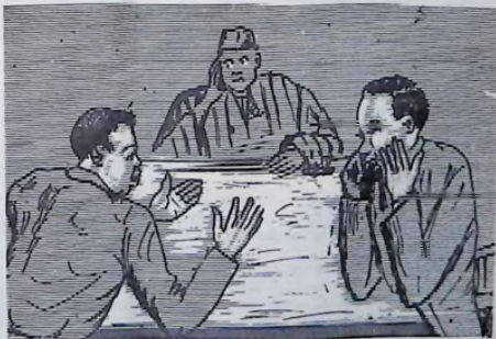
...Discussing important topic... discussion... programme... Friday... 21. 30