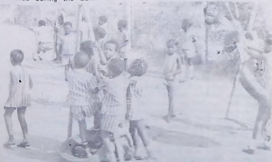
Kiddies on the play ground. Nigeria owes her children a healthy education for the development of sound minds.

For instance, how much of Nigeria - your own country - do you know? I bet that, outside your home state, you know very little about the country