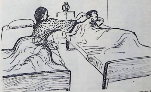
'Ba'ji Oji mi' is broadcast on Radio, Nigeria Ikeja on Wed. 06.00.