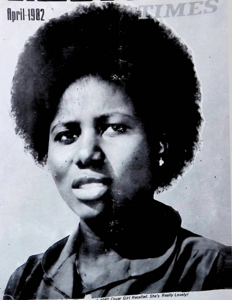
April 1982 Cover Girl Recalled. She's Really Lovely!