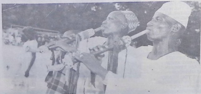
Traditional musicians in concert. Listen to 'Music of other Lands' on Mon. 23.03.