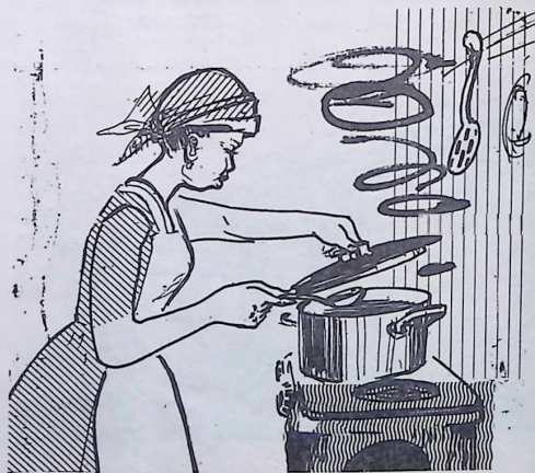
'Olobe lo loko' (Chit chat for women) is at 10.03 every Saturday.