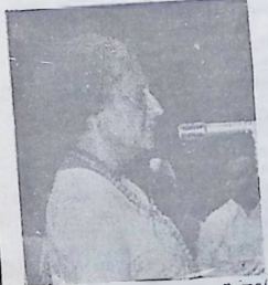
Mrs. Indira Gandhi, Indian Prime Minister.

These represent the immediate and long-term products of the dialogue between Nigeria and India at the Summit level in New Delhi.