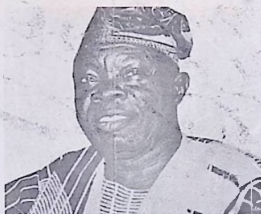
Alhaji Haruna Ishola, the Apala King.

I have observed that all the music slots on the programmes of Radio Nigeria Ikeja are dominated by Fuji music. While appreciating the fact that we should promote our local music industry, I also want to point out that Fuji is not the only Nigerian music. In this regard, Radio Nigeria Ikeja should not limit its choices to Fuji. Other brands of local music like calypso, highlife and apala should also be included.