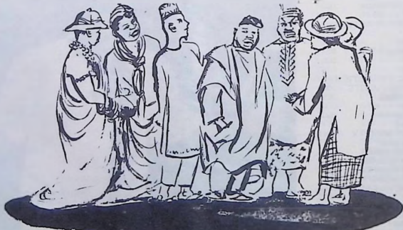
Nigerians in traditional costumes. "People and Events" is aired on Mon: 23.03