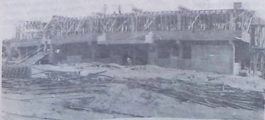
Jos Broadcasting House under construction. Steel production is going to boost the construction industry

The rolling mills will serve as nuclei for the development and propagation of small scale industries around their vicinity. They will supply spares and consumables such as conveyor belts, safety appliances, wire, ropes and slings to the rolling mills and beds, steel doors and window meshes, nails, barbed wires and pins to small scale, steel consuming industries.