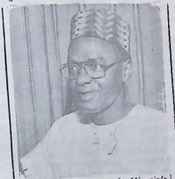
Alhaji Shehu Shagari, Nigeria's Executive President.