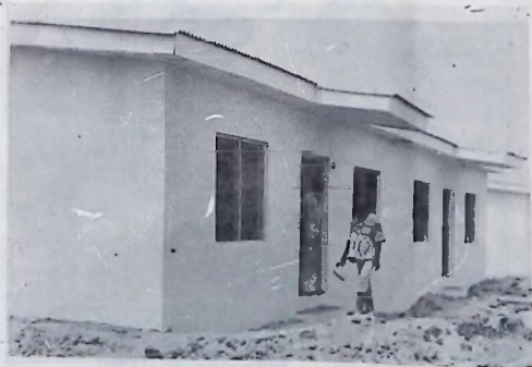
One of the Federal Government's low-cost housing units, June 16 Spotlight on the Federal Government on Thurs. 20.45