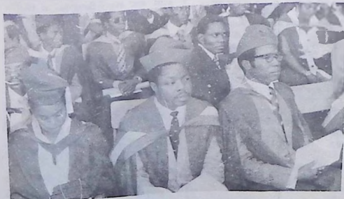
Graduands at a convocation ceremony An Open University will ease the competition for places in the Conventional universities.

It cannot be over-emphasized that the Open University will be the apex of mass education in Nigeria. For this and other reasons, all hands must be on deck to ensure that the Open University of Nigeria becomes a vibrant aspect of our educational life.