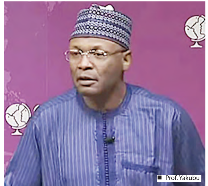
■ Prof. Yakubu

“We did so in Ekiti and Osun; it was fantastic and we’re going to do so nationwide,” Yakubu said.