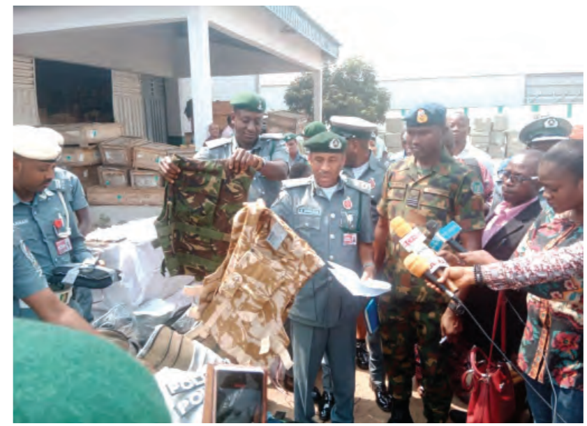
Customs officers showcasing seized military, police hardware at Lagos Airport

Authority in charge of the Murtala Mohammed Airport (MIA) Command of the Nigeria Customs Service, on Tuesday, said it intercepted military and police hardware at the cargo section of the domestic wing of the airport.