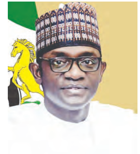
■ Governor Buni

"These facilities will no doubt improve the scale and volume of trade across the state thereby boosting the economy of individuals and the state government."