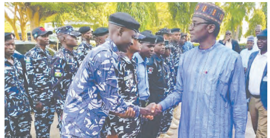
■ Gov Mai Mala Buni (In blue) while shaking hands with the new constable police recruits from Yobe State in Damaturu

Buni had since inception been encouraging indigenes of the state to participate in police, military among other paramilitary organisations with a view to filling the state's quota at the federal level.