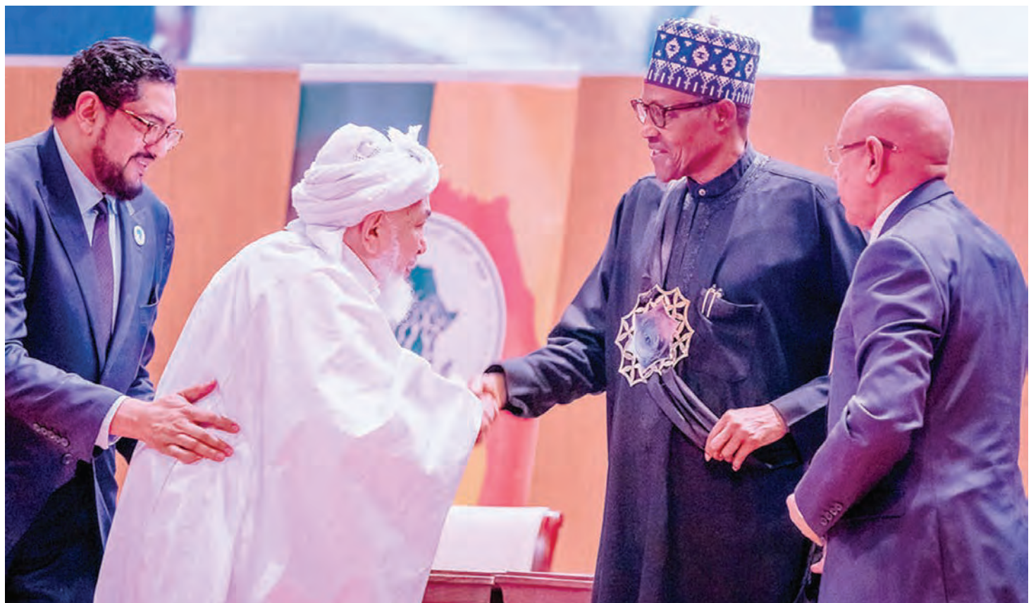
■ President Buhari (second right) with President of Mauritania Mohamed Ould Ghazouani, President of the Forum for Promoting Peace in Muslim Societies, Shaykh Abdallah Bin Bayyah and Secretary General of Abu Dhabi Forum for Promoting Peace H. E. Sheikh Al Mahfoudh Bin Bayyah as he receives Award for Strengthening Peace in Africa from Abu Dhabi Peace Forum in Mauritania yesterday