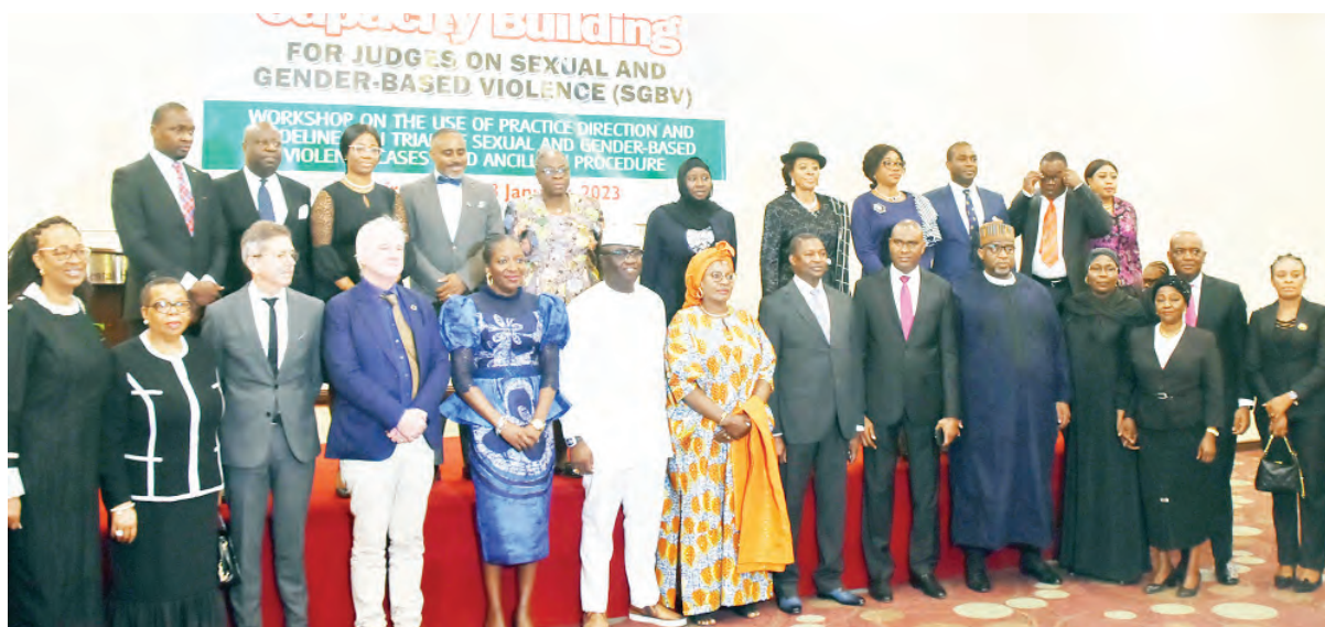
■ Attorney General of the Federal and Minister of Justice, Abubakar Malami (front row, 6th R); Minister of Women Affairs and Social Development, Dame Pauline Tallen (M); Minister of State for Budget and National Planning, Prince Clem Agba (6th L); Director-General, National Agency for the Prohibition of Trafficking in Persons, Dr Fatima Waziri (5th L) and Judges, during a Capacity building workshop for Judges on Sexual and Gender-Based Violence in Abuja yesterday

“While in 2022, N2.5 billion was budgeted out of which N691.8 million representing 27 per cent of the amount was spent. In total, the sum of N4.2 billion was budgeted for the construction and renovation of all public buildings in the last four years out of which the government was able to spend only N1.6 billion representing 38 per cent of the amount,” he explained.