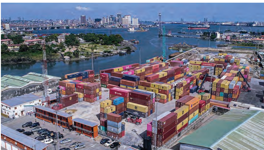
■ SIFAX Terminal in Ijora, Lagos State

SIFAX ICT explained that the terminal was able to achieve this feat due to collaborative efforts of all stakeholders.