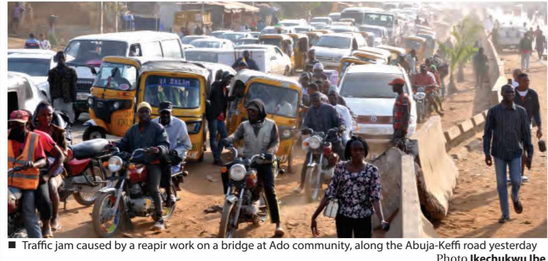
Traffic jam caused by a repair work on a bridge at Ado community, along the Abuja-Keffi road yesterday

She said the altercation snowballed into physical violence, which resulted in the armed man shooting the Uber driver and running away.