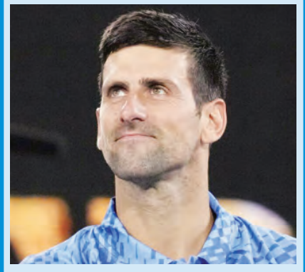
■ Novak Djokovic