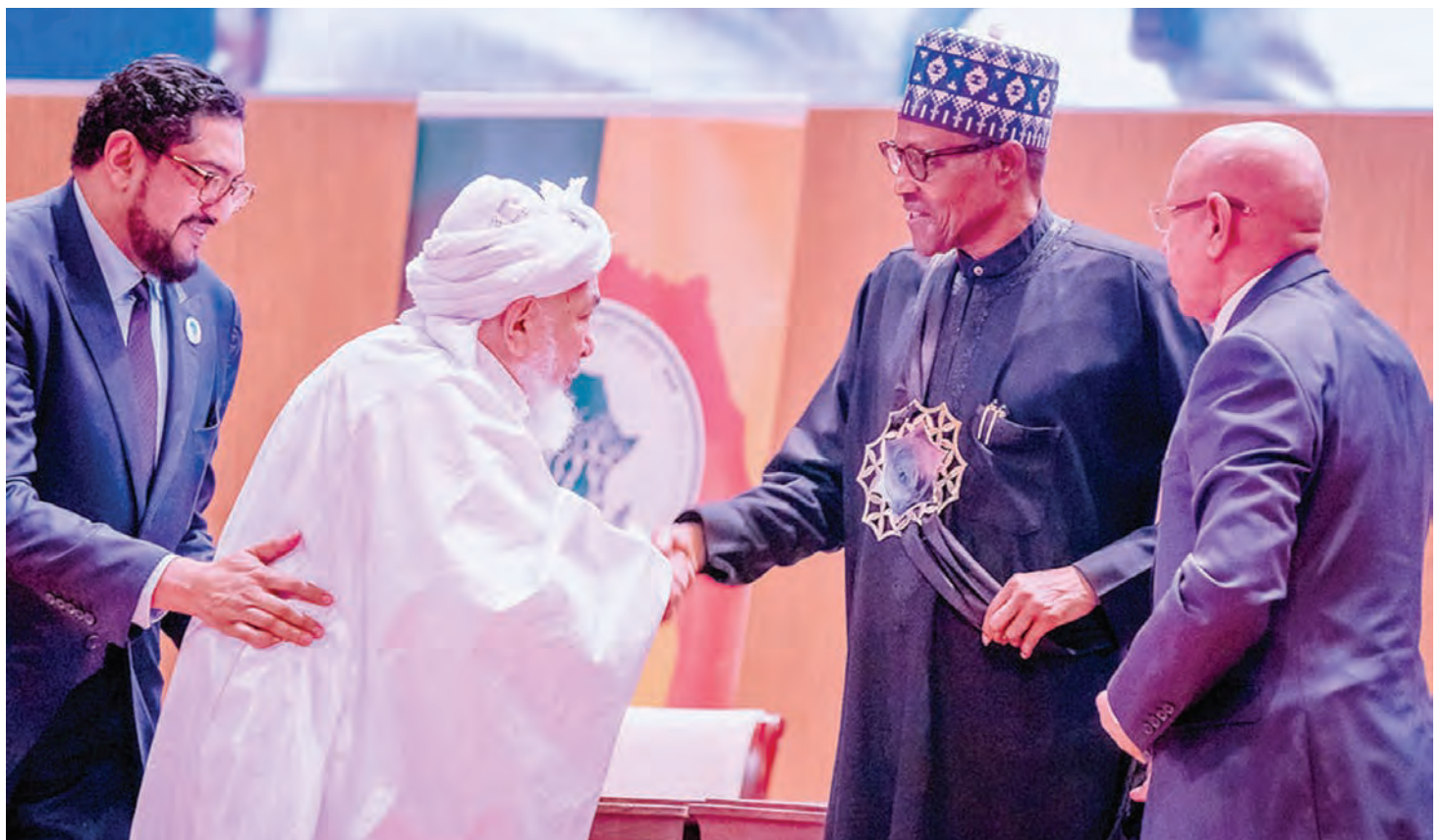
■ President Buhari (second right) with President of Mauritania Mohamed Ould Ghazouani, President of the Forum for Promoting Peace in Muslim Societies, Shaykh Abdallah Bin Bayyah and Secretary General of Abu Dhabi Forum for Promoting Peace H. E. Sheikh Al Mahfoudh Bin Bayyah as he receives Award for Strengthening Peace in Africa from Abu Dhabi Peace Forum in Mauritania yesterday