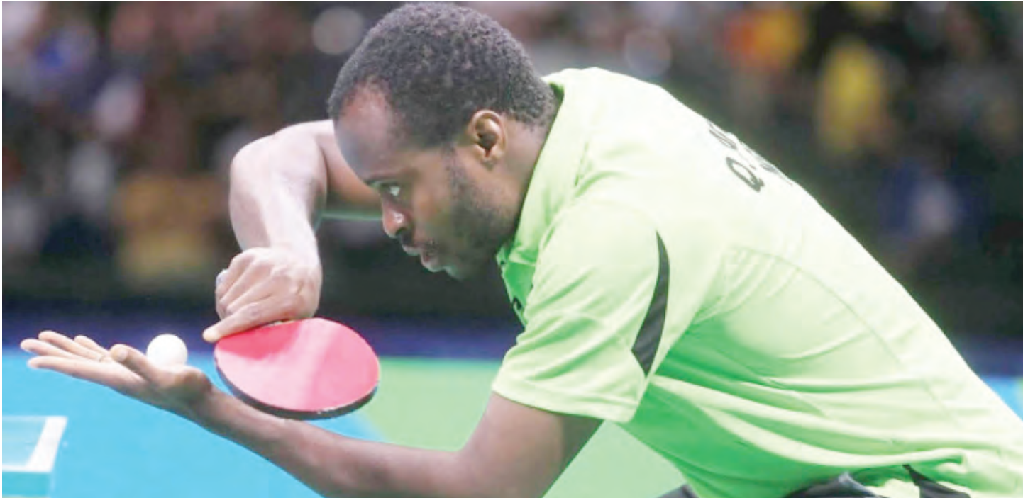
■ Africa's leading table tennis player, Aruna Quadri prepares to serve during a match