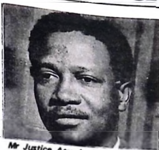
Mr Justice Atanda Fatai-Williams the newly appointed Chief Justice of the Federation.