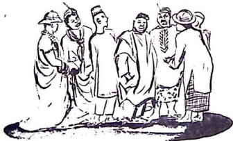
A cross-section of Nigerian community showing the different culture but emphasising unity.

Not only will the State project to enhance Nigerian culture, but will ensure that the Press, radio, television and other agencies of the mass media shall at all times be free to uphold fundamental objectives and uphold responsibility and accountability of Government to the people. The National ethic shall be based on Discipline, Self-reliance and Patriotism.