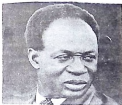
Dr. Kwame Nkrumah

But to say Raphael, an Italian painter, Balzac, Le Pere Goriot, French novelists, or Richard Wagner, German poet, are among the great events, is unacceptable. These men could have