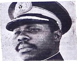
General Obasanjo, the outgoing Head of State.