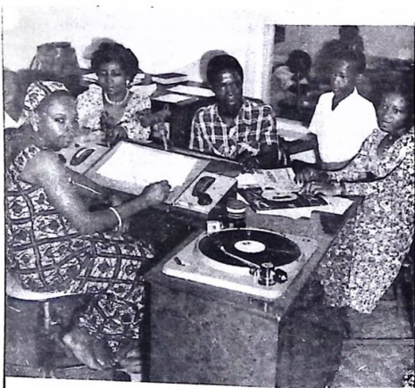
A panel for NKA NDITO, magazine programme for Efik-speaking children on FRCN, Enugu.