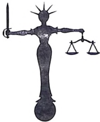
Emblem of Justice.

Under the Presidential System, the Constitution provides for the establishment of various courts in the Federation, to effect this equation.