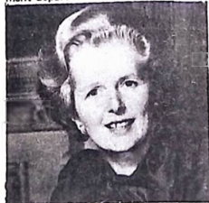
Mrs. Margaret Thatcher, British Prime Minister.

It is relevant to re-state Nigeria's assurance to all foreign companies operating in this country that they have nothing to fear as long as they respect the policies of this nation, especially Nigeria's uncompromising stand on the Southern African issue.