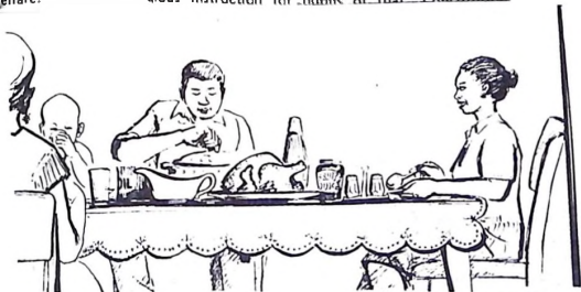
Members of family dining on the table. — right to family life guaranteed.

The rights of the individual as regards freedom of movement, freedom from discrimination, compulsory acquisition of property, restriction on and derogation from fundamental rights and special jurisdiction of High Court and legal aid are all provided for in the Constitution.