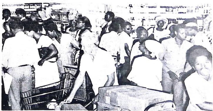
A very busy day in a Ligos department store. FOR SHOPPERS can be heard on FRCN Lagos at 0903 on Saturdays.