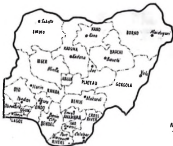
Map of Nigeria showing States and their capitals.

AFTER 13 years of military rule Nigerians are, this month, witnessing the birth of the Second Republic with a democratically elected government under the Presidential System. The Radio/TV Times salute all Nigerians for their dedication and hard-work that have made possible the journey to this all-important milestone. We congratulate the first Executive President of our Great Nigeria. We salute all the elected members of the various arms of government for their good fortune of being chosen to serve the country at higher levels. We exhort those who lost in the elections to serve this nation loyally in any other areas of endeavour. Nigeria and Nigerians appreciate the dedication and devotion of the armed forces personnel who gave their energy and lives to put right the affairs of this country and in handing-over the reins of government to the people. Let us remind those elected, of the trust and enormous responsibility the people of this country have placed on them. It is our hope that they will realise that their primary duty and allegiance lie with Nigeria and Nigerians in the first instance. Because throughout the electioneering campaigns they promised the people of this country many good things