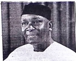
Dr. Nnamdi Azikiwe, first President under Parliamentary system.