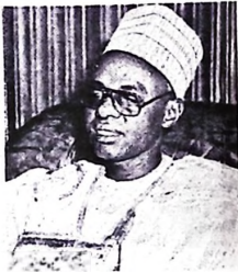
Alhaji Shehu Shagari, the first Executive President

The Executive powers shall also extend to the execution and maintenance of the Constitution, all laws made by the House of Assembly of the State and to all matters with respect to which the House of Assembly has for the time being power to make laws. Such executive power shall, however, be so exercised as not to impede or prejudice the exercise of the executive powers of the Federation or to endanger the continuance of a Federal Government in Nigeria.