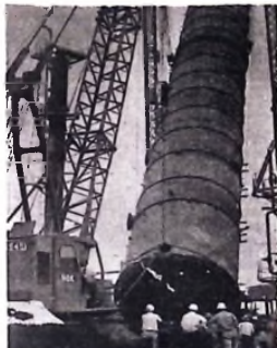
An 80-ton steel which forms part of oil Refinery structure in Alasa Elemo, Port Harcourt.

Mrs. Thatcher's devoted support for the apartheid regime and Muzorewa's puppet administration are very well-known. In the face of this indiscrete