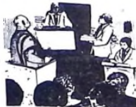
A law Court in session

Moreover, the judicial powers shall not, extending to any action or proceedings relating to any existing law made on or after 15th January, 1966 for determining any issue or question as to the competence of any authority or person make any such law.