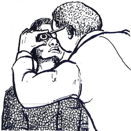
An Optician examining a patient's eye.

But the greatest hopes are pinned on the continued study of the sclera. It is vital to discover which of its metabolic processes is responsible for the changes resulting in progressive myopia. Hence a bridge towards practice — a search for more potent medicaments.