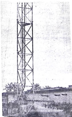
A section of NTV Port-Harcourt.