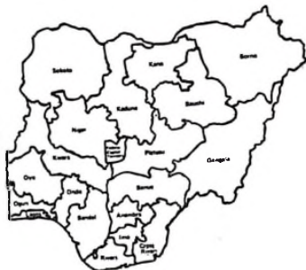
Map of Nigeria showing 19 States

It was timely that the Ambassadors and High Commissioners were brought home to be briefed at the period when the elections were in progress. This has put them in a position to know how the elections were conducted and be able to counter any false impression which might be created abroad.