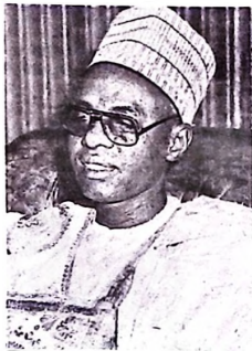
The first Executive President, Alhaji Shehu Shagari

Introduced to you hereby is Mr. President — Alhaji Shehu Shagari: