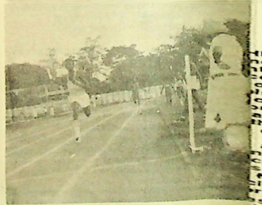
Picture shows Imo State finishing first in the 4 x 400m relay (men) with 3:25.0 secs. Behind is Brown, finishing second for Rivers with a time of 3:27.2 secs.