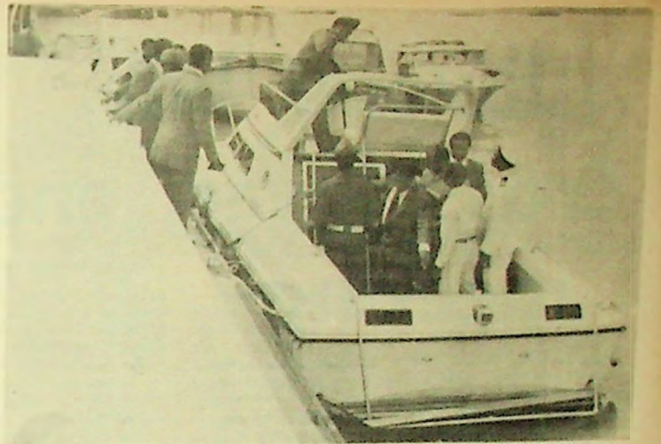
Recently the Military Governor of Cross River State, Col P Uluoma Omu, inspected a number of projects within the capital territory including doctors quarters and TV project and mobile clinic (marine). Picture shows the governor inspecting the riverine mobile clinic jetty.

to reach him NOT LATER THAN 8TH MARCH, 1978.