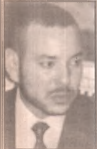
King Mohammed VI of

They pointed out, however, that in 1978 the Moroccan parliament approved the creation of a national institute for Berber studies, but the institute was never set up.