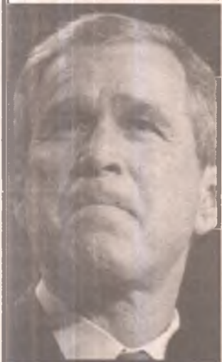
George W. Bush US President.

A White House statement issued on Monday said the administration approved of the development of cell- and tissue-based therapies based on research involving the use of nuclear transfer or other cloning techniques to produce molecules, DNA and cells other than human embryos, tissues, organs, plants or animals.