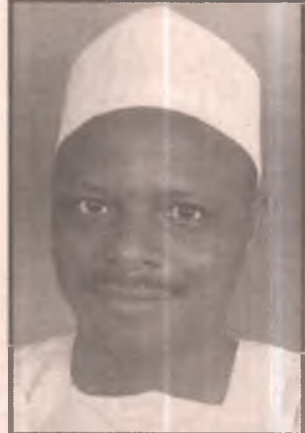
Gov. Rabiu Kwankwaso