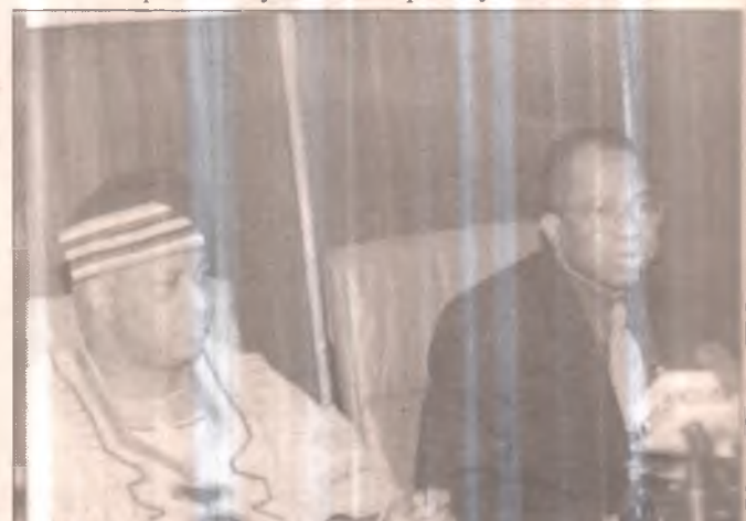
L-R: Minister of Power and Steel, Dr. Segun Agagu and Minister of Transport, Chief Ojo Maduekwe during the press briefing on the outcome of the Federal Executive Council (FEC) meeting held at the State House, Abuja... yesterday.