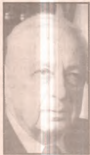
Ariel Sharon, Israeli Prime Minister.

the attack on Tuesday, as thousands of Palestinians took to the streets in the West Bank and Gaza and clashes broke out in various areas.