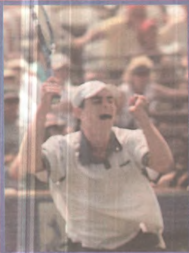
Ecstatic: Tennis rising star, Andy Roddick of United State in a hysieric mood after defeating Pete Sampras...recently.