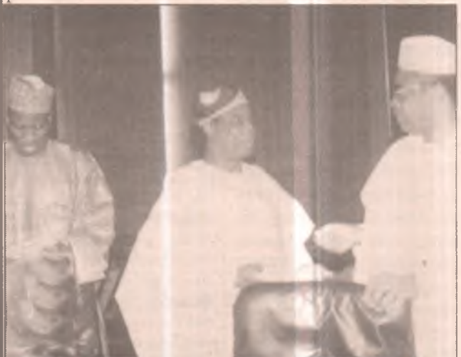
L-R: The Minister of Communications, Dr. Mohammed Bello Haliru, the Minister of State for Communications, Alhaji Haruna Elewi and the Minister of Defence, Lt-Gen. T.Y. Dajuma (rtd) discussing during the Federal Executive Council meeting held at the State House, Abuja... yesterday.

He explained that with the introduction of the Universal Basic Education (UBE) programme, the new bill will make it compulsory for parents to send their children ward to school, failure of which would attract a stiffer penalty.