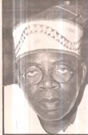
Gov. Bola Tinubu

Meanwhile, further hearing has been fixed for October 5, 2001.