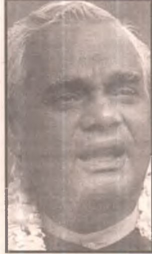
Atal Bihari Vajpayee, Indian Prime Minister.

Earlier in the year, his government was also embarrassed by an arms bribery scandal, which led to the resignation of the defence minister.