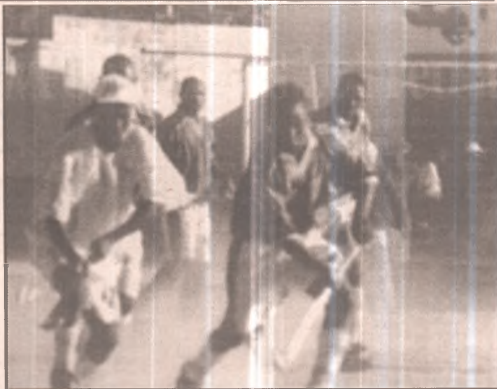
Abia and Lagos State hockey teams in action at last year's National Sports Festival in Bauchi.

"As soon as we settle down, we shall open discussion with all our friends in the corporate world, as we can't do without them," he submitted.