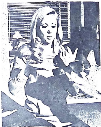
Ovarid, Glaxo's new contraceptive pill for dogs, being administered to an Alsatian bitch.

The technique of controlling or synchronising oestrus or "heat" in ewes also makes it necessary to have one ram for every ten to 20 ewes.