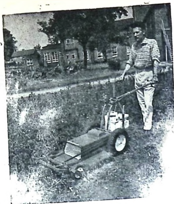
This 23 in (584.2mm) rotary grasscutter is recently introduced by a British firm. Powered by a 5 hp, four stroke engine, the machine is designed to fill a gap between the smaller domestic grasscutter and the large professional model. Controls are placed conveniently on the handles which can be adjusted to the height of the user. Manufacturer: Walsley Engineering Ltd., Electric Avenue, Wilton Birmingham 6, England.

Next time, we shall talk out preparing the ground.