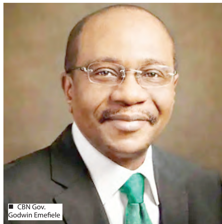
■ CBN Gov. Godwin Emeifele

an official of the bank, Shamsuddin Zubair Imam, said any currency, even the US Dollar, is expected to produce the ink mark when rubbed on a white material as a sign of its authenticity.