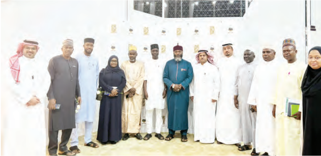
■ Officials of NAHCON and Saudi Ministry of Hajj and Umrah after a strategic meeting held on the sidelines of Hajj and Umrah Expo in Jeddah, Saudi Arabia