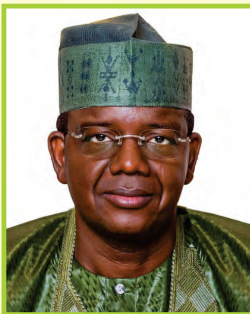
His Excellency, Hon. Dr. Bello Mohammed Matawalle MON Executive Governor of Zamfara State

He said the Governors having security concerns in their states know the role being played by Yusuf Bichi in tackling the security challenges in those states and would do everything humanly