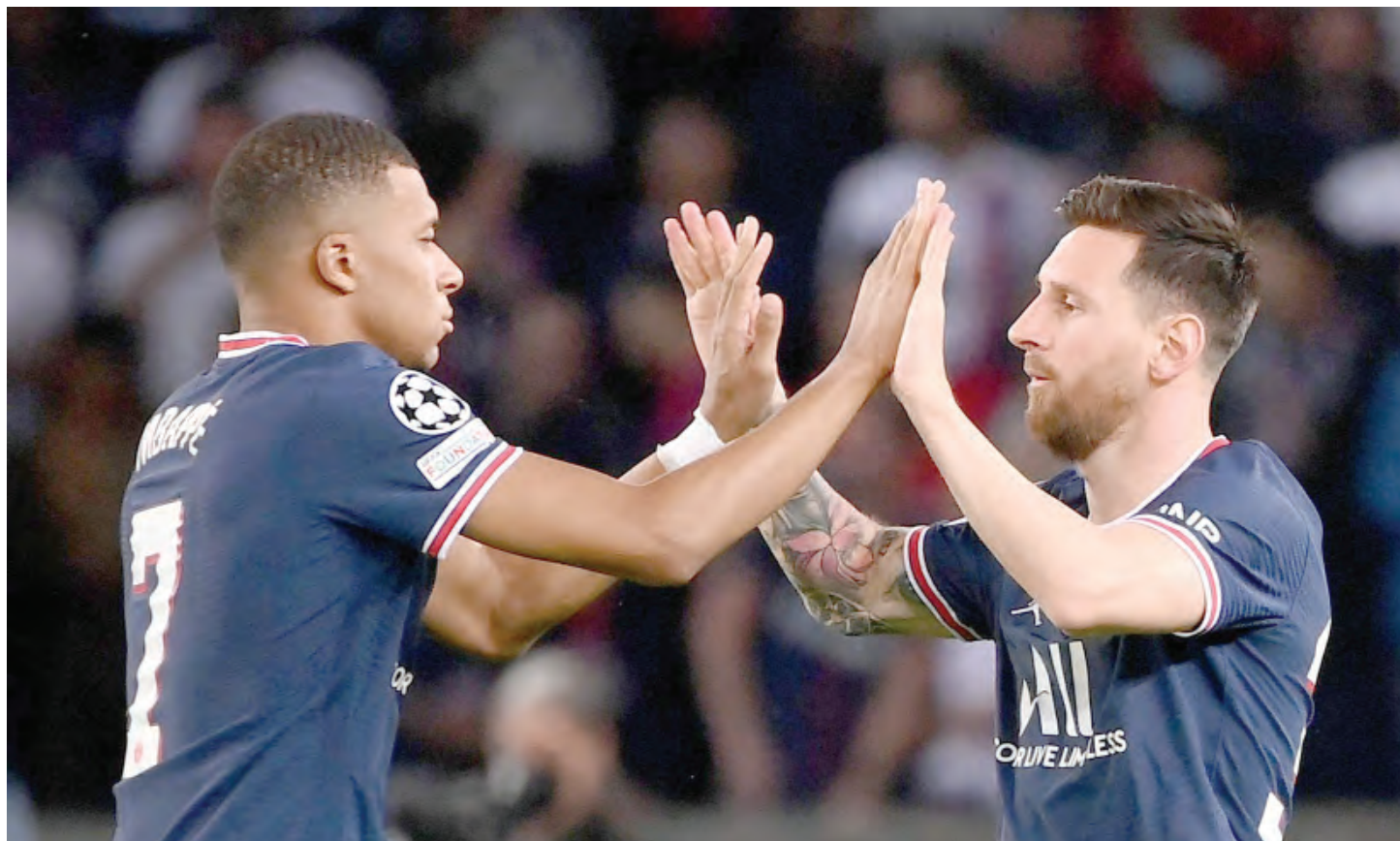
■ PSG star players, Lionel Messi (R) and Kylian Mbappe