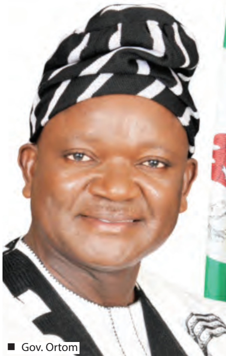
■ Gov. Ortom