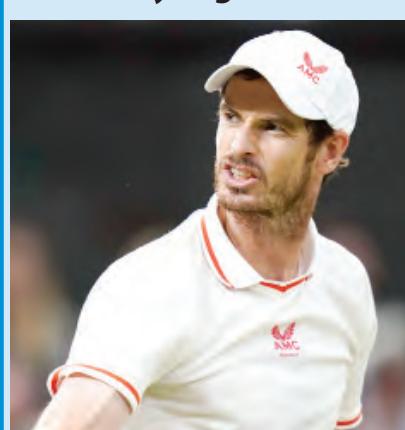
■ Andy Murray

Andy Murray and Taylor Fritz applied a final layer of gloss to their pre-Australian Open form Thursday with straight-sets wins at the Kooyong Classic.