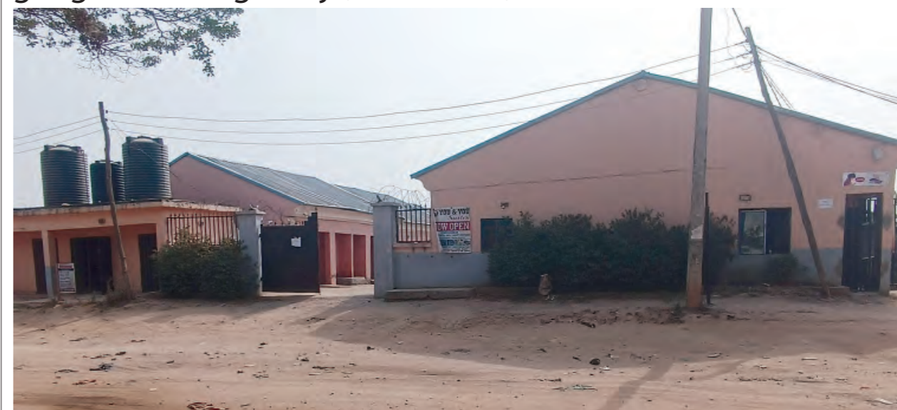
■ Front view of the hotel