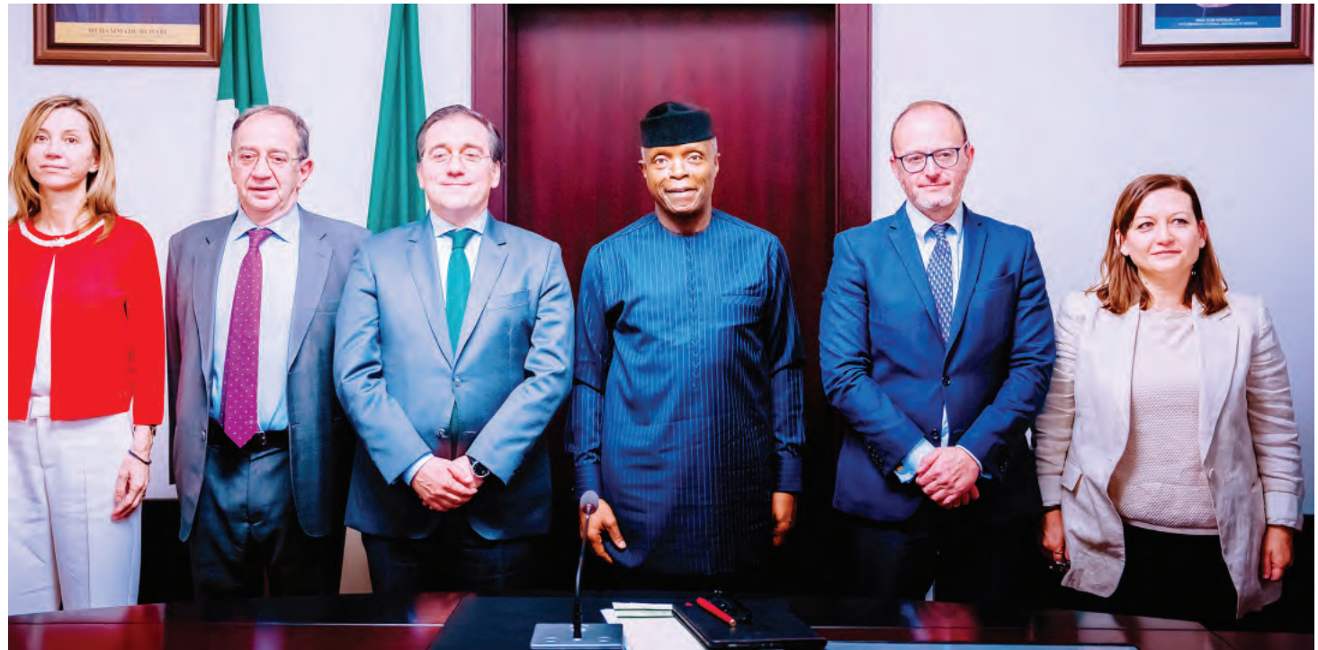
■ Vice President Yemi Osinbajo (third right), receives in audience the Minister of Foreign Affairs, European Union and Cooperation of the Kingdom Of Spain, H.E. Jose Manuel Albares, (third left), when the latter led some delegates to the Statehouse, Abuja yesterday

Governor Ganduje, who currently enjoys the