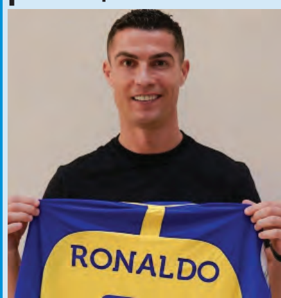
■ Cristiano Ronaldo

A Saudi Arabian businessman is leading a bid to watch the latest chapter in Cristiano Ronaldo and Lionel Messi's celebrated rivalry in global soccer with a 10 million riyals ($2.66 million) offer for a ticket to a showpiece game.