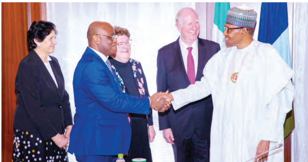
■ President Muhammadu Buhari (right) received Universal Peace Federation international Delegation UPF, at the State House, Abuja yesterday