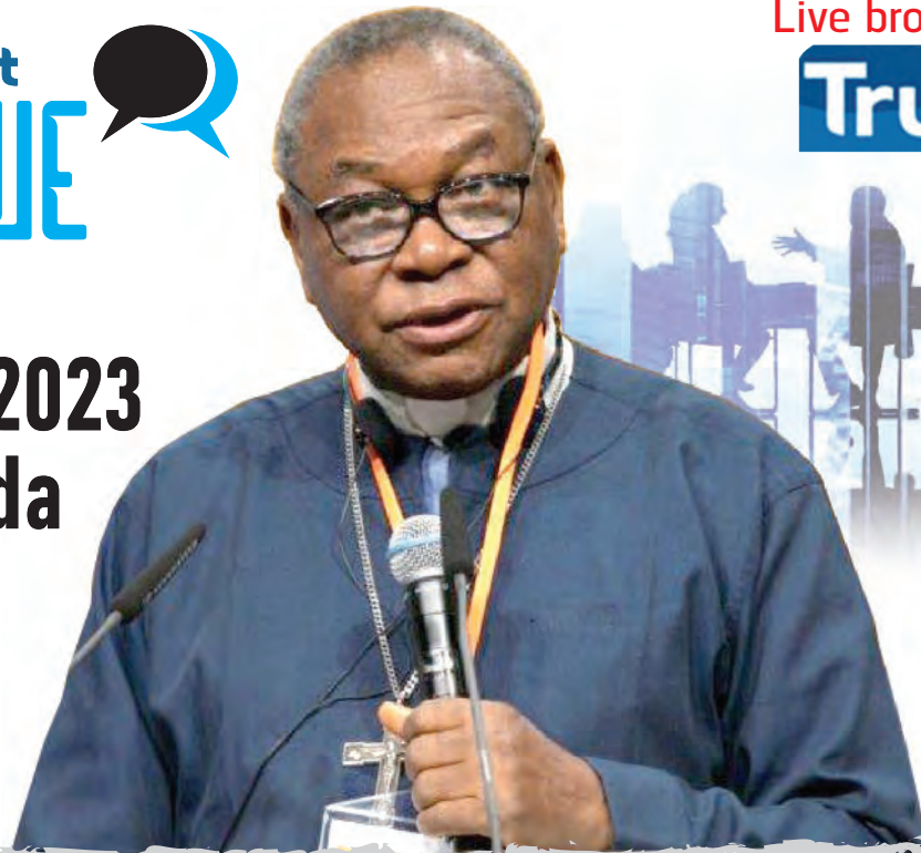
John Cardinal Onaiyekan Archbishop Emeritus of Abuja. CHAIRMAN OF THE EVENT