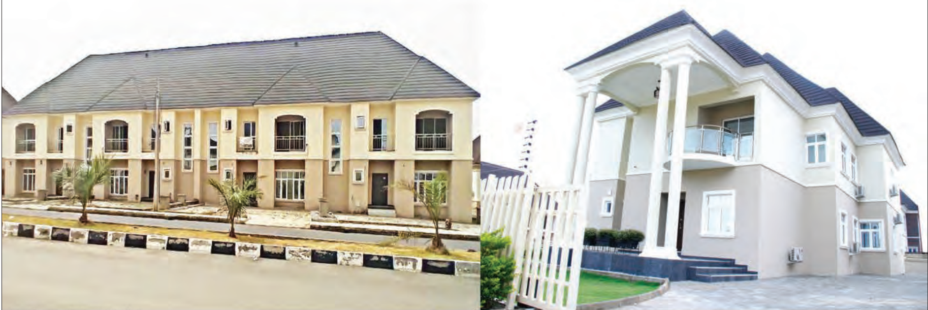
5 Bedroom Terrace Duplex