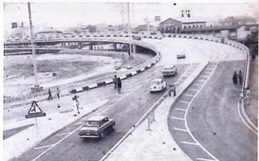
The 19m. Eko bridge was opened on Feb. 8 by General Gowon. The span across the bay is 5,000 feet, but with approaches the bridge is three miles long.