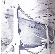
The snow-covered Elder Dempster liner Aureol has sailed from Liverpool with a complement of 259 first class and 117 other class passengers, for the 13-day voyage to Lagos. Several tourists are among the passengers.