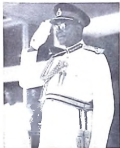
Dr. Azikiwe as President of Nigeria.

Many conflicts no less domestic in character than that in Nigeria had been referred to the UN, said Dr. Azikiwe. "I refer to matters affecting Africa (Algeria, Congo Kinshasa, Rhodesia, South Africa, and South-West Africa), Asia (Kashmir, North and South Korea, North and South Vietnam, Tibet), Europe (Cyprus, Gibraltar, Portugal) in respect of its colonies, and Spain in respect of its colonies."