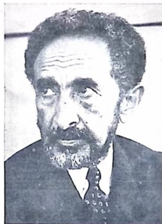
The Emperor at ECA.