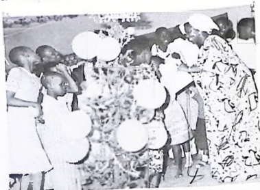
Some of the handicapped children dancing to the tune, of the Band.