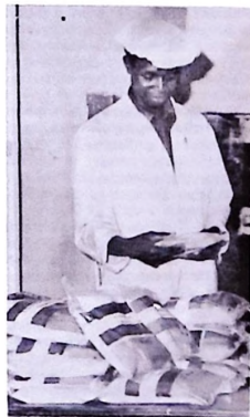
A Staff busy loading gari inside bags.

However, this picture is likely to change as more Nigerians move from the traditional merchandising business into manufacturing. The Institute therefore has to be prepared to meet these new challenges. The only way it can do this, is through adequate facilities and manpower.