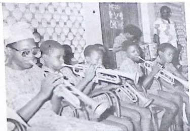
Members of the Band of the Pacelli School for the Blind in attendance.