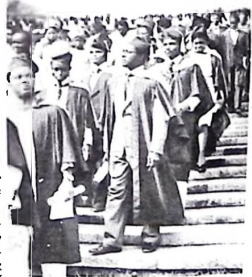
University students at graduation convocation.

Education therefore, should build the citizen not only as an economically useful entity, but also as a morally sound and patriotic member of the society.