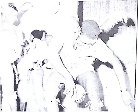
Atilogu Dancers, Cultural Features every Thursday at 1615hrs.