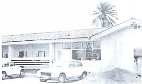
Radio Lagos Building