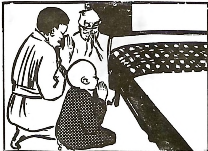
Family Prayers, Saturday at 0540hrs.