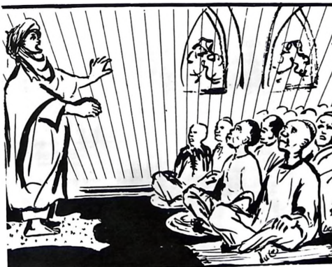
Muslim Sermon every Friday at 0615 Rpt Fri, 1230hrs

0530 STATION CALL SIGNAL 0531 NATIONAL ANTHEM, PLEDGE AND OPENING ANNOUNCEMENT 0532 READING FROM THE HOLY QURAN 0547 PROGRAMME PARADE IN ENGLISH AND HAUSA 0600 NEWS AT DAWN 0603 MOMENT FOR THOUGHT FROM THE NIGERIAN EDITORIALS 0605 MOSLEM SERMON (RPT FROM FRI 1230)HRS 0645 STATE NEWS IN BRIEF 0650 SHORT AND SWEET 0700 NATIONAL NETWORK NEWS 0715 NEWS ANALYSIS 0720 BARKA DA JUMMA'A - A REQUEST PROGRAMME IN HAUSA 0800 NEWS SUMMARY IN KANURI HAUSA AND FULFULDE 0815 YAKAMUASO - HOUSEWIVES PROGRAMME IN KANURI (RPT FROM WED 1615)HRS 0845 ZABEN MAI GABATARWA 0900 DON IYAIEN KU - A FAMILY REQUEST PROGRAMME IN HAUSA 1000 INDIAN MUSIC BY D.C.A. 1030 INDA ACE - A LIGHT HEARTED ENTERTAINMENT PROGRAMME IN HAUSA (RPT FROM SUNDAY 1730)HRS