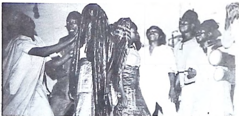
'Kalangu Music' on Sunday at 10.15hrs.