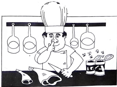
Cooking Time Sunday at 5.00.