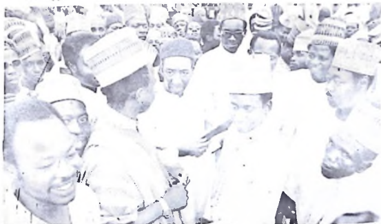
A cross section of guests with faces showing excitement, during the opening of Radio Abuja.