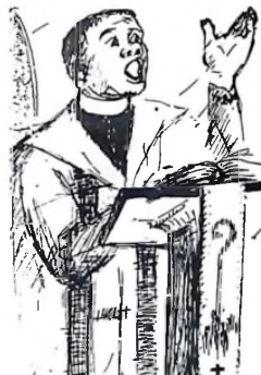
Awake my soul, at 05.40

14.08 Break From Books (Cont'd.) 14.30 Africa This Week 14.45 In The Court-Yard (From: Fri. 14.45) 15.00 News On The Hour 15.03 Public Opinion (Rpt. Sun. 11.03) 15.30 Tue To Life (From: Thurs. 08.15) 15.45 Of Music And Men (Rpt. Tues. 20.45) 16.00+ Network News 16.15 Interlude 16.30 Sports Pavilion 18.30 Highlife (From: Wed. 16.30) 19.00 The News 19.10 News Analysis (From: Fri. 22.15) 19.15 Africa This Week (From: 14.30) 19.30 With One Accord (From: Fri. 21.45) 19.45 Gandu Street (From: Wed. 09.45) 20.00 News About Africa 20.05 Nigerian Rhythms 20.30 Meet The Sirens 21.00 News On The Hour 21.30 Moment For Thought (From: 06.55) 21.06 Programme Information/Interlude 21.10 Cultural Feedback (From: Fri. 20.45) 21.45 Youth And Islam 21.40 Piano Music 21.50 Benediction 22.00+ Network News 22.15 News Analysis (Rpt. Sun. 07.15) 22.20 Join The Bandwagon (From: Sun. 11.30) 22.50 Spiritual Reading 23.00 News On The Hour 23.03 Dance Time (Rpt. From: Thurs. 18.03) 00.00 News At Mid-Night 00.05 Closing Announcements 00.05.30 National Pledge And Anthem