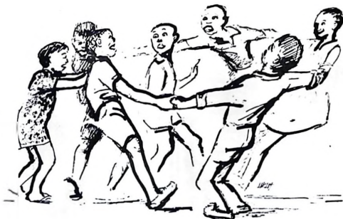
TALO WA N'NU OGBA NA, Saturday at 6.00 hrs.