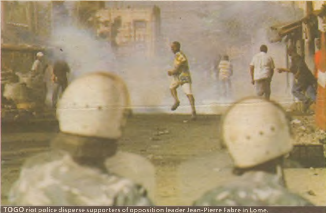
TOGO riot police disperse supporters of opposition leader Jean-Pierre Fabre in Lome.