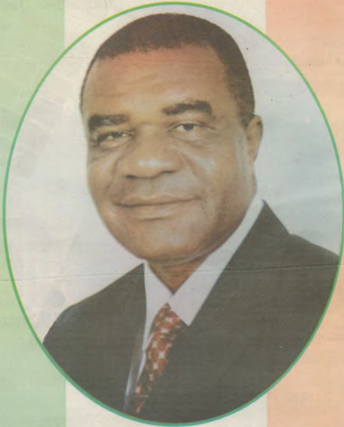
PRINCE VINCENT OGBULAFOR NATIONAL CHAIRMAN, PDP

The PDP family in Jigawa State felicitates with our National Chairman, Prince Vincent Ogbulafor, OFR, on the conferment of an Honourary Doctorate Degree.