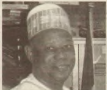
GEN Aliyu Gusau

WE pray to Allah Almighty to help us. Changing the security adviser will not change the situation, let the government do something drastic about the security situation in the country. Nobody is above the law.