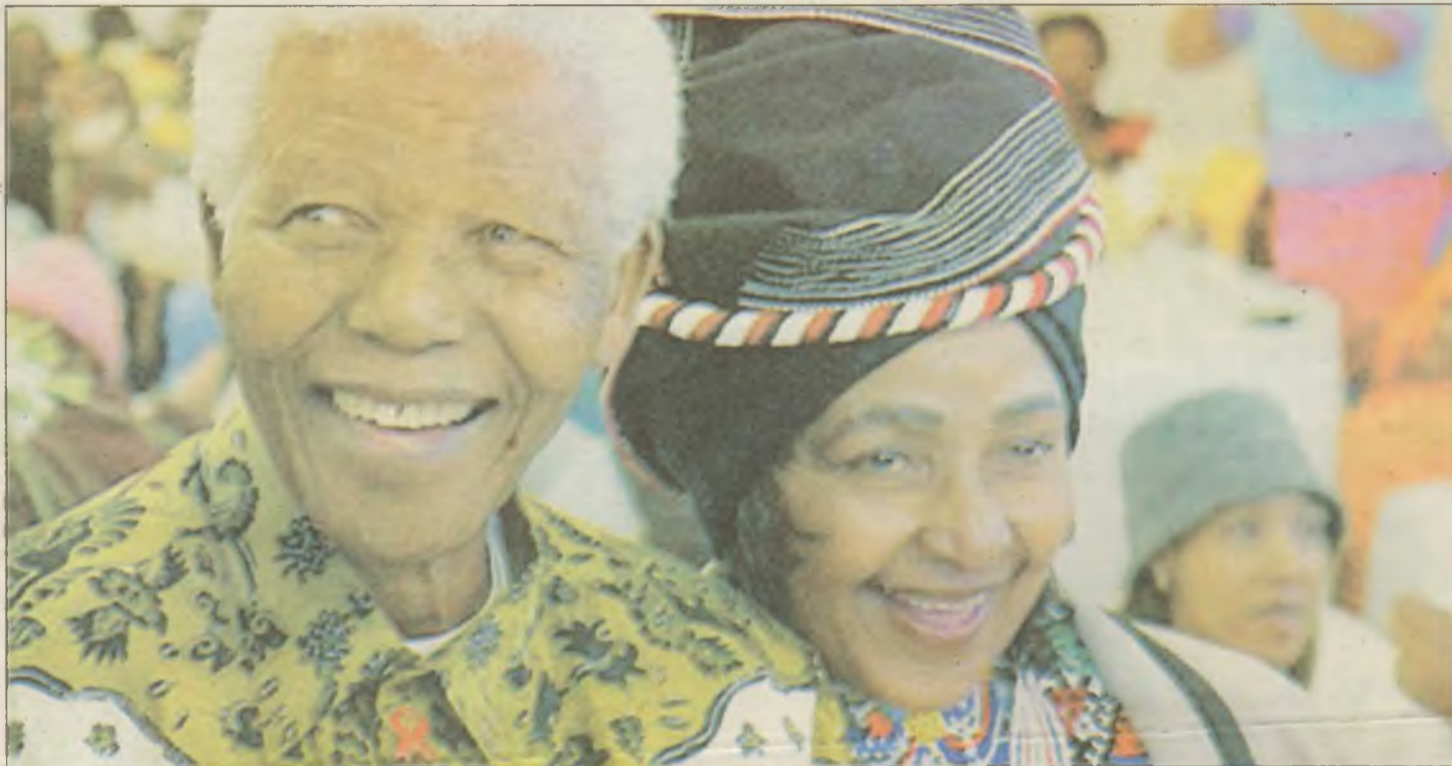
NELSON and Winnie Mandela in 2004

N elson Mandela has been accused by his former wife of betraying South Africa's black population.