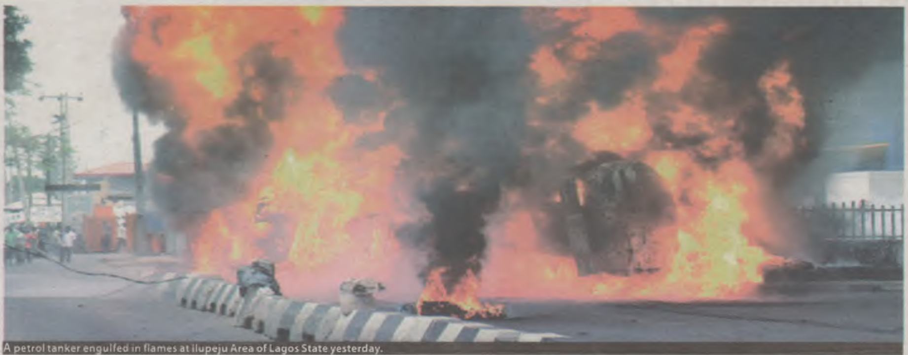
A petrol tanker engulfed in flames at Ilupeju Area of Lagos State yesterday.