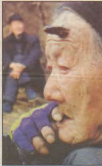
HORN is 6 cm long

'Now something is also growing on the right side of her forehead. It's quite possible that it's