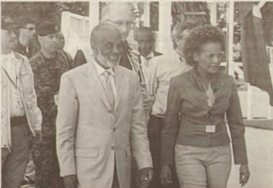
HAITIAN president Rene Preval welcoming Canadian Governor General Michaëlle Jean (R) in Port-au-Prince.