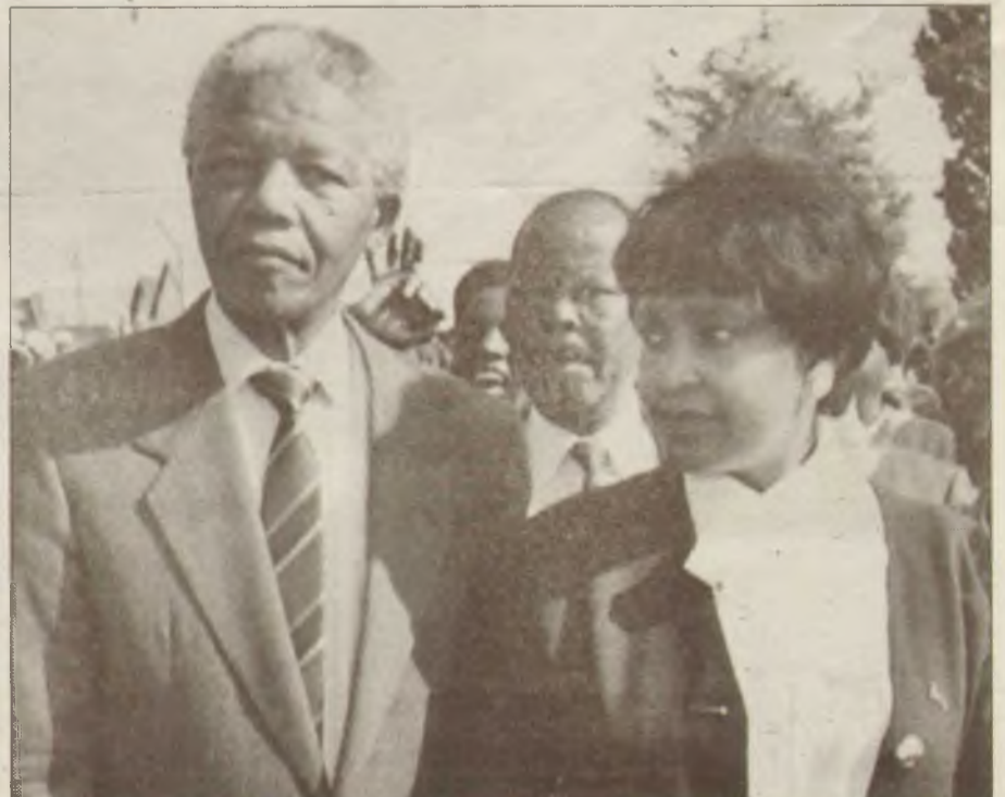
THE pair pictured together in 1990