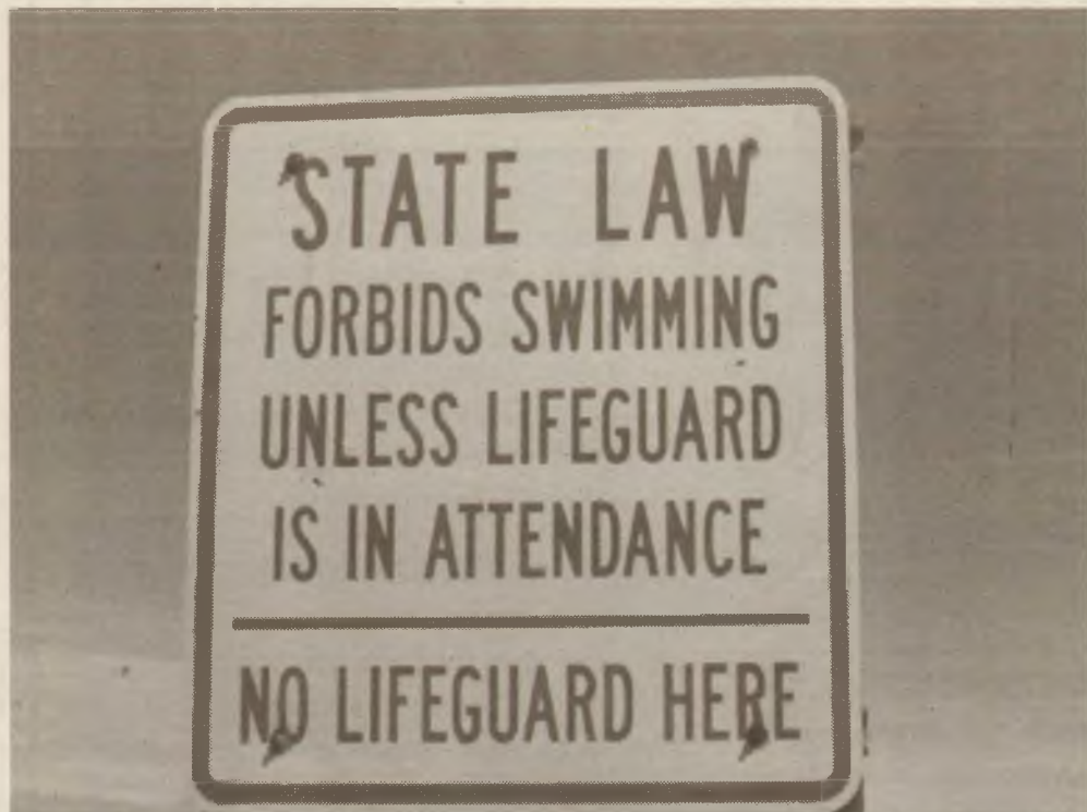
Wouldn't a "No swimming" sign do? Photo location: Westfield, New York, USA, by Rod Nevin Culled from www.signspotting.com