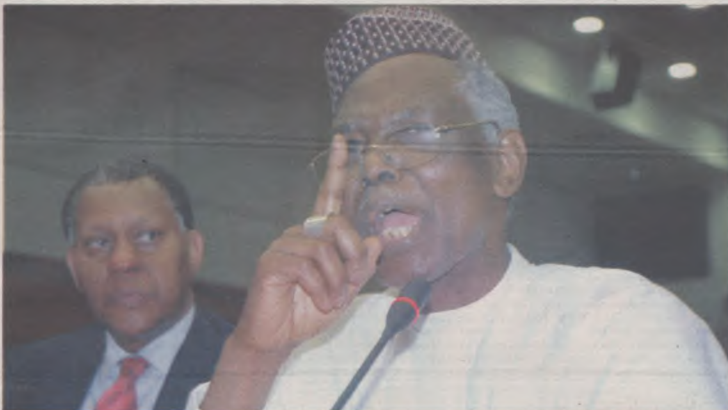
MINISTER of Petroleum Dr Rilwanu Lukman (right) and Minister of State for Petroleum Mr Odein Ajumogobia at a meeting with the House Committee on Petroleum Resources (Down Stream) in Abuja yesterday.