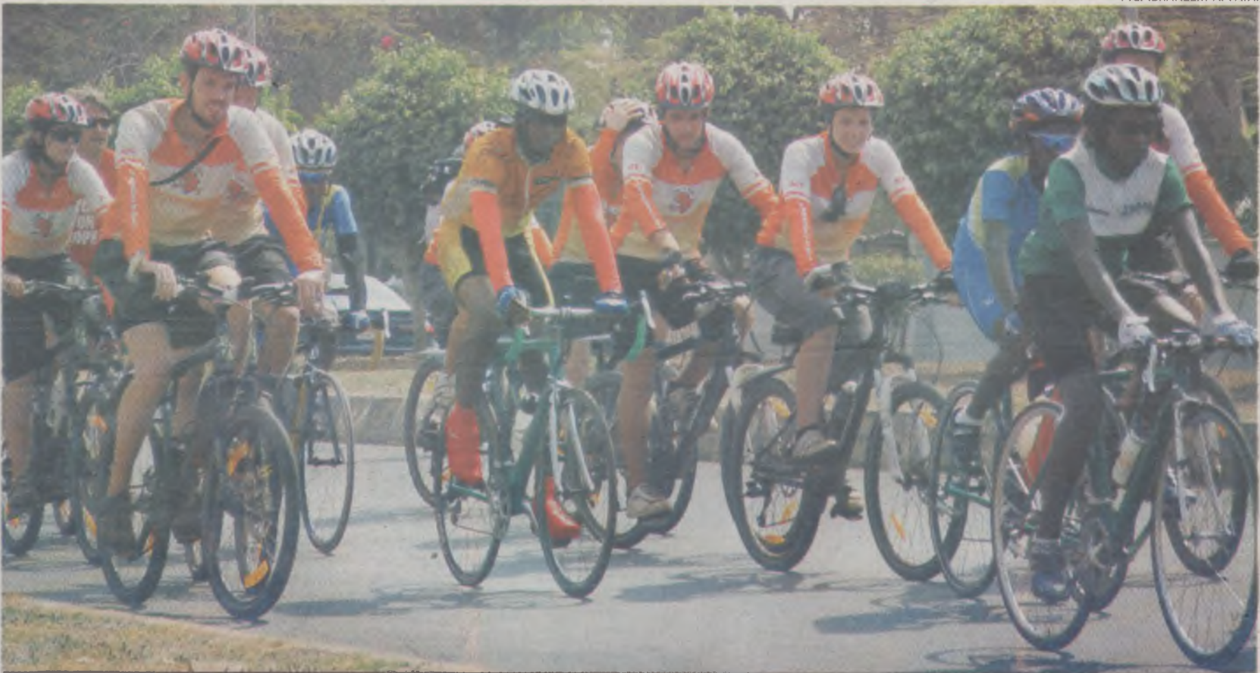
CYCLING for hope... After spending seven days touring Lagos, the Cycle for Hope Tour entered Abuja yesterday. The 15,000km journey which commenced last December in Tangier, Morocco will terminate in Cape Town, South Africa on June 10 ahead of the World Cup finals.