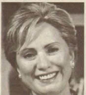
US Secretary of State Mrs Hillary Clinton

tians massacred Muslims in Jos? Is it now that the Christians are the victims that she will call for the perpetrators to be punished?