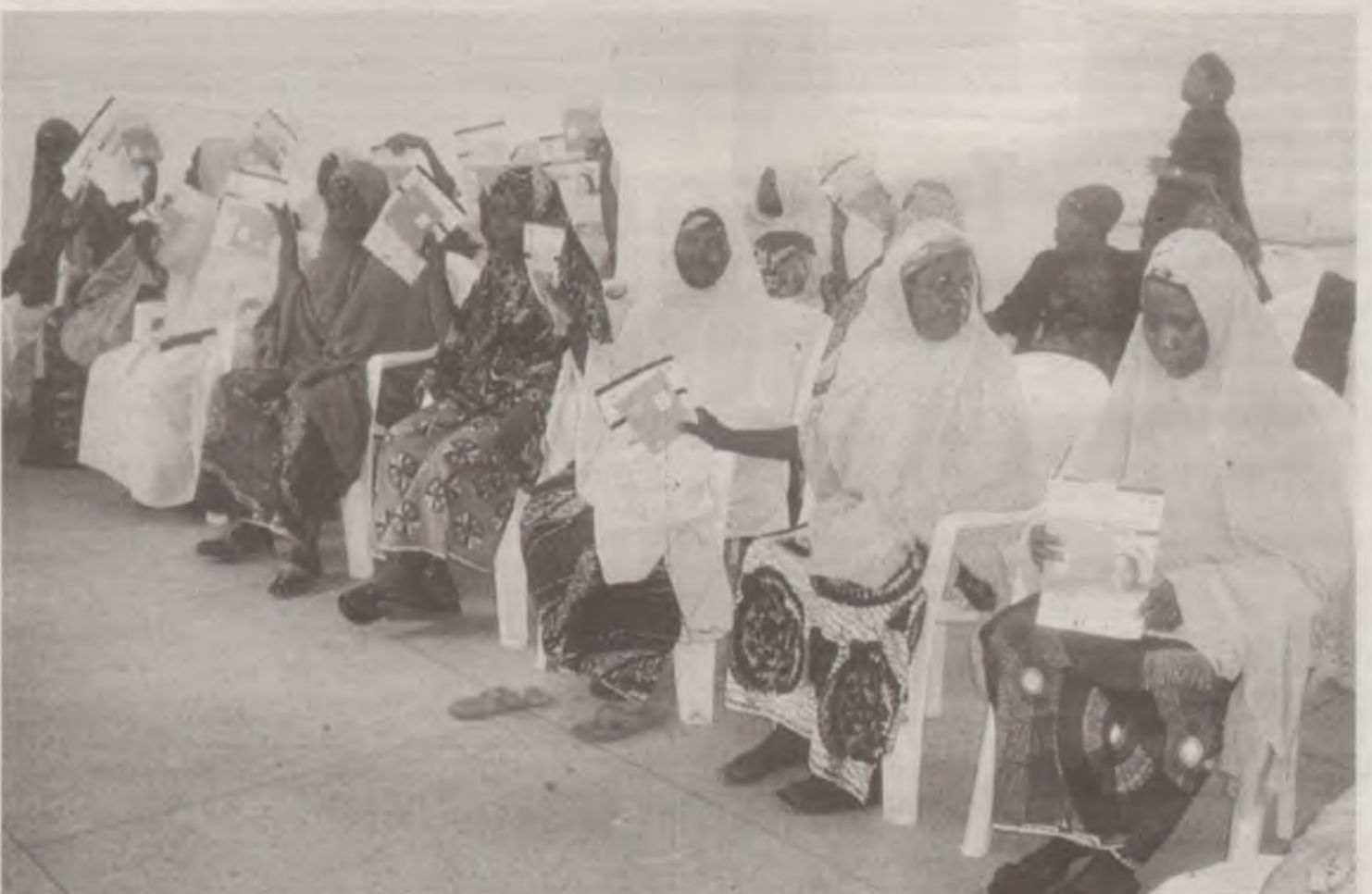
CROSS-SECTION of the rural women during a free breast screening for 100 rural and urban women at the Garki Specialist Hospital, Abuja, organized by the International Cancer Centre in Abuja on Tuesday.