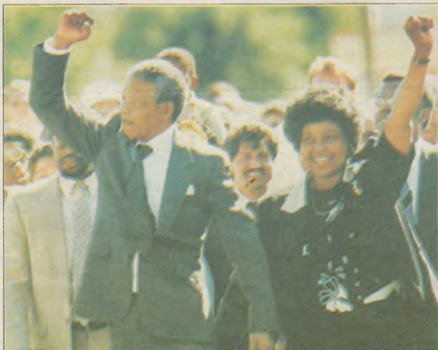
NELSON Mandela and wife Winnie walk hand-in hand after Mandela's release from prison