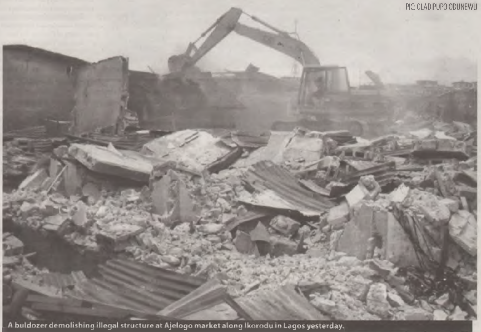
A bulldozer demolishing illegal structure at Ajelogo market along Ikorodu in Lagos yesterday.

"This is a poverty focused intervention for the grass roots people in Nigeria", she stated, adding that the project would assist Nigerian NSAs that were fostering pro-poor policies to enhance their service delivery. She said projects to be carried out would be in the areas of peace and security, governance and human rights, water and sanitation as well as environmental protection and climate change.