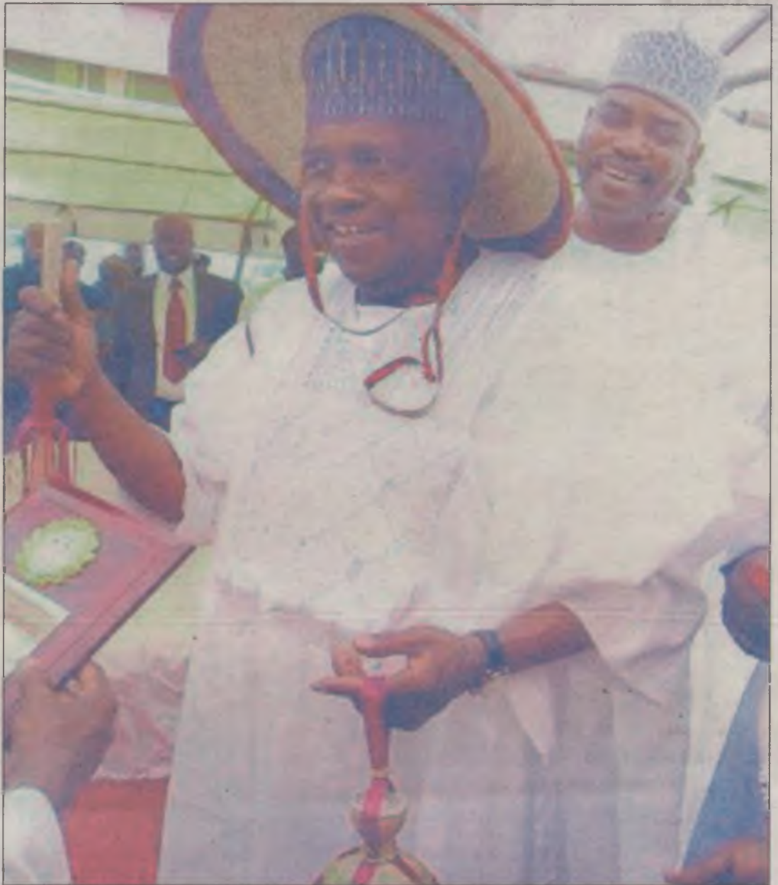
GOVERNOR Muhammad Danjuma Goje of Gombe State soon after he was turbaned as the Garkuwa of Fulani Herdsmen by the state chapter of Miyetti Allah Cattle Breeders Association of Nigeria during the first Gombe State Farmers Day.