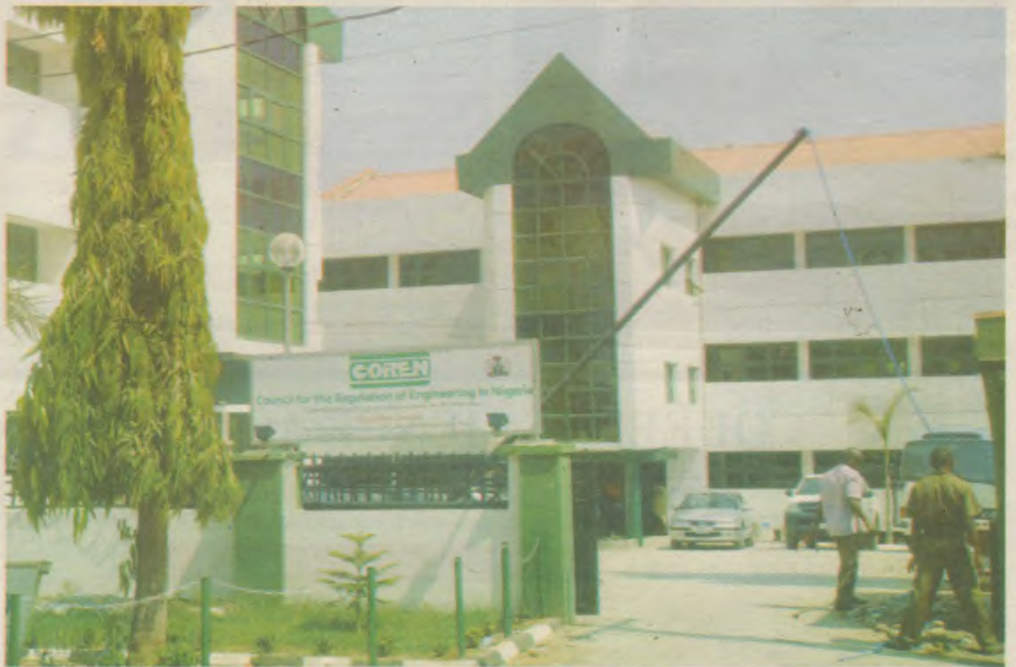
THE new corporate headquarters of the Council for the Regulation of Engineering in Nigeria, located at Addis Ababa Crescent, Zone 4, Abuja