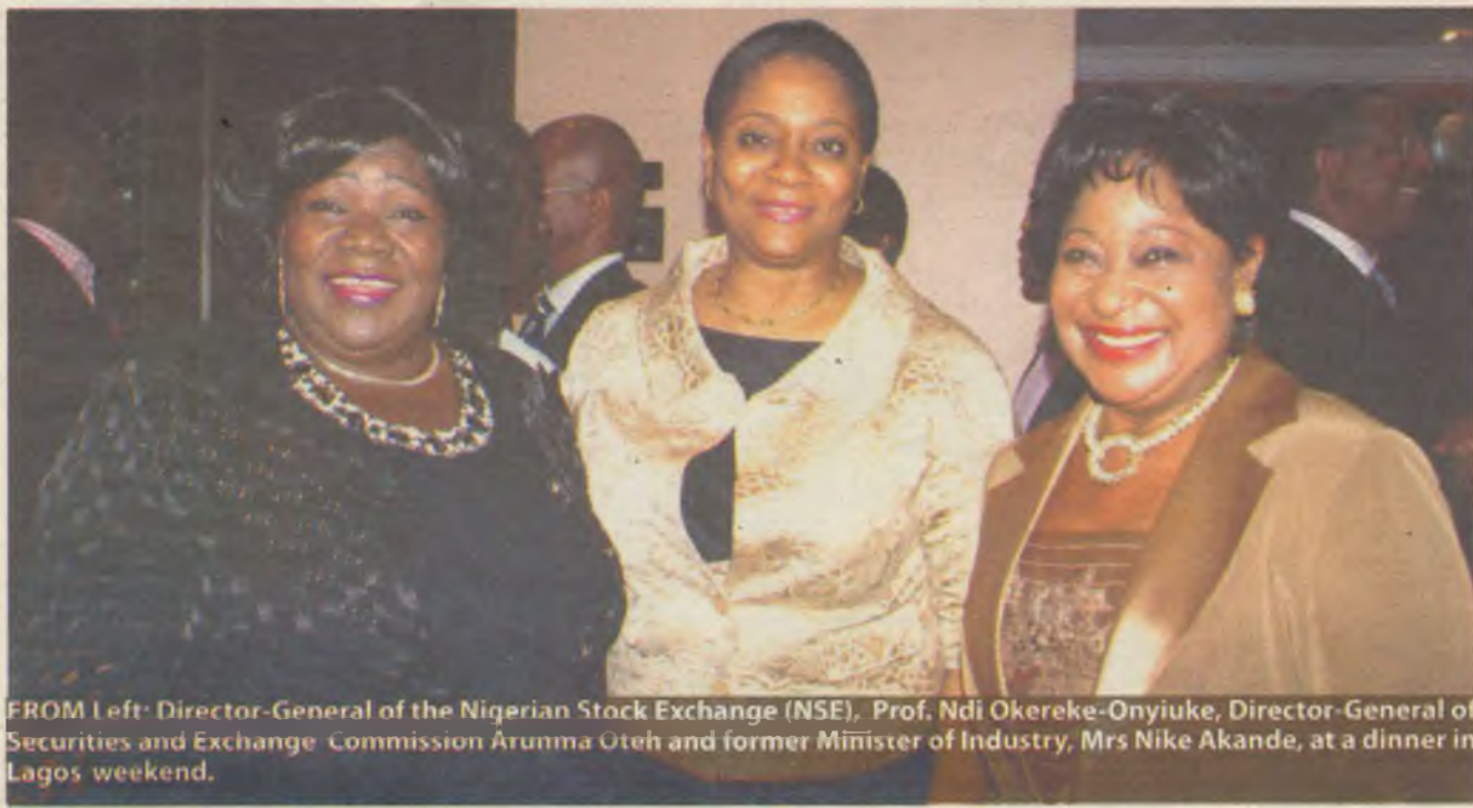
FROM Left: Director-General of the Nigerian Stock Exchange (NSE), Prof. Ndi Okereke-Onyiuke, Director-General of Securities and Exchange Commission Arunma Oteh and former Minister of Industry, Mrs Nike Akande, at a dinner in Lagos weekend.