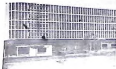
Ibadan University Library

I HAVE noticed for some time now that certain words are being uttered by a number of people, especially the news readers both on the radio and television, in a very confused manner. The particular words are Higher Institution of Learning.