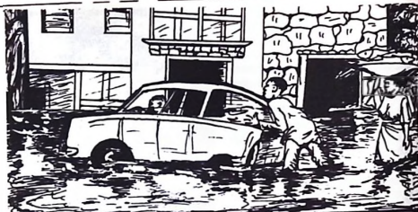
Motorists and pedestrians are all affected.

However, it is a great relief that the authorities are tackling the problem meaningfully. In Sokoto