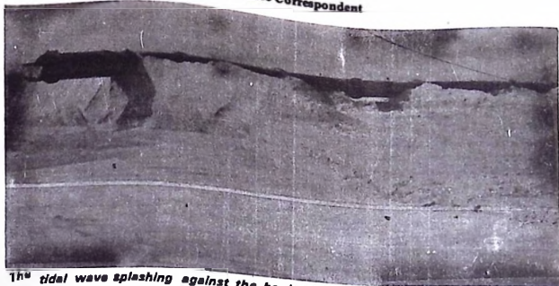
The tidal wave splashing against the bank at the Bar-Beach. A source of energy?

SCIENTISTS have calculated that the energy of tides can be equal to 1,000 to 2,000 million kilowatts, which surpasses the capacity of all power stations now operating in the world. The first designs of tidal power stations appeared in 1930s. However, the rather high cost of generating power by utilizing the tide for a long time hindered the permanent use of this "perpetuum mobile".