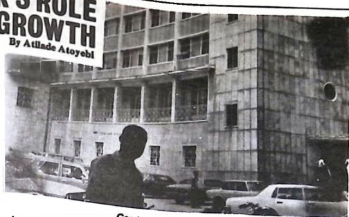
Central Bank building.

However, on the eve of independence, it was obvious that Nigeria had to take over fully the management of her own economy in which monetary measures form an integral part. Consequently, it was decided by an act of parliament that a statutory body be established to take over the responsibilities of the West African Currency Board. That statutory body was the Central Bank of Nigeria which came into being on the first of July, 1959 when it issued the first Nigerian currency notes. It has since had occasions to issue new notes in July 1965 and January 1968, all based on the British system of pounds and shillings.