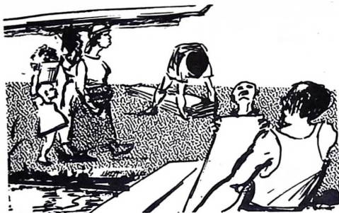
Self-Help project. Trying to build a bridge across a brook.

SELF-HELP is a concept that is deep-rooted in our culture. In the olden days people depended solely on themselves or the assistance of their relations, friends or age-group in building a house or clearing their farms. People did not look up to the king or traditional authority for aid.