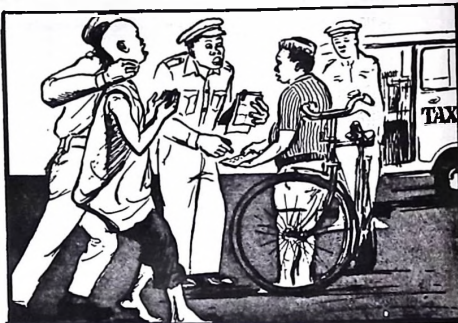
Tax Collector requesting for tax clearance.

However, the men who have to go out to do the assessment must be officers of proven integrity who cannot be influenced to under-assess anyone or go into collusion for any other malpractice. It is therefore, necessary to have an Inspectorate