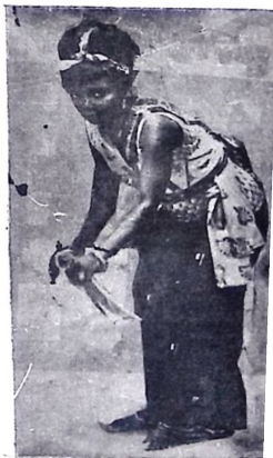
Nigerian Dances — Monday 6.30.