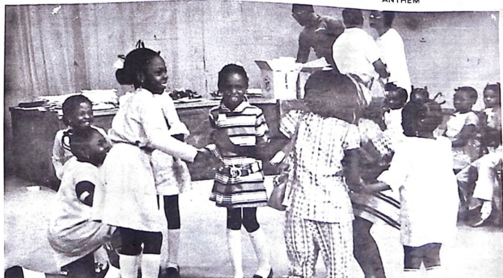
Tune to KIDDIES GET TOGETHER Time 10.45