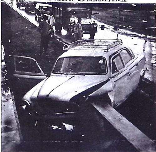
A car accident. Insurance benefits can cover it up.

With these prospects, the people of this country can expect a better future in the insurance industry equipped for public enlightenment and satisfactory service.