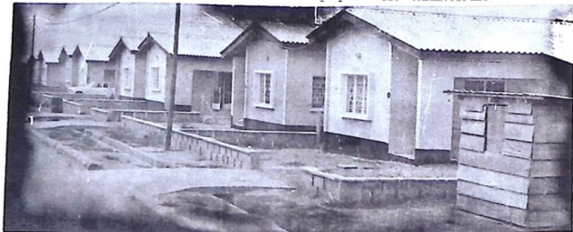
A section of Government's Housing Estate.

In a broad sense, housing should be seen as part of urban and rural development. It should be emphasised that one of the greatest legacies any nation can bequeath to its population is adequate provision of shelter. It is unfortunate that many Nigerians have not lived to see their dreams of owning a house come true. If the Bauchi experiment succeeds, it means that many Nigerians will see the fulfilment of such dreams, thereby bringing to an end the tormenting experience of being a tenant for life.