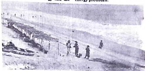
Another view of the beach.

complete harmlessness for the environment make plans for the development of tidal power engineering very alluring. There is another, purely technical feature which is of great interest for power experts: the speed of the rotation of turbine rotors at tidal stations is not more than 200 revolutions per minute, while at nuclear or thermal stations it reaches 3,600 revolutions per minutes. The difference in the rotation speed doubles or triples the units' lifetime, which in the long run considerably reduces the cost of the energy produced.