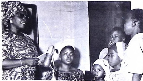
Children with the producer in the studio singing.