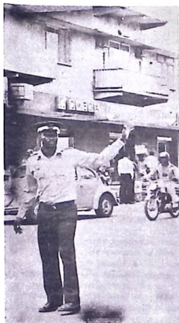
A traffic officer on duty at a road junction.

The setting up of Road Safety Corps of well-trained personnel and dedicated citizens drawn from different walks of life as obtained with the Oyo State Road Safety Corps should therefore recommend itself to all the state governments in the federation.