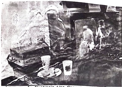
An Electronic Line Corrector at work

A LESS expensive and more compact alternative to a conventional constant-voltage transformer has been developed by a British firm to stabilise single-phase mains supplies powering electrical and electronic equipment.