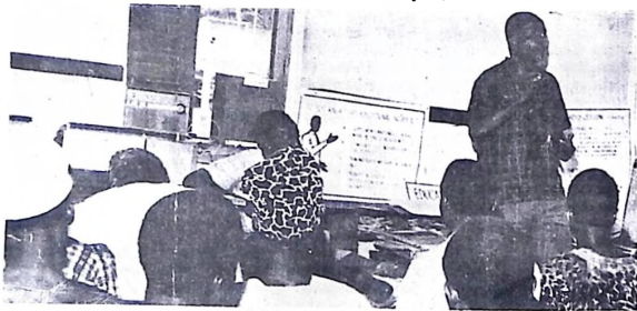
Adult students in a class.

If this is done, it would go a long way in making adult education an instrument of bringing about change favourable to the economic development of Nigeria.