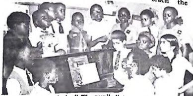
"Musical appreciation" The pupils listen and appreciate the beauty of traditional songs

The neglect of music courses in most of our schools has given rise to our singing programme for schools, particularly for pupils in top primary classes. This series has become quite a favourite over the years. The reason being that it features songs in Edo, Yoruba, Igbo, Hausa, Effik, Itsekiri, to mention a few of the Nigerian languages.