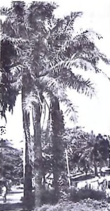
An oil palm farm.

With the attention now being given to the development of oil palm, this country should be able, in the near future, to meet its domestic needs, have surplus for export and eventually regain her position as number one world exporter of palm produce.