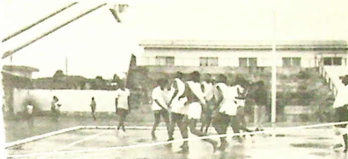
Photo shows action of Pioneers-Buggs match