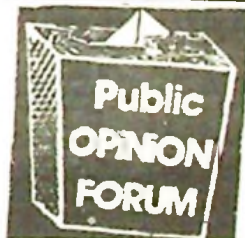
this street be declared a ONE-WAY TRAFFIC.

It could be well be recalled that before the civil war, this street was a ONE-WAY TRAFFIC. In the circumstances, therefore, and following the lead set by the government in consulting to make the Garden City worth its past glory, may I humbly request that the authorities concerned should do everything possible to see that