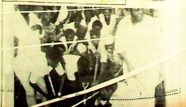
Photo shows the students bailing water along new Lagos Road around Egnosa Grammar school.

A youth body, known as the Bendel Youth Organisation, with a membership of 300 students from various secondary schools in the state, recently commenced work on draining the erosion water at Egnosa Grammar school compound.