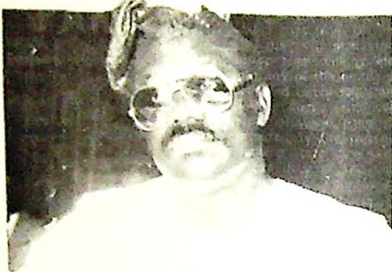
Dr Wahab Dasumu Minister for Housing

Today the monthly rent charged on a room in Lagos with some facilities has gone up to anything between N20 and N25 per