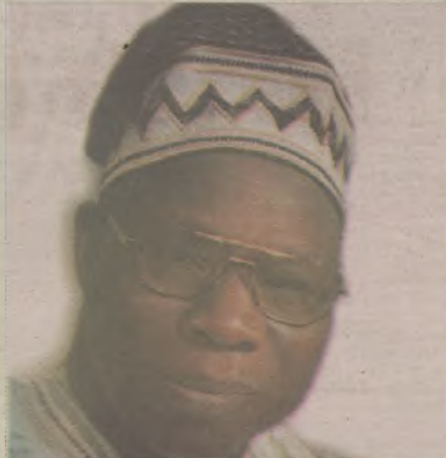
President Olusegun Obasanjo

These complexities and the creative balance that has kept