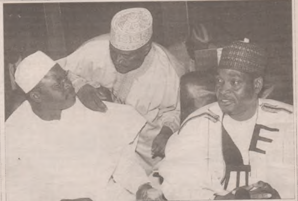
The sports minister, Col. Musa Mohammed conferring with the minister of state works, Alhaji Saleh Shehu and the minister of integration in Africa Alhaji Gana Garba during the presentation ceremony of the African Youth trophy won by Nigerian fly Eagles to President Obasanjo held at the state House Abuja... Wednesday.