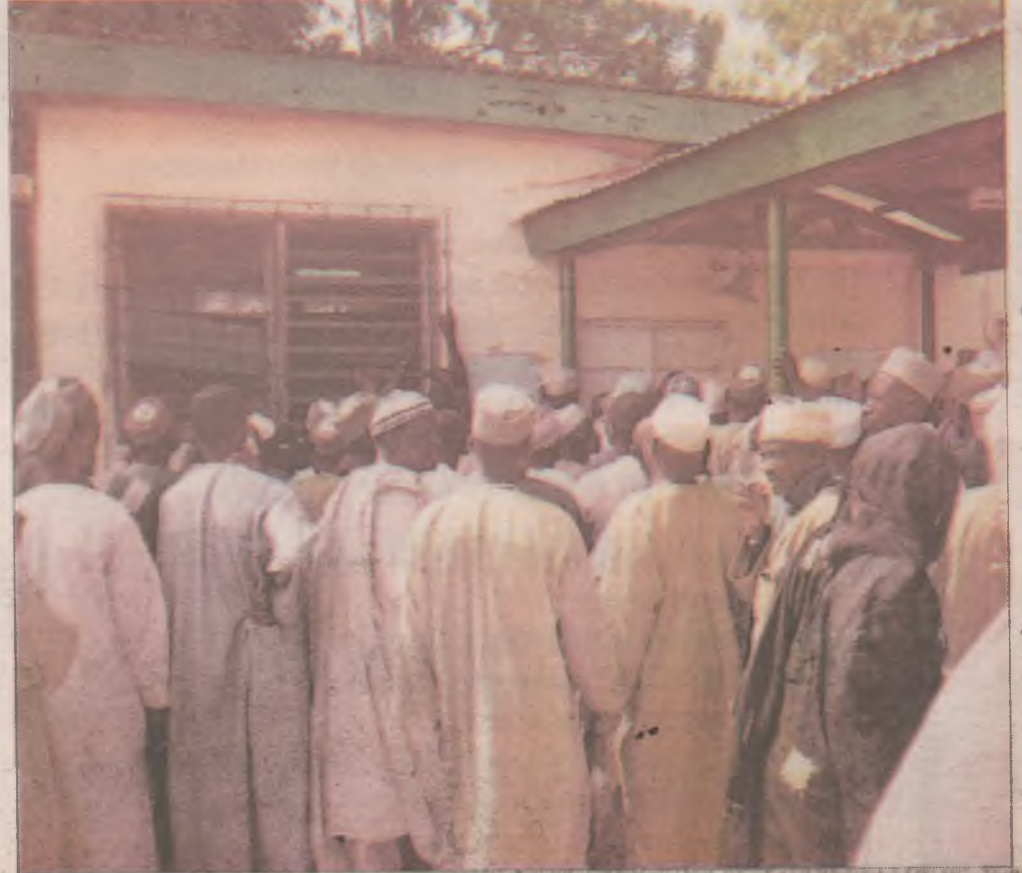
Intending pilgrims struggling to be screened