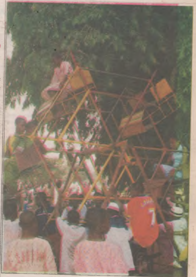
Children having fun at the MKO International School, Ikeja during last Sallah celebration.

According to him, the tutor-general/permanent secretary is the chief executive and accounting officer of each educational district, and will coordinate all activities of secondary and technical schools in the