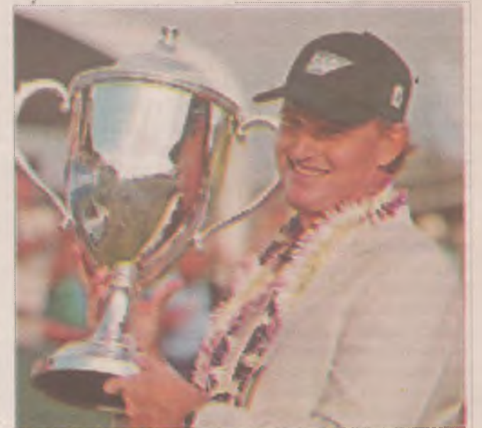
Els looks forward to winning the Heineken Classic