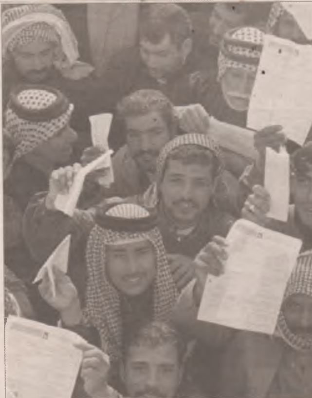
Iraqis hold up copies of their voting registrations as they celebrate their participation in the country's national elections in the holy city of Najaf recently.

The New York Times reported thousands of US troops could be reassigned to training Iraqi soldiers as part of an effort to speed up the strengthening of the local forces.