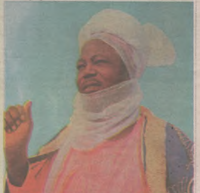
Sir Ahmadu Bello, Sardauna of Sokoto

Our forefathers built states of great complexities in pre-colonial Nigeria, with varying degrees of sophistication, grandeur and power. These states, such as Benin, old Oyo, Kanem Borno and the Sokoto caliphate, represented the ingenuity of the African peoples. Each of these states was built on the basis of