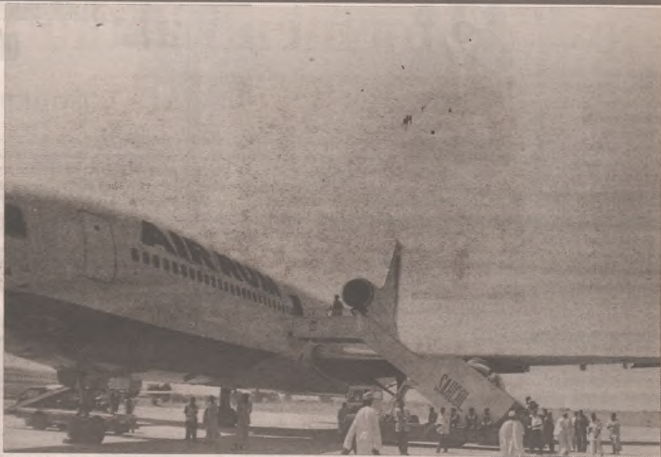
A Trans Air plane contracted for the intending pilgrims airlift

slice of bread cost between N40 to N50, suya sellers sold sticks at N200.00, while other food sellers sold a plate at N150.00 or above.