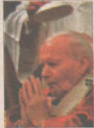
Pope John Paul II

disorder of the central nervous system which can