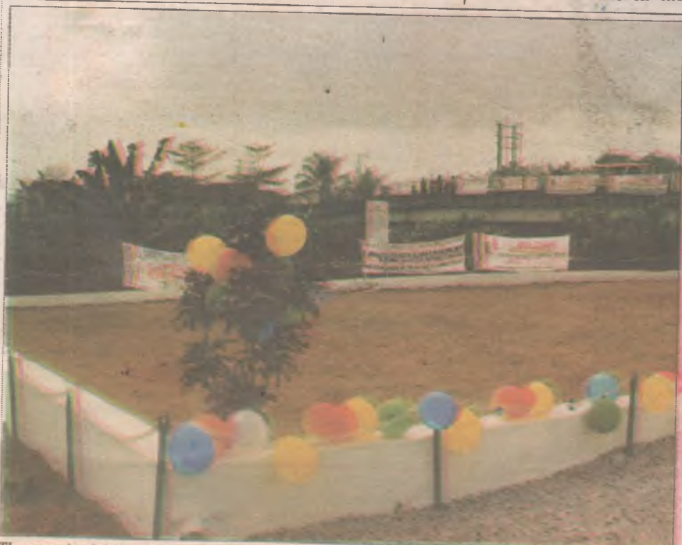
The mass burial site of victims of the Ikeja Military Cantonment bomb blast of January 27, 2001 at Oke-Afa, Isolo, Lagos, during the blast's anniversary...recently.

She however ordered that the accused person be remanded in police custody pending the advice from the state Director of Public Prosecution (DPP).