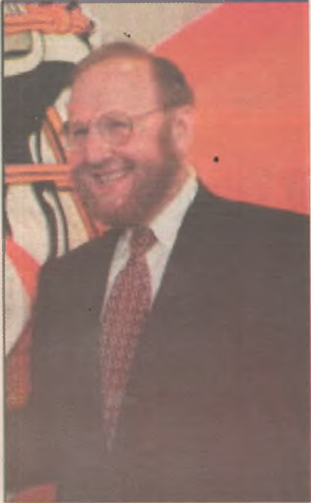
Glazer is still interested in buying Manchester United

Rothschild's office in Manchester has received the expected hostile reaction from some United fans. There have been attempts to jam the office's email and telephone systems and pictures of Rothschild's Manchester directors were posted on several websites.