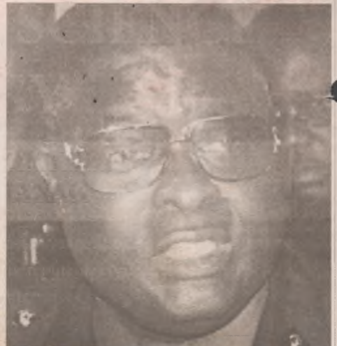
Mr. Tafa Balogun

acting IGP, paid a courtesy call to the Police Affairs Ministry to brainstorm on the expected changes. He also met with mobile police squadron commanders from all over the federation, where he told them to turn a new leaf or be shown the way out.