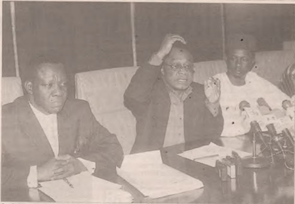
Prof. Odeh Ojowu (m.) briefing the state House journalists on the decision taken during the FEC meeting held at the State House Abuja yesterday. With him are Prof. Fabian Osuji, Education Minister (L) and the Minister of Information, Dr. Chikumeke Chikelu (r.).

Urging the EFCC chairman, Nuhu Ribadu, to peruse the case with all the vigour it deserves, the politician told the EFCC chieftain not to allow himself to be embarrassed but to do everything to find out the truth about the allegations against the former Inspector General of police.