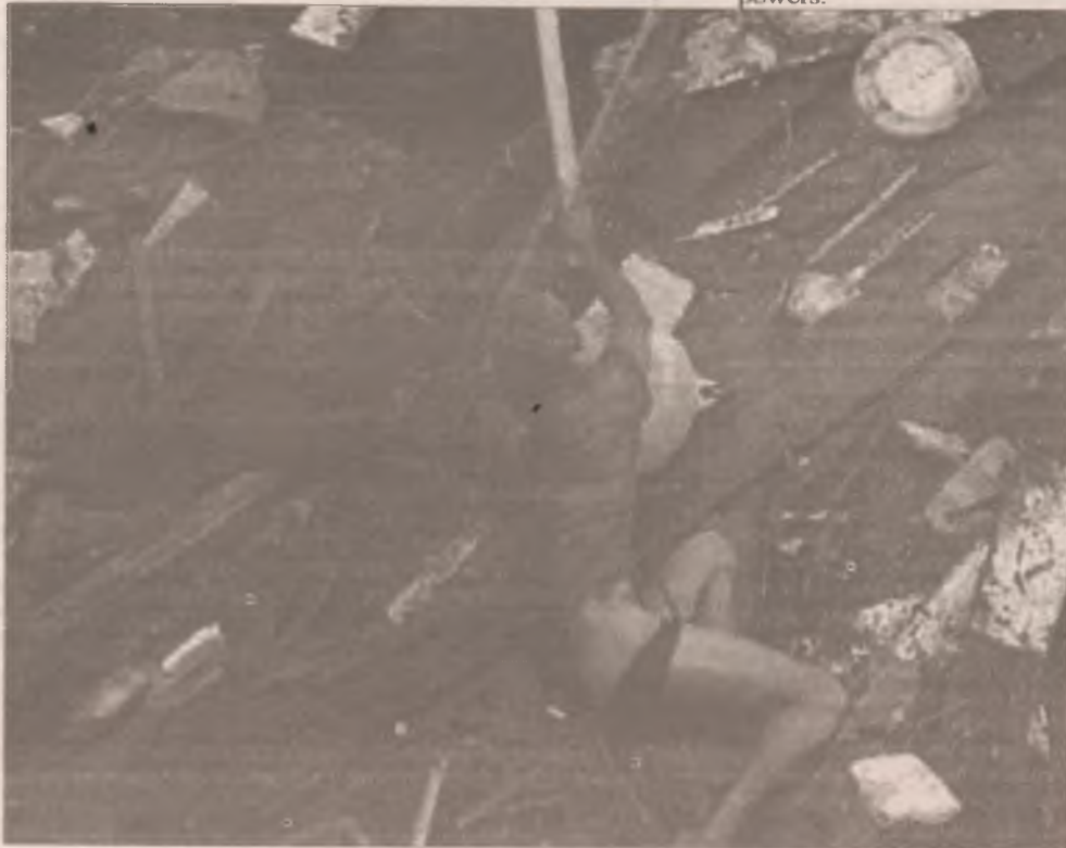
A man struggles to hold on to safety on a pile of debris as it flows down a river in Banda Aceh after a quake-triggered tsunami struck Sumatra, Indonesia ...recently.

Gyanendra, Birendra's brother, was crowned king afterwards, but is frequently accused of overstepping his powers.