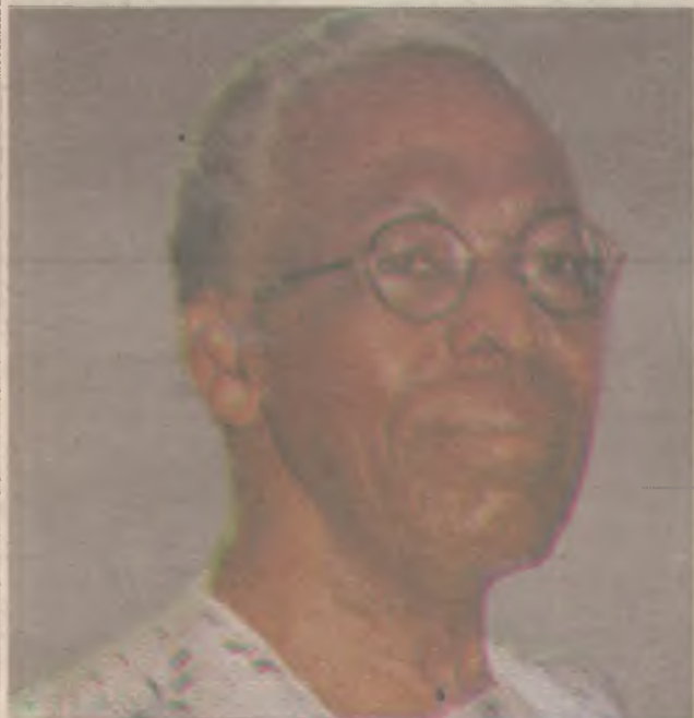
Chief Obafemi Awolowo

It is this racist perception of Africa that has largely dominated