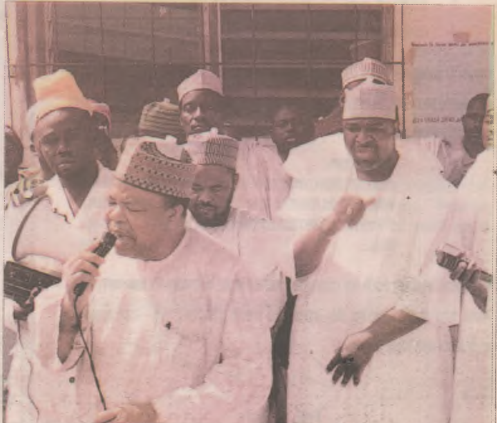
The National Amirul Hajj for the 2005 hajj exercise, Senator Ibrahim Mantu, addressing the intending pilgrims.