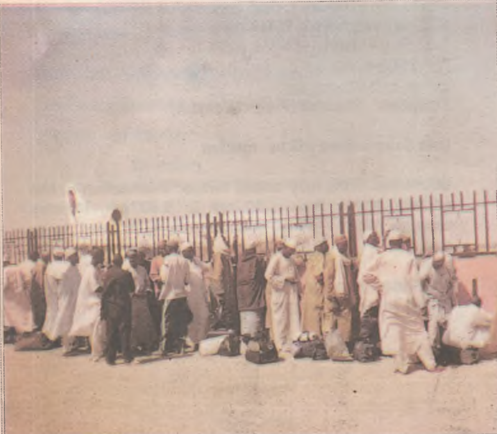
Intending pilgrims in a queue to board the air of the contingency aircraft contracted from Trans Air Ltd.

The situation seemed unbearable for other pilgrims. On Wednesday 12 th of January, the pilgrims went wild at about 5.00pm. They blocked the entrance into the screening hall