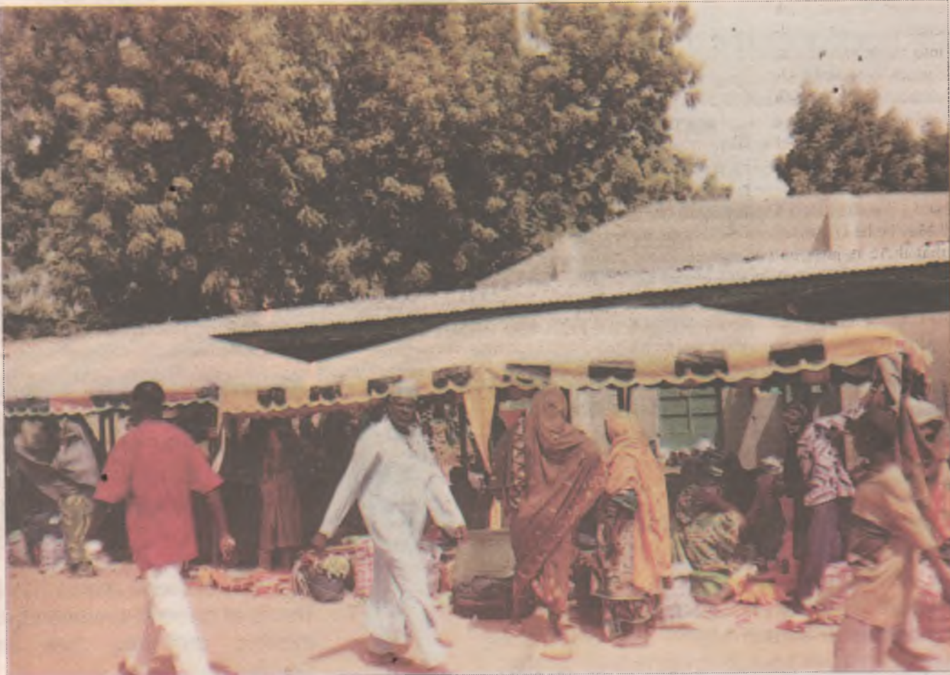
Intending pilgrims going about their business in a normal day at the camp

The moments indeed began with a harsh atmosphere which was, though, avoidable. Rather than gathering them at the already well developed befitting hajj camp with hostel accommodation, water, electricity and hajj lecture opportunities used in the past, the 3119 pilgrims were made to converge at a transit camp situated around the Maiduguri International Airport. "Last year we had cases of illnesses that arose from pilgrims being exposed to cold weather. So this time, we would not expose our pilgrims to this cold weather, but in hostels," the executive