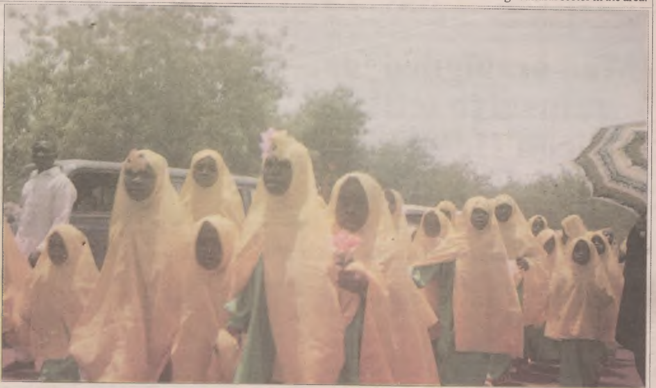
Pupils from various Islamiyya and primary schools in Kano at a colourful parade in a function...recently

ernment council, Alhaji Ahmed Abdullahi Kiyawa, thanked the state government for its efforts and advised farmers in the area to make best use of their privilege to restore the lost glory of the agricultural sector in the area.