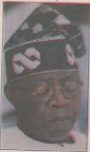
Lagos Gov Bola Tinubu