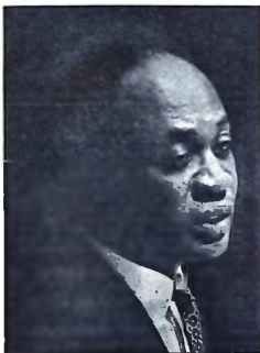
Nkrumah—story of Guinea plots.

● The ban on political parties imposed after the 1966 coup might be lifted in three months' time. Brig. Afrifa, of the NLC, said last week. Speaking at the inauguration of the Mampong (Ashanti) local branch of the Centre for Civic Education, he also urged people to forget the past and accept former CPP members if these came back as "true prodigal sons." Dr. Kofi Busia, head of the CCE, appealed at this meeting for an end to apathy.