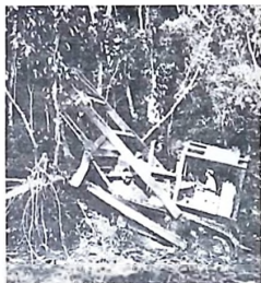
In Ivory Coast the World Bank is supporting the $110m. SODEPALM project, for new palm plantations and attached processing mills. This, the major Ivory Coast agricultural development project, involves clearance of about 70,000 hectares; contract for half of this operation (illustrated here) has gone to JOLKACI, a German contracting firm, which is carrying out the task with about three dozen Allis-Chalmers crawler tractors and a crew of about 250. The European Development Fund of the EEC is the main source of outside finance for this project.

MR ROBERT MACNAMARA , World Bank President, has been on his first tour of Africa south of the Sahara. In Senegal he signed a $9.5m loan agreement with Senegal (see below), for expansion of groundnut production. His tour is reported to have aroused interest because, since he succeeded Mr George Wood, last March, the Bank has expressed increased interest in Africa and in agriculture. In Dakar he said the Bank's loans to Africa would be tripled in the next five years, he was going to study Africa's agricultural problems at first hand, but added that loans would not be for agriculture only. Mr. MacNamara is also to arbitrate between the Congo-Kinshasa Government and the Union Minière on certain outstanding questions during his visit to the Congo after Senegal and Ivory Coast.