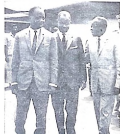
Presidents Zinsou, Ahidjo and Senghor, in Yaoundé.

After the OCAM conference, Dr. Zinsou went with President Senghor to Yaoundé where they briefed President Ahidjo on the