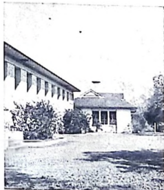
Achimota School, a nursery of Ghana's elite.

Joining the elite has, over the last 20 years, not been particularly difficult because an expanding economy (in spite of Nkrumah) and "Africanisation" have offered jobs to those produced by an enormously expanded educational system. But "urban and especially urban elite background has helped substantially". So children of the elite will for the most part manage to remain within it. Practically all are Christian and a very large majority Protestant.