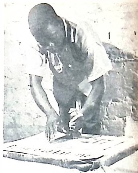
Labelling rubber bales for shipment

The overall effect of the scheme has "dramatically improved the standard of