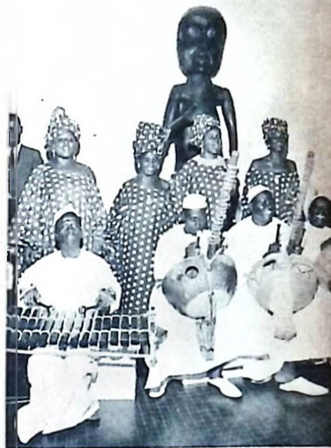
Musicians and singers from Mali play at the British Museum Ethnography Section, Burlington Gardens, where the exhibition "Manding Focus on a Civilisation" is being held

One important aspect was that it brought together not only academics from Britain and France (a potent enough confrontation, in all conscience) but English-speaking and French-speaking Africans from the countries under the Manding umbrella (Mali, Senegal, The Gambia, Liberia, Sierra Leone, Guinea, Ivory Coast). This made it very definitely