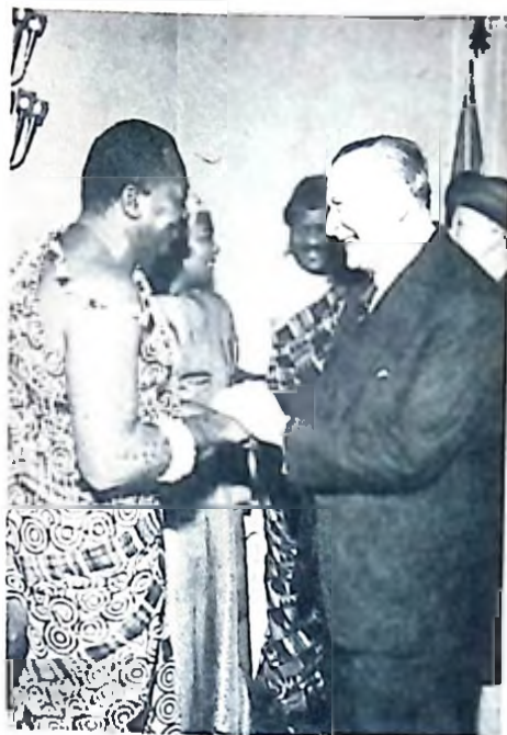
The Asantahene, Otumfuo Opoku Ware II, chats with Sir Edward Spears, Life President of Ashanti Goldfields, at a party given by the Ghana High Commissioner during the Asantahene's visit to Britain

• The Leventis group in Nigeria is to offer 40 per cent of the company's share capital to Nigerians.