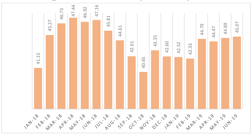
Fig 3: External Reserves (USD' Billion)

External reserves was on the rise in H1, 2019, compared to its declining trend in H2, 2018. The rise in the external reserves in H1 2019 was however not smooth as it slightly fell from $42.54 billion in January to $42.33 billion in February, only to rise to $44.49 billion in March. There was a slight decline to $44.47 billion in April before upticks to $44.89 billion and $45.07 billion in May and June, 2019 respectively.