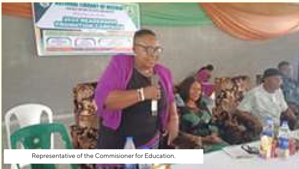
Representative of the Commissioner for Education.