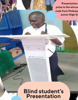
Blind student's Presentation