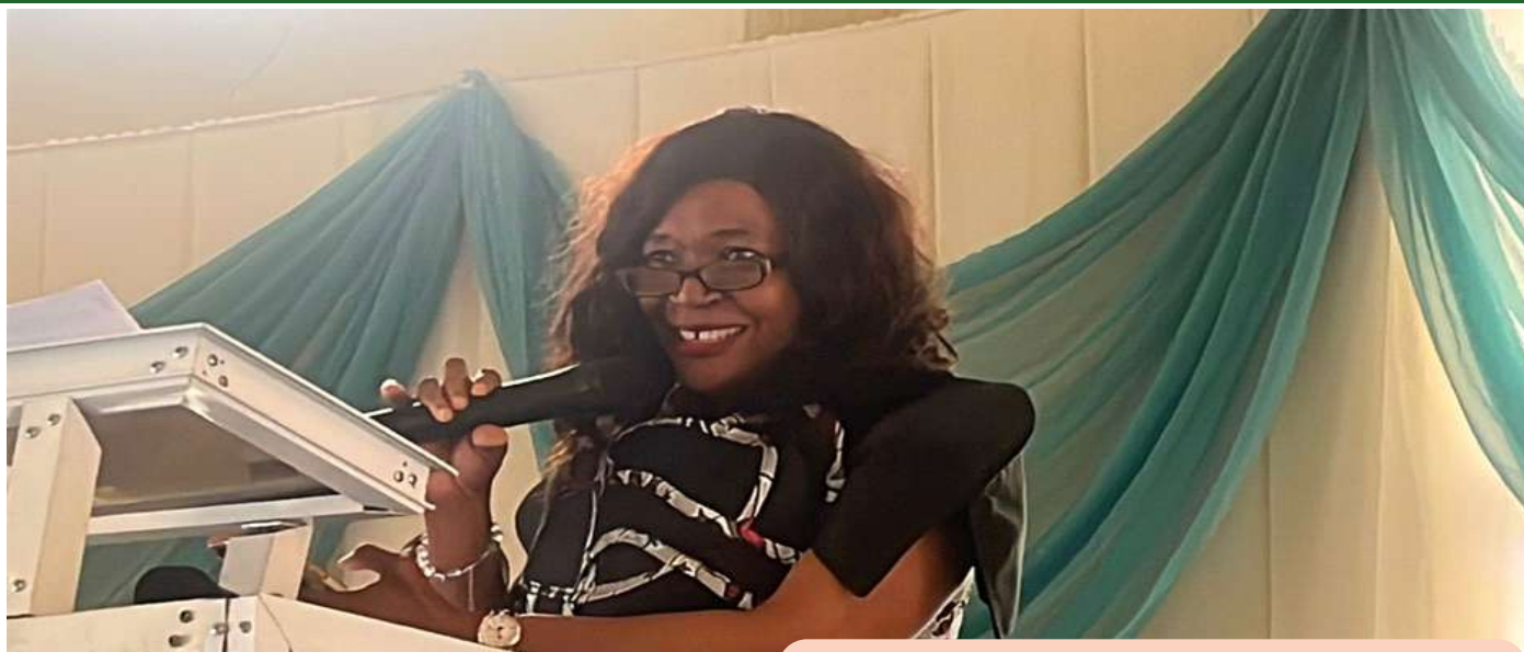
National Librarian/CEO delivering the welcome address