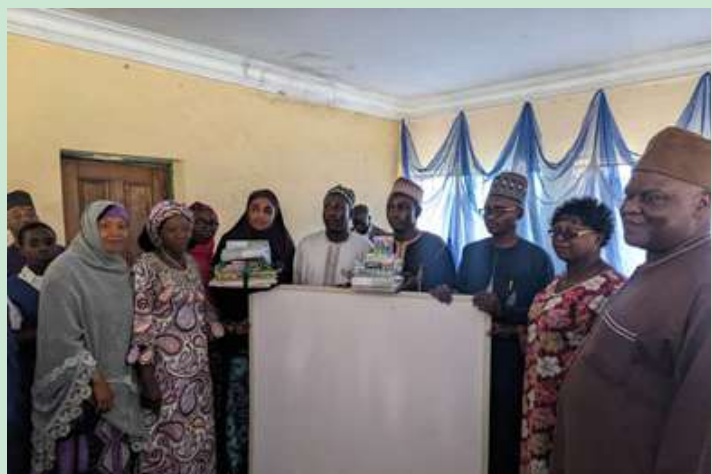
Presentation of Literacy centre materials to the Naraguta Community in Jos North