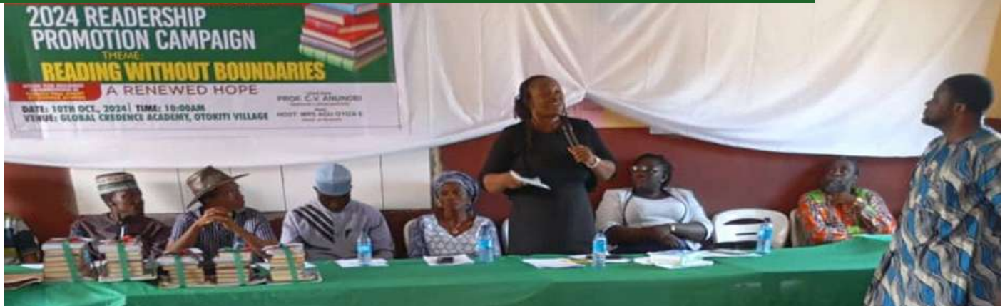
The panel of judges announcing the result of the reading competition and impromptu speech