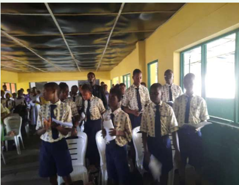
OGUN RPC 2024. Representative of Special Need School (St Peter School, Olomooere Abeokuta)

The Researchers Group of Primary School presented a Cultural Play and a playlet which everyone was engrossed in. primary school ONLY presented the cultural and playlet