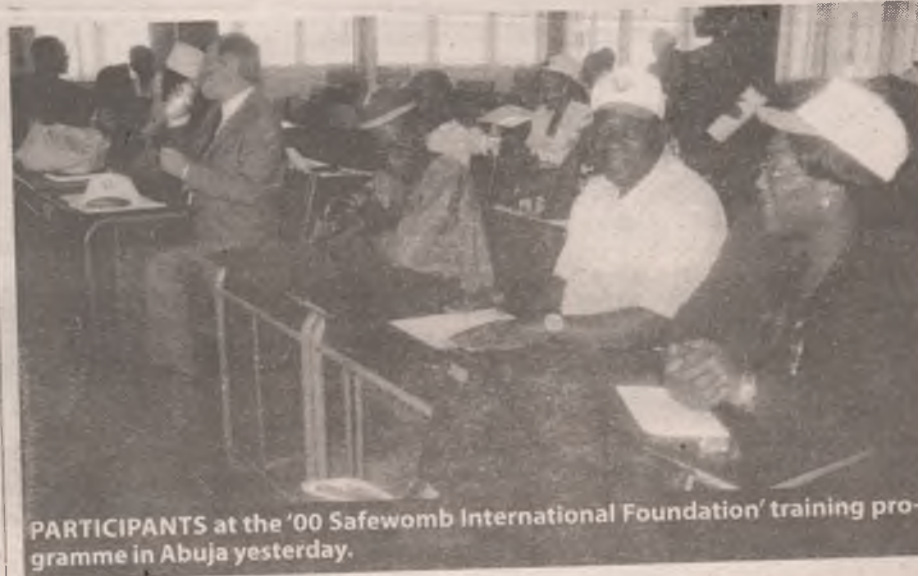
PARTICIPANTS at the 'OO Safewomb International Foundation' training programme in Abuja yesterday.