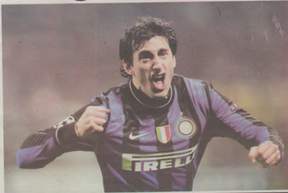
INTER Milan's Argentinian forward Alberto Milito celebrates after scoring the first goal against Chelsea during their UEFA Champions League second round, first leg match yesterday.

Chelsea started to threaten more and more.