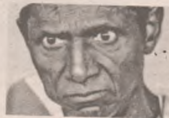
PRESIDENT Umaru Yar'adua

We thank God for bringing you back home safely and we pray for your total recovery. Meanwhile, kindly accept my humble advice, make sure you turn deaf ears to all sorts of tales. Nigerians were genuinely concerned about your health condition while you were away for treatment and prayed for you. May God preserve and protect Nigeria.