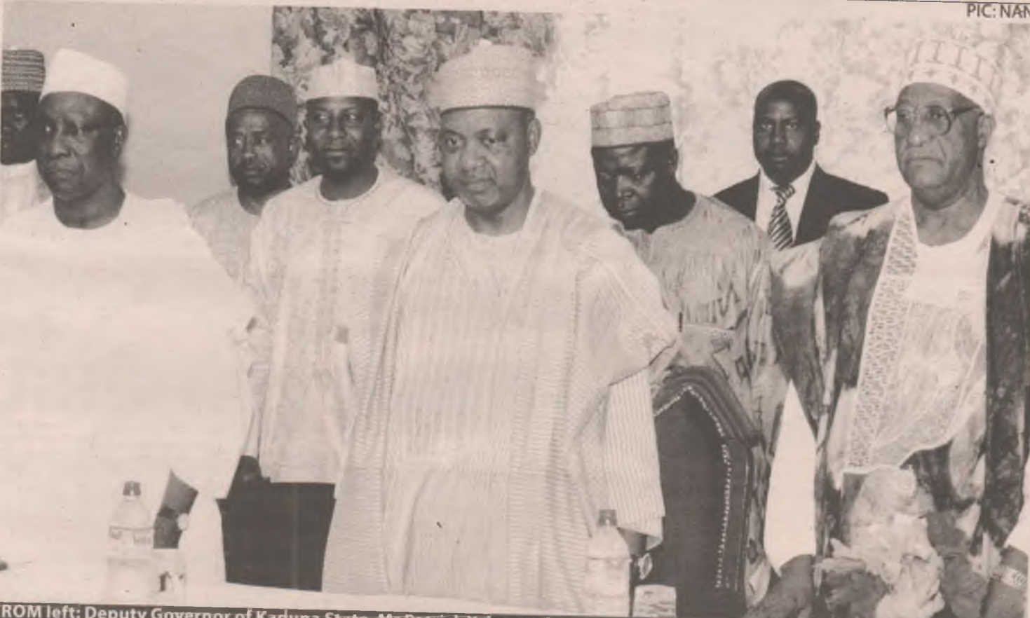
FROM left: Deputy Governor of Kaduna State, Mr Patrick Yakowa; Governor Namadi Sambo of Kaduna State and chairman, Nigerian Textile Manufacturers Association, Senator Walid Jibrin, at the opening of Nigerian Stakeholders in Cotton/Textile Garment Industry round table meeting in Kaduna yesterday.

The presiding judge said though they were expected to give judgment yesterday, they would put on hold further action on the case until the petition was determined to protect their integrity.