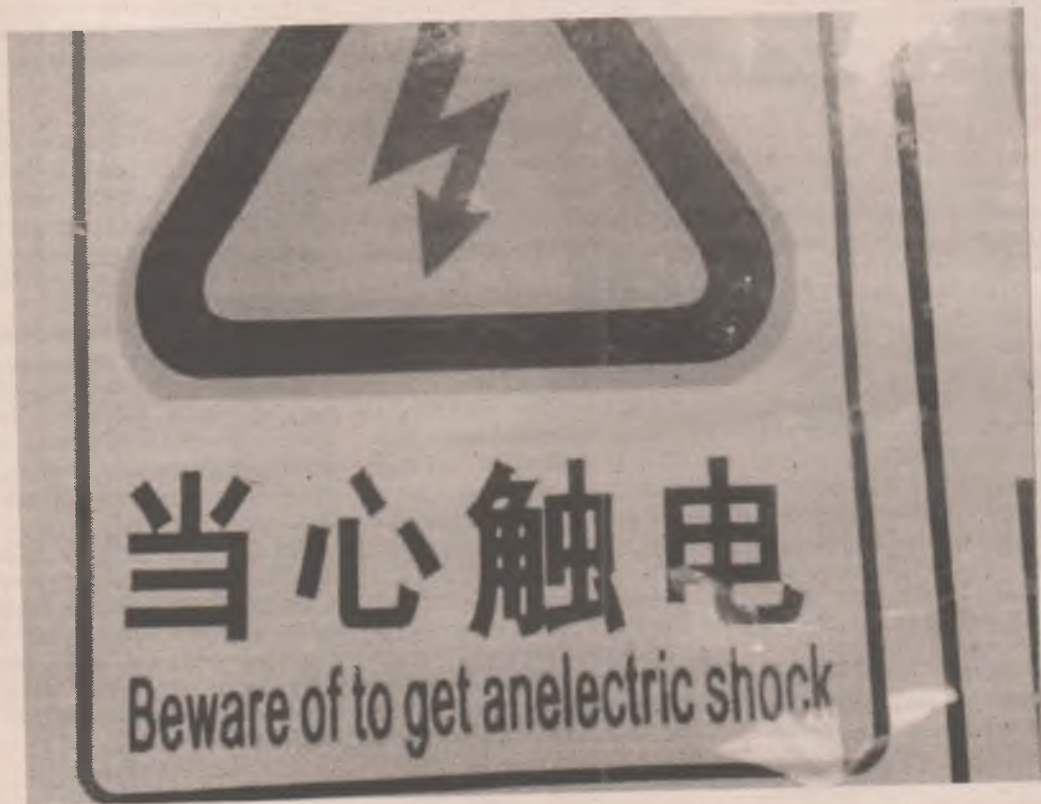
Shocking English Photo location: Nanning, China