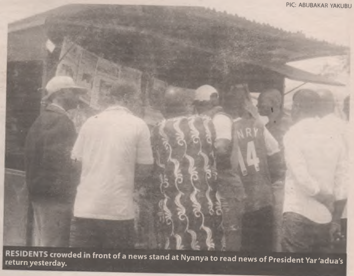
RESIDENTS crowded in front of a news stand at Nyanya to read news of President Yar'adua's return yesterday.

"The National Assembly should follow the constitution and do the right thing for the country in allowing him to continue if he is well enough but if