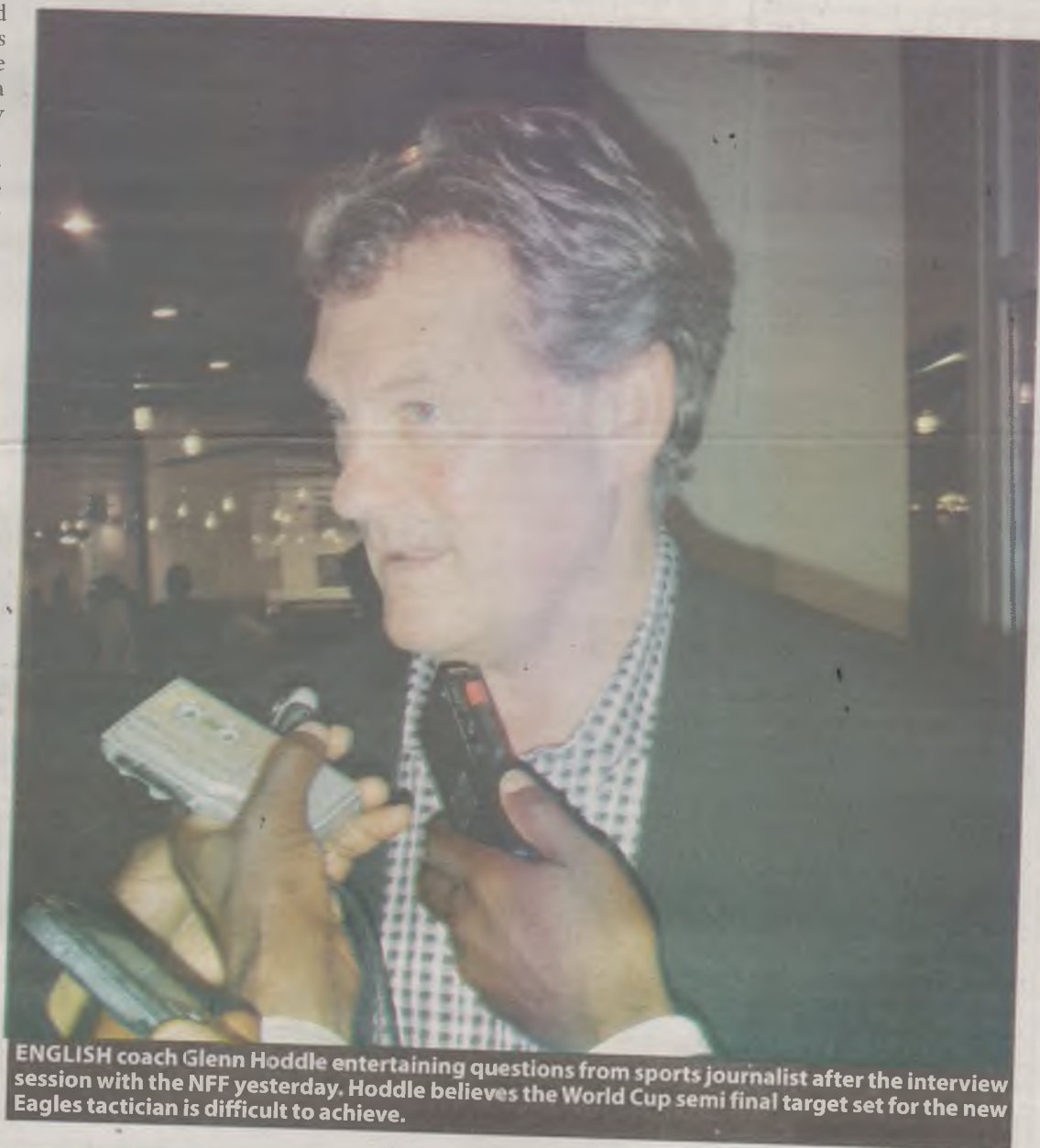
ENGLISH coach Glenn Hoddle entertaining questions from sports journalist after the interview session with the NFF yesterday. Hoddle believes the World Cup semi final target set for the new Eagles tactician is difficult to achieve.

Hoddle took England to the second round of the 1998 World Cup before losing to Argentina. He was sacked by the FA in February 1999 for his controversial spiritual views.