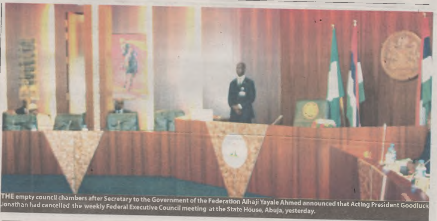
THE empty council chambers after Secretary to the Government of the Federation Alhaji Yayale Ahmed announced that Acting President Goodluck Jonathan had cancelled the weekly Federal Executive Council meeting at the State House, Abuja, yesterday.