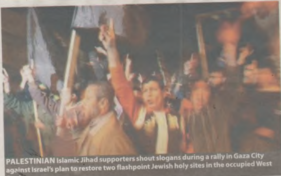
PALESTINIAN Islamic Jihad supporters shout slogans during a rally in Gaza City against Israel's plan to restore two flashpoint Jewish holy sites in the occupied West Bank.