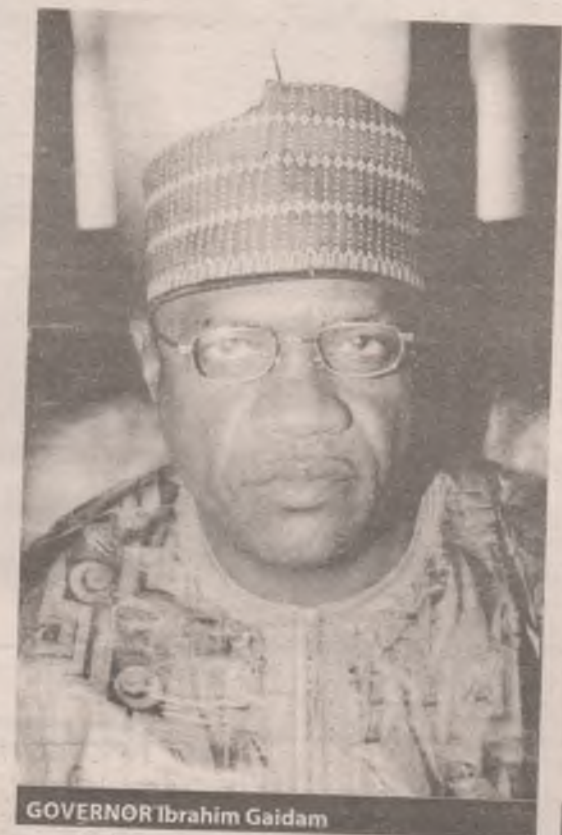
GOVERNOR Ibrahim Gaidam

Apart from this, suggestions that Gaidam along with the chair-