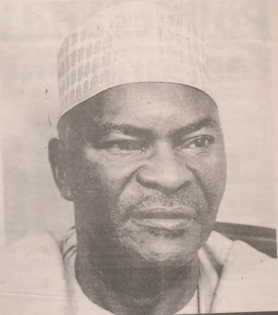
GOVERNOR Ibrahim Idris

The governor's aide further noted that all the prominent members in Audu's government, including his first and second deputies as well as his running mate in the last gubernatorial re-run election, did not only joined the Peoples Democratic Party (PDP), but are also identified with Governor Idris' government.