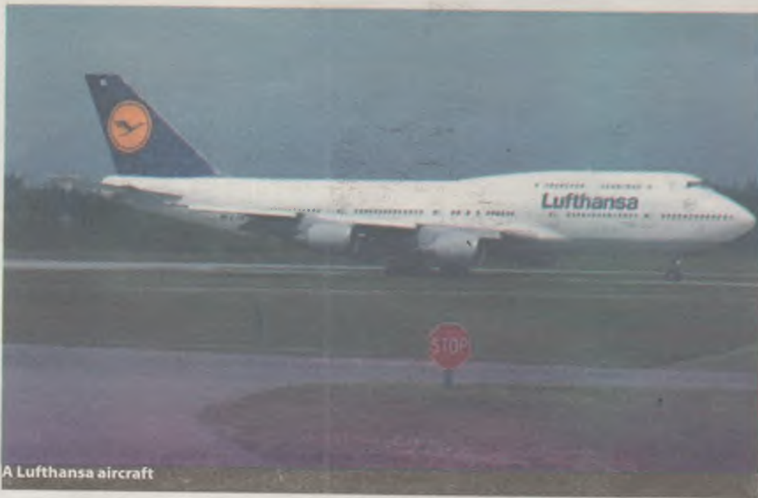
A Lufthansa aircraft

It could be recalled that NAMA was established in January 2000 by the Olusegun Obasanjo administration in compliance with ICAO's principle of separating aviation service providers from the regulators.