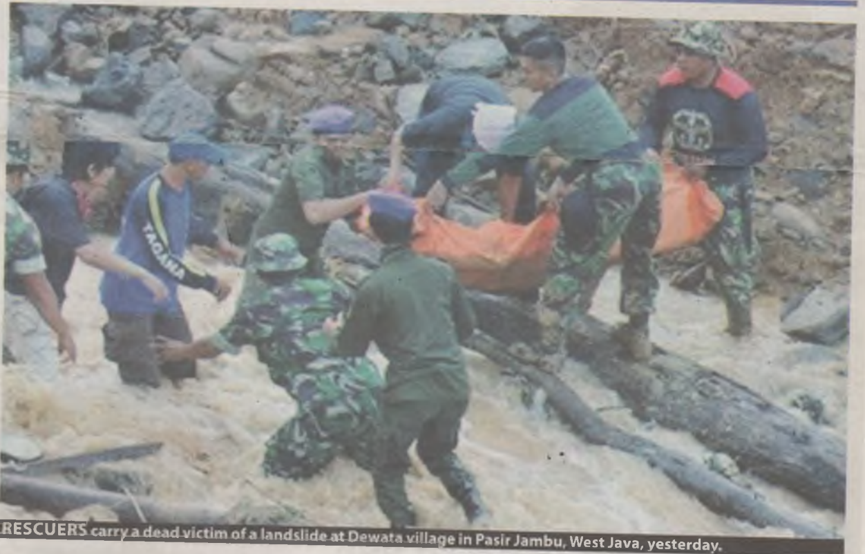
RESCUERS carry a dead victim of a landslide at Dewata village in Pasir Jambu, West Java, yesterday.

Scores of houses as well as the plantation office and warehouse were rolled and crushed as they slid down the hillside with a swath of top soil and mud hundreds of yards (meters) wide.