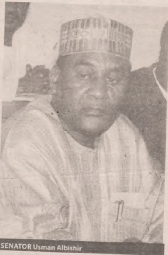
SENATOR Usman Albishir

man of the ANPP and other stakeholders have promised to support most of the present elected politicians in the state and National Assembly to return to their positions unopposed.