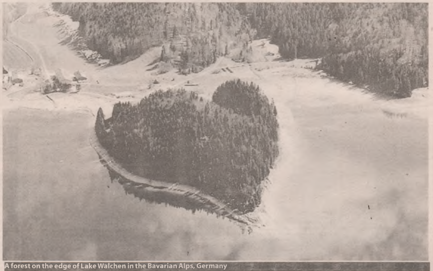
A forest on the edge of Lake Walchen in the Bavarian Alps, Germany