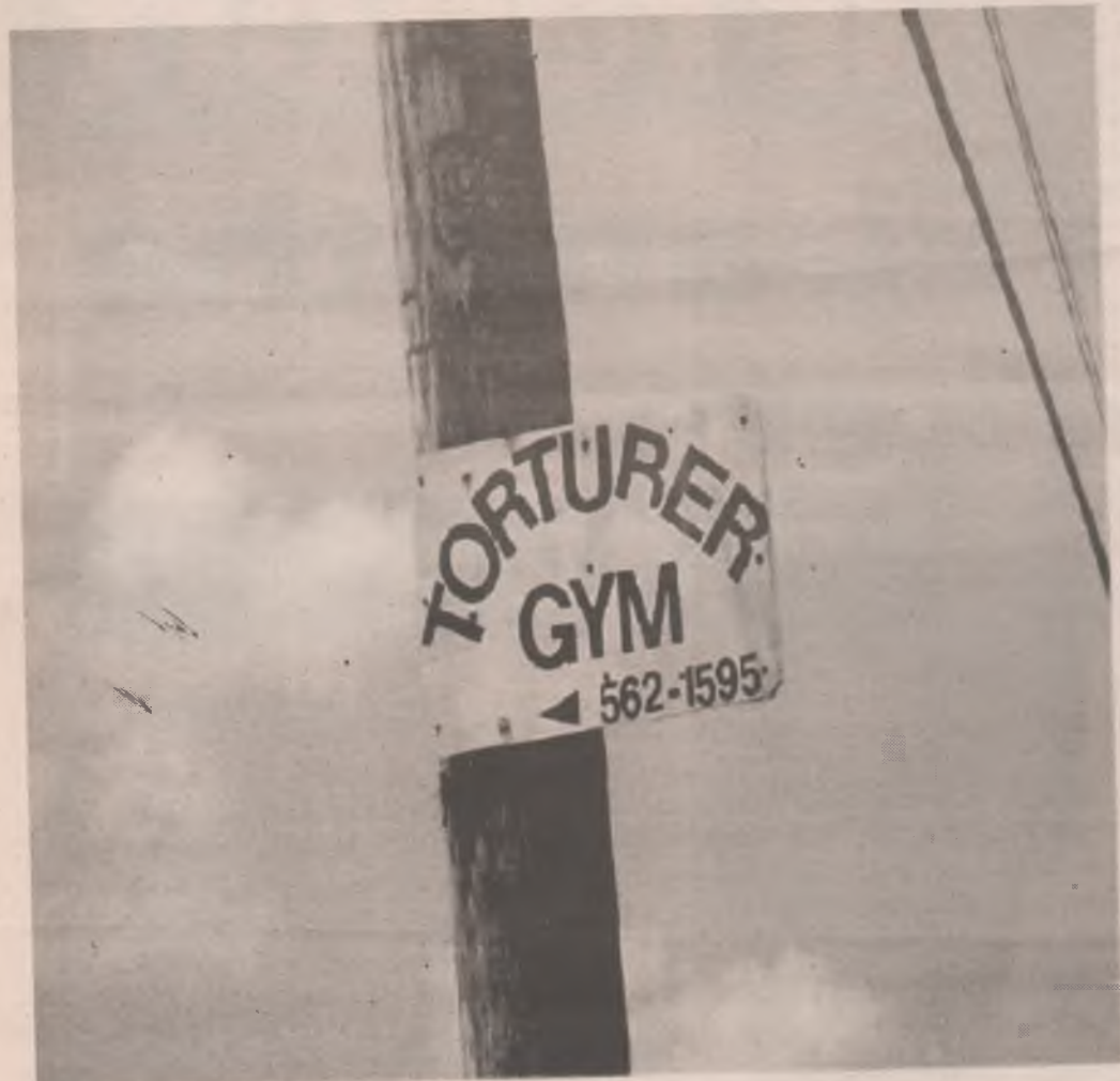
No pain, no gain Photo location: Antigua