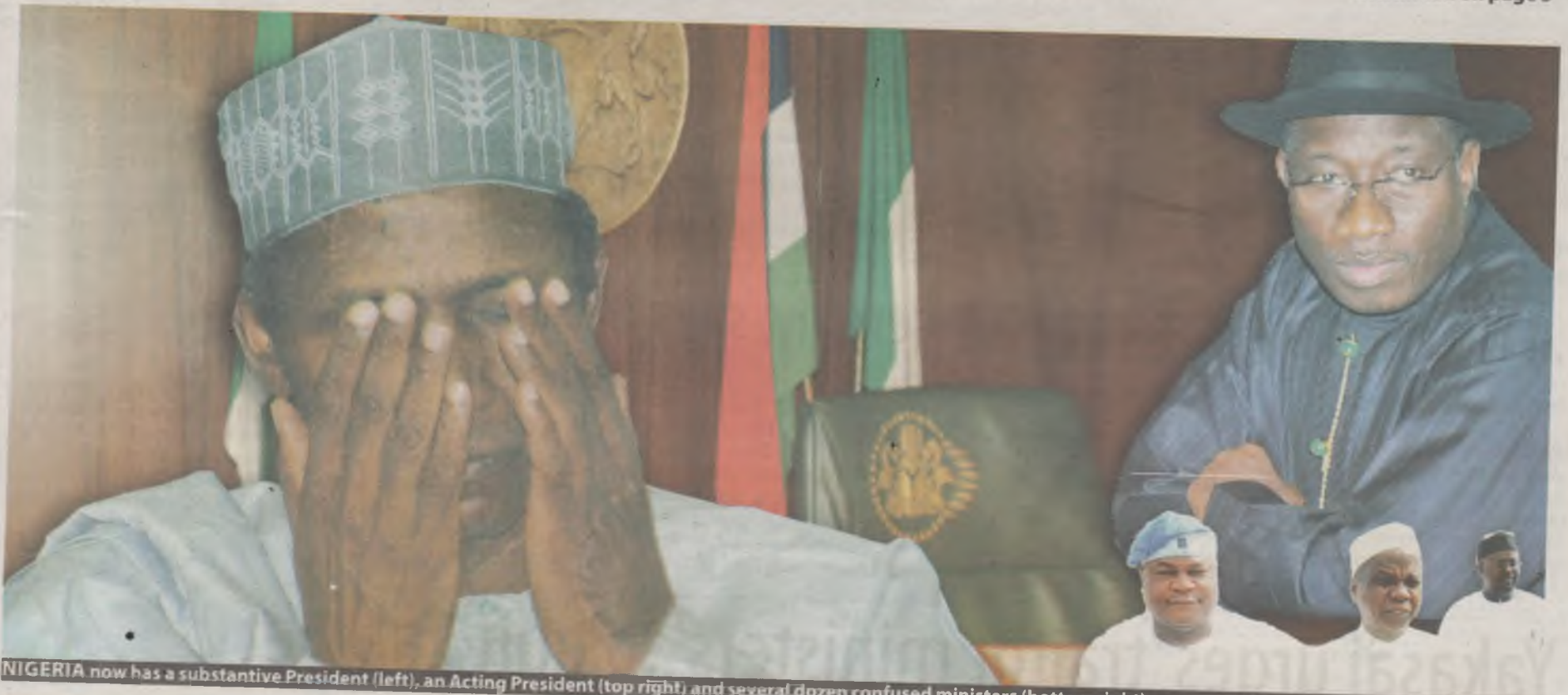
NIGERIA now has a substantive President (left), an Acting President (top right) and several dozen confused ministers (bottom right).