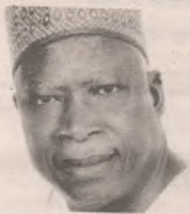
EX-NASARAWA Governor Abdullahi Adamu