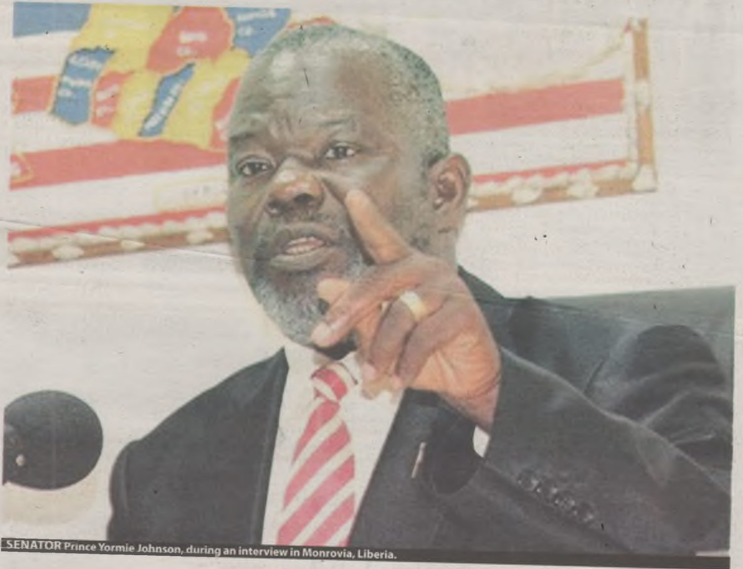
SENATOR Prince Yormie Johnson, during an interview in Monrovia, Liberia.