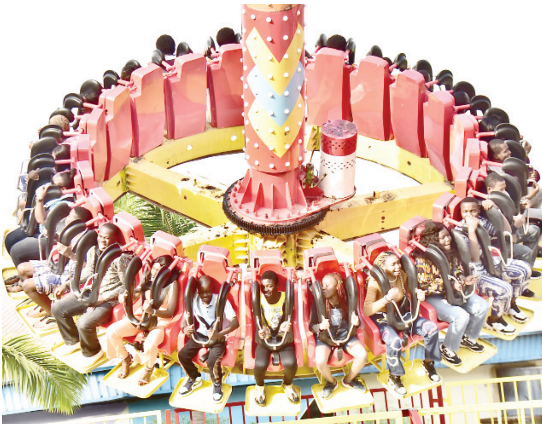
Children and other residents celebrating New Year day in the Federal Capital Territory (FCT) Abuja, yesterday