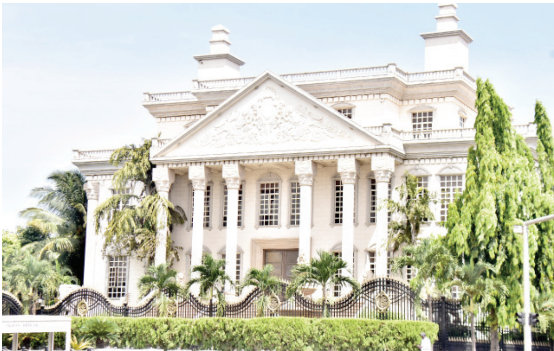
■ A residential building in Gana Street, Maitama Abuja

He said to survive the 2023 storm, investors need to take calculated risks and be able to hedge those things they can as early as possible.