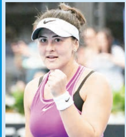
■ Bianca Andreescu

Bianca Andreescu staged a dramatic comeback on Sunday to topple Garbine Muguruza in a battle of former Grand Slam champions on day one of the Adelaide International.