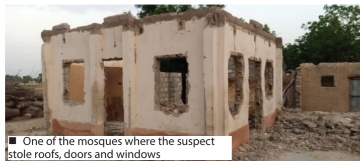
One of the mosques where the suspect stole roofs, doors and windows