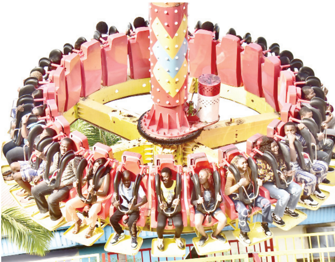
Children and other residents celebrating New Year day in the Federal Capital Territory (FCT) Abuja, yesterday