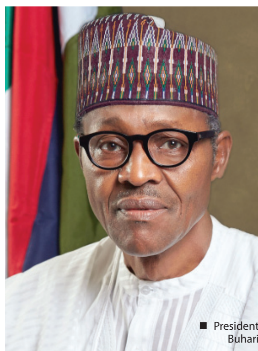
■ President Buhari

"For this reason, we specially charge the Economic and Financial Crimes Commission (EFCC) and the Independent Corrupt Practices and Related Offences Commission (ICPC) to ensure that all efforts by politicians to buy votes during the scheduled general elections, beginning from February, were unsuccessful in line with the presidential directive to all security agencies to ensure free, fair and credible elections this year," he said.