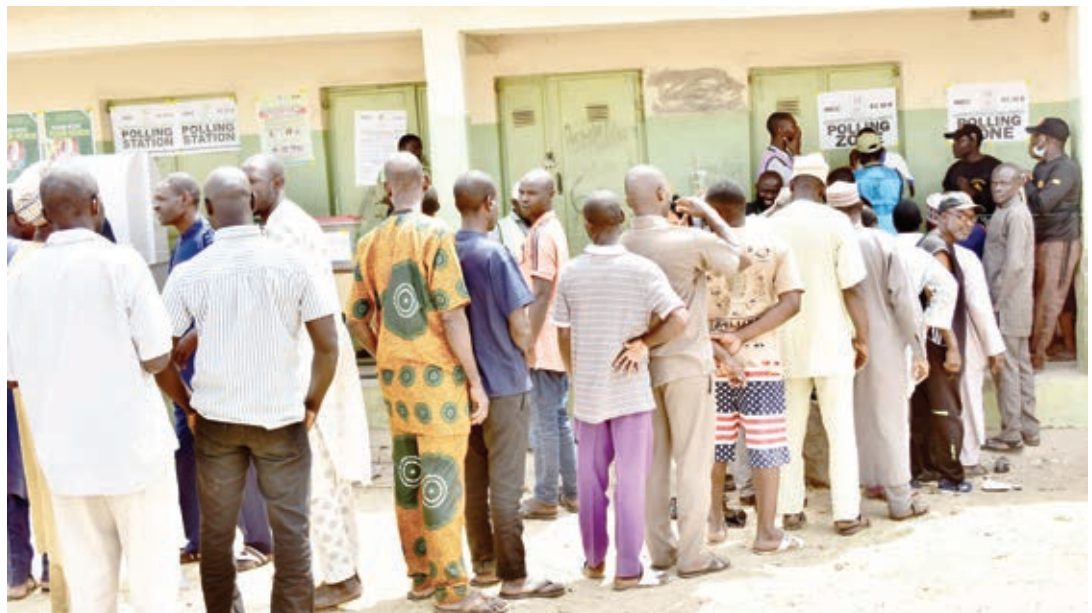
■ Voters waiting to cast their votes in Abuja

"Even without the CBN's policy on the limit of cash withdrawal, these people would have been looking for a way to do the same thing in different ways. If you look at the Osun election, we discovered that there was a way they know that this person has voted for their person before the payment is made. So, since the money is not paid before the election, they can devise another