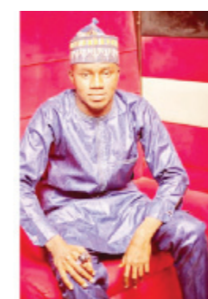
The victim before the incident