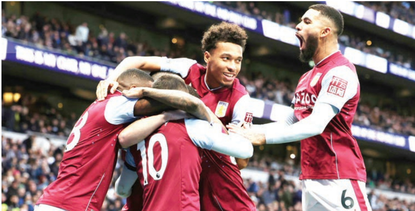
■ Aston Villa players celebrate Emiliano Buendia's opening goal against Tottenham in yesterday's match