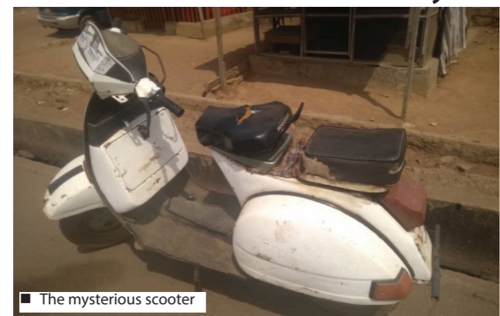
The mysterious scooter

Saturday only to wake up to discover it on Sunday morning. Our environment security wise is too fragile not to be concerned with such development now.