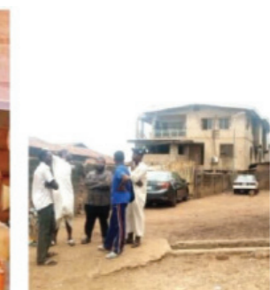
Sympathiser at the bereaved family's house