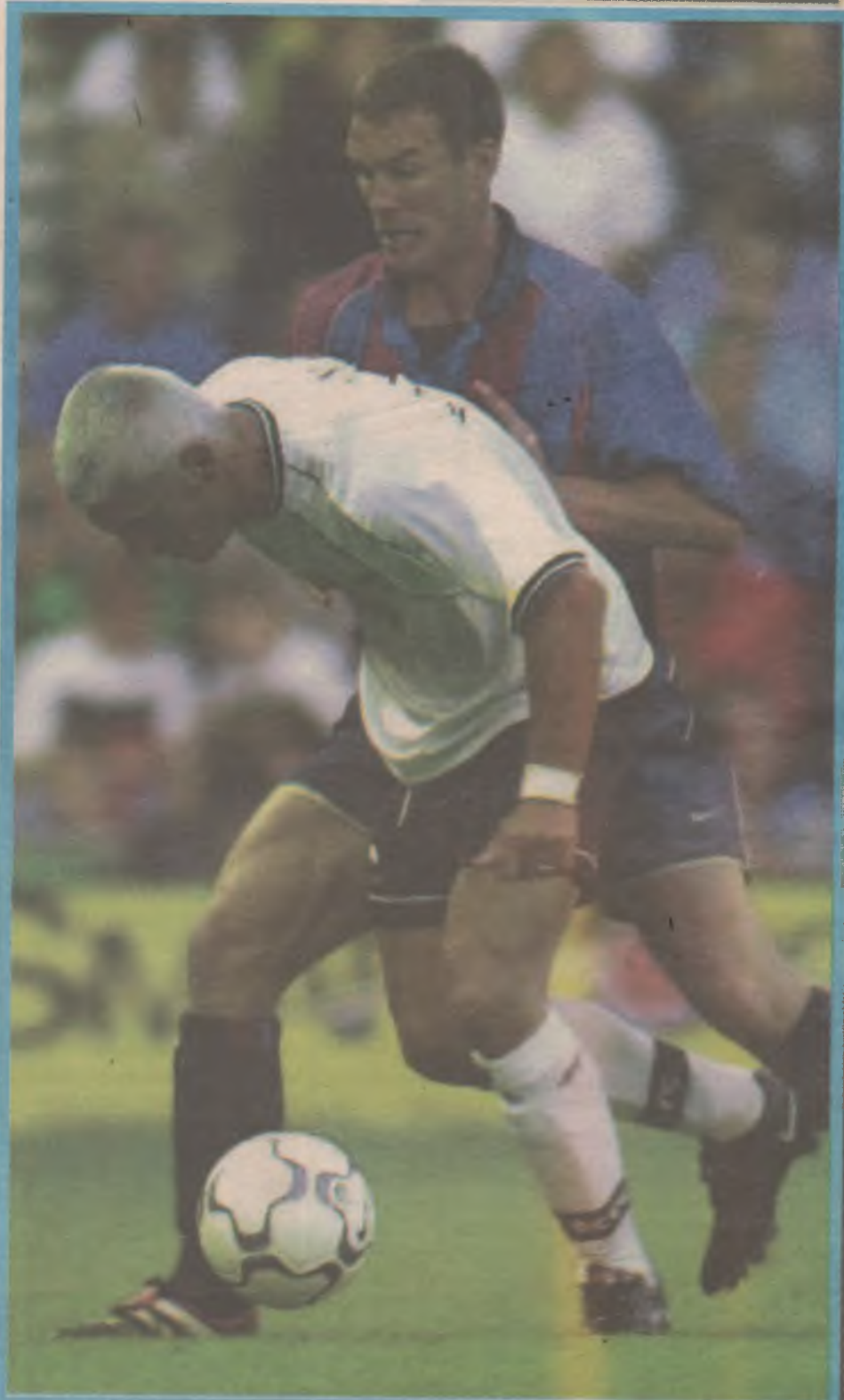
Derby's Fabrizio Ravanelli, left, controls the ball against Barcelona's Patrik Andersson during their friendly game at Pride Park, Derby...recently.