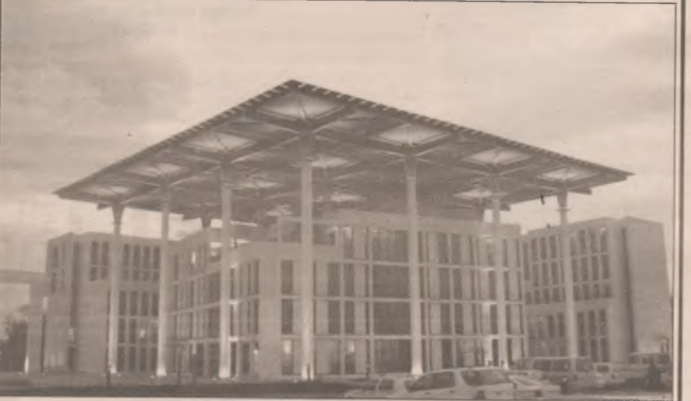
An elegant edifice office, of the Julius Berger (Nigeria) Plc., commissioned by the Senate President, Anyim Pius Anyim in Abuja ... recently.

Chief Anyim also stated that at the inception of the Obasanjo Administration, the Federal Government paid the debt owed the company by past military leaders, thereby saving the jobs of about 4,000 Nigerians workers, who were to be sacked.