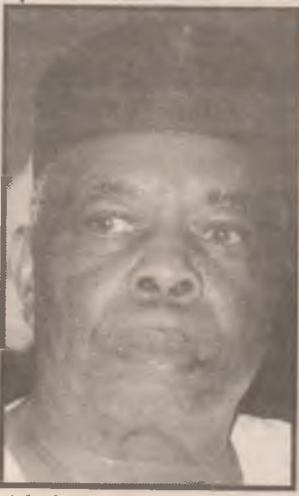
Admiral Aikhomu (rtd)