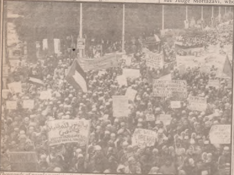
Thousands of people participating in an anti-Israel march in Cape Town, South Africa, on Tuesday.

The fact that King Mohammed has personally highlighted this issue indicates the seriousness with which it is being taken.