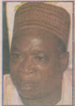
Gov Abdullahi Adamu of Nasarawa