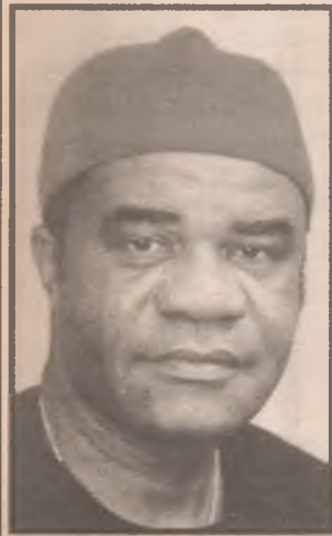
Vincent Ogbulafor, Minister of Economic Matters