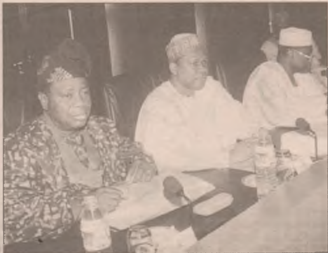
L-R: The Minister of Internal Affairs, Chief Sunday Afolabi, the Minister of State for Internal Affairs, Alhaji Mohammed Shatta and the Minister of Labour and Productivity, Alhaji Musa Gwadabe at the FEC meeting, in Abuja ... yesterday.