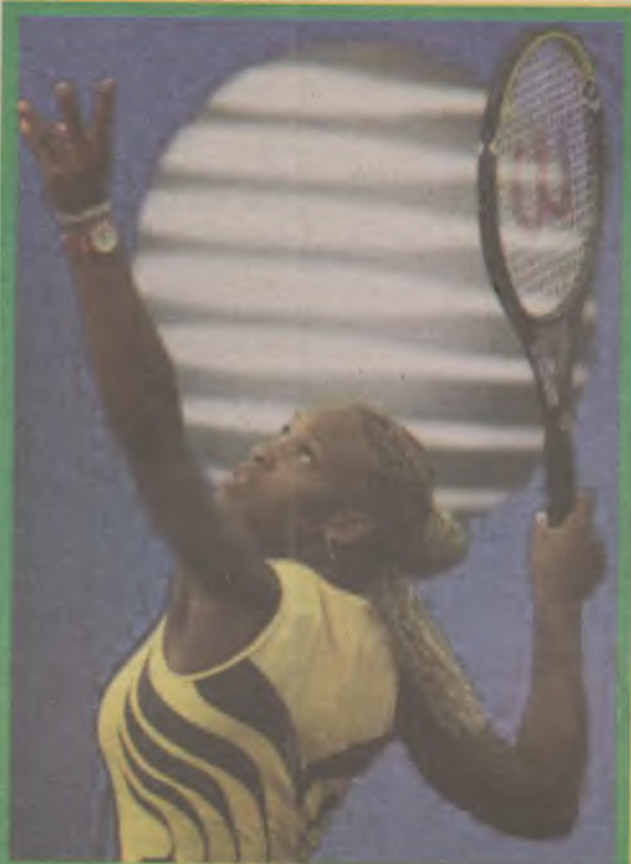
Serena Williams of the United States serves to Jennifer Capriati of the United States during their final match at the Rogers AT&T Cup in Toronto.