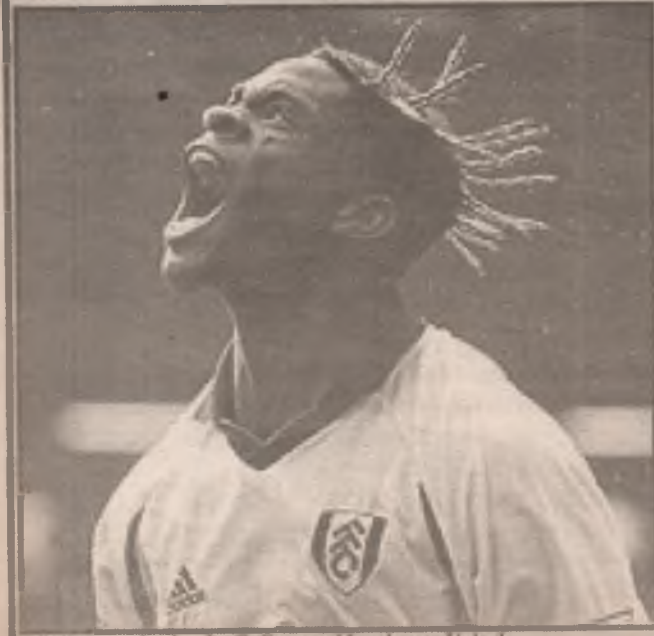
Saha scored twice for Fulham at Manchester United.

Previous editions of the clinic had been held in Kano, Owerri