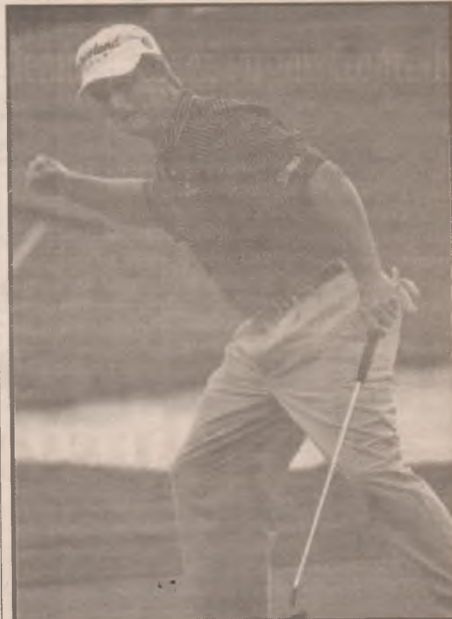
David Toms reacts as his ball drops into the hole to win the PGA Championship, on Sunday, in Duluth, Ga, USA.