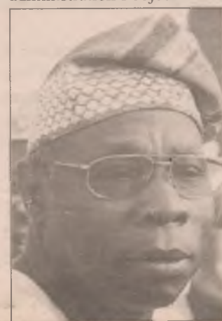
President Olusegun Obasanjo

He said in keeping with his administration's objectives of