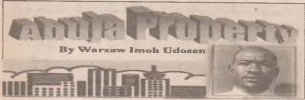
By Warsaw Imoh Udosen