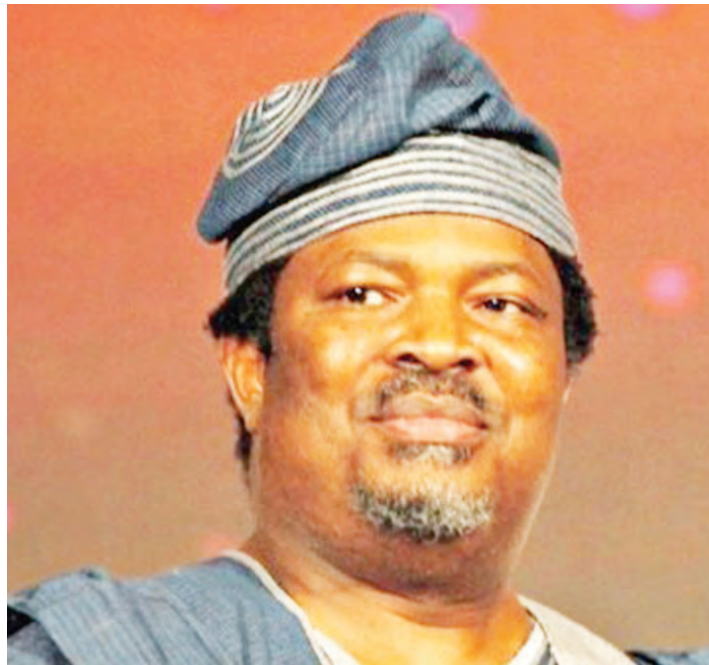
■ Nduka Obaigbena

From the business community, Chairman/President of Dangote Group of Companies, Alhaji Aliko Dangote; Chairman of BUA Group, Alhaji Abdul Samad Rabiu; Mr Femi Otedola, Mike Adenuga, Jim Ovia, Atedo Peterside, Fola Adeola and Tony Elumelu, were on ground during