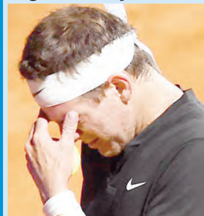
■ Juan Martin del Potro