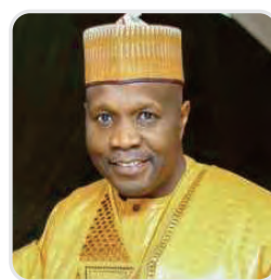
His Excellency, Muhammad Inuwa Yahaya Executive Governor, Gombe State