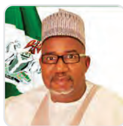
His Excellency, Sen. Bala Mohammed, CON Executive Governor, Bauchi State