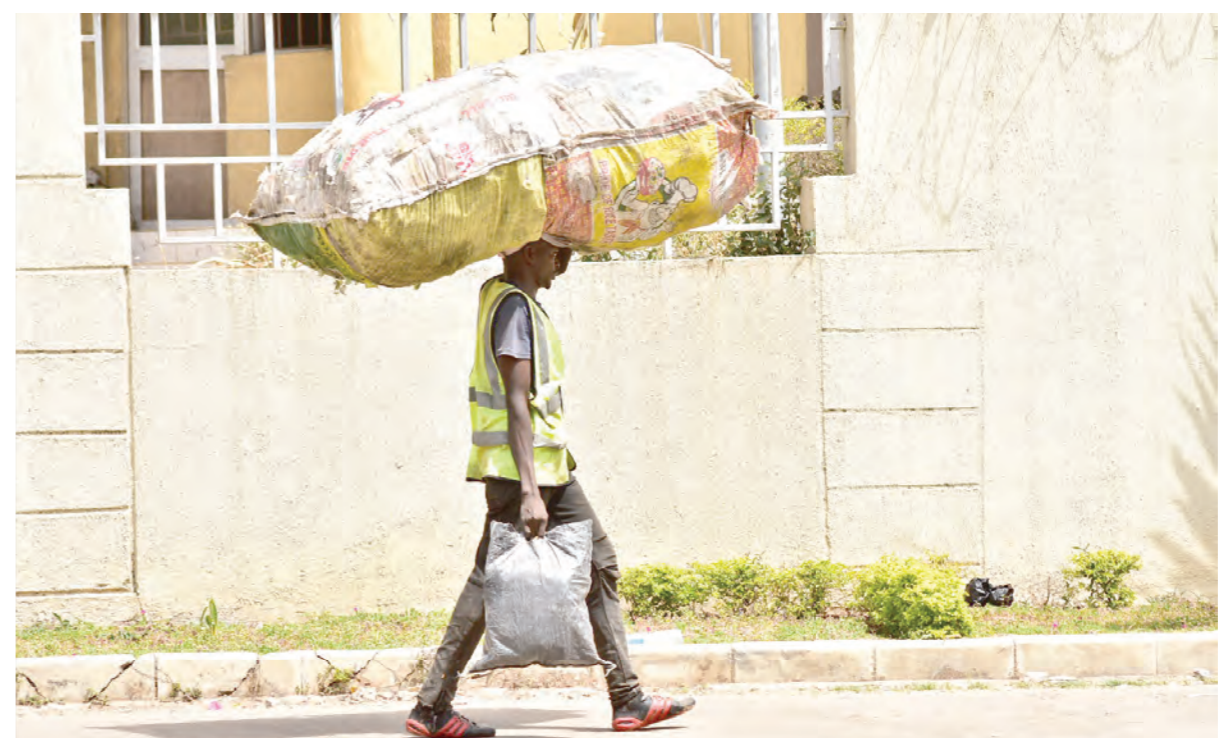
A man conveys scraps to a weighing centre along Garki Area 11 yesterday

Justice Oyindamola Ogala ordered the remand of the defendants at the Correctional Centre and adjourned the case until Feb. 23 for the hearing of the bail application. (NAN)