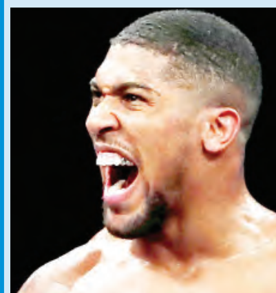
■ Anthony Joshua

Anthony Joshua's promoter Eddie Hearn said the British boxer's rematch against heavyweight rival Oleksandr Usyk is set to take place in May. Joshua lost his WBA, WBO, IBF and IBO belts to Ukraine's Usyk on a unanimous points decision in front of a sell-out crowd at London's Tottenham Hotspur Stadium in September 2021.