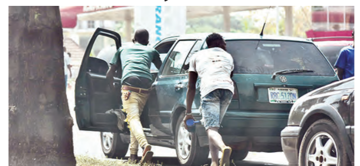
A motorist pushes his car to a nearby filling station