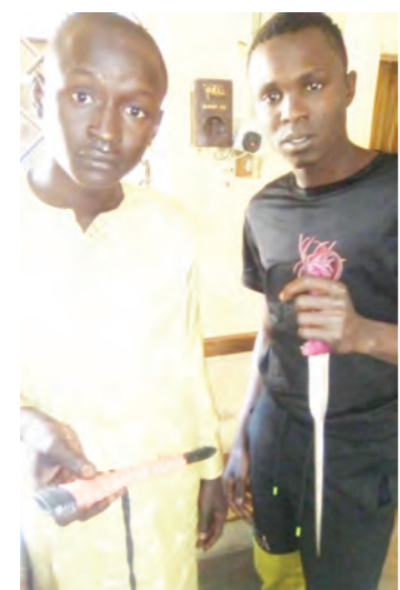
Some of the hoodlums arrested

"I didn't know that some of them were near my house, so I