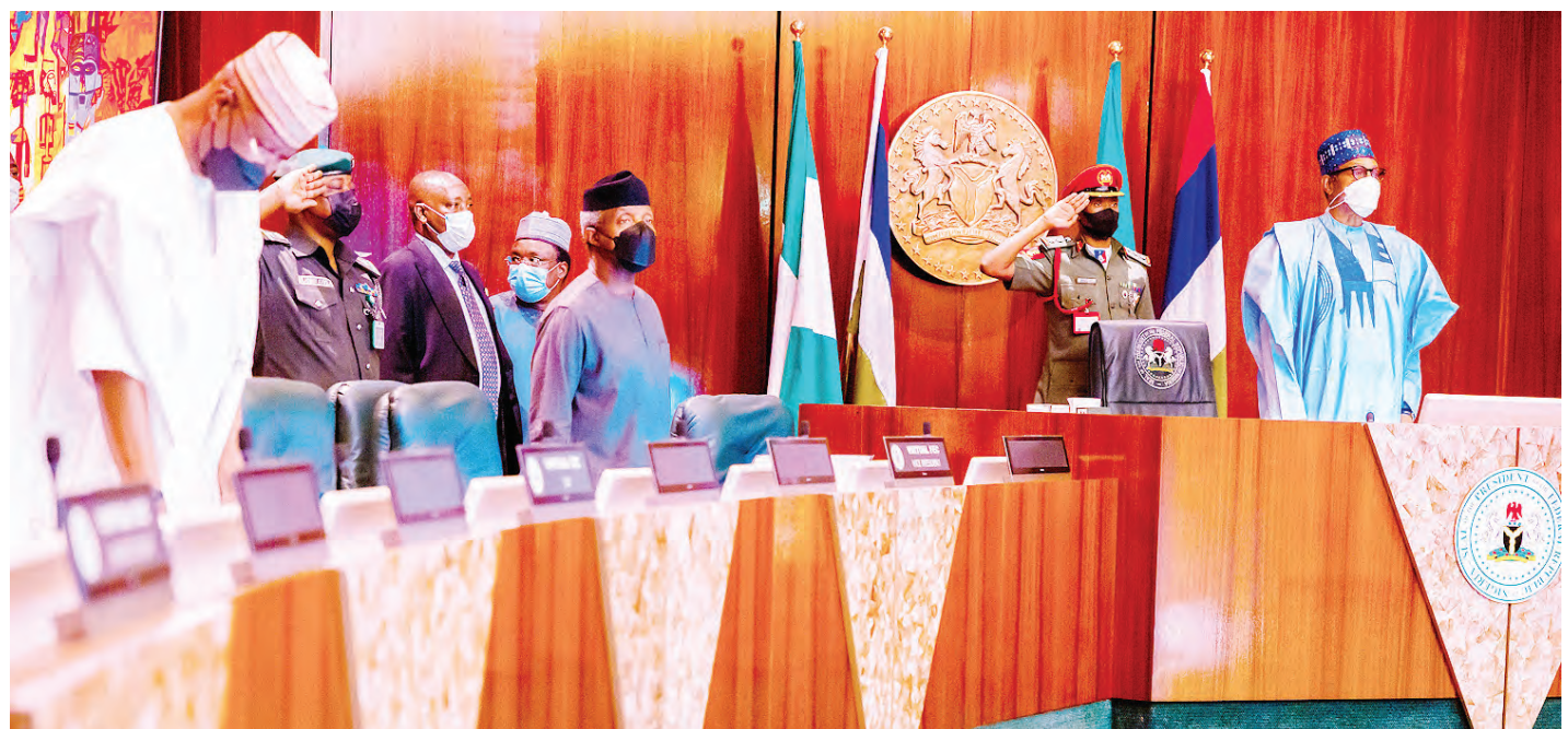
■ President Buhari presides over the Federal Executive Council Meeting in the Council Chambers at State house, Abuja yesterday

According to a submission by the agency to the committee, in 2018, it got N37, 592, 730, 753; 2019, N43, 133, 753, 661; 2020, N43, 468, 030, 400 and 2021, N43, 947, 801, 437.