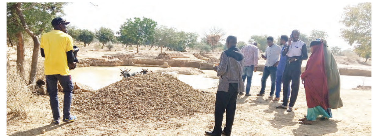
Officials in search of water problem in Kano rural communities

"In Kano, we are doing this in partnership with the Ministry of Water Resources and RUWASA, and then in other parts of the country, it is also an ongoing project with other local and international NGOs."