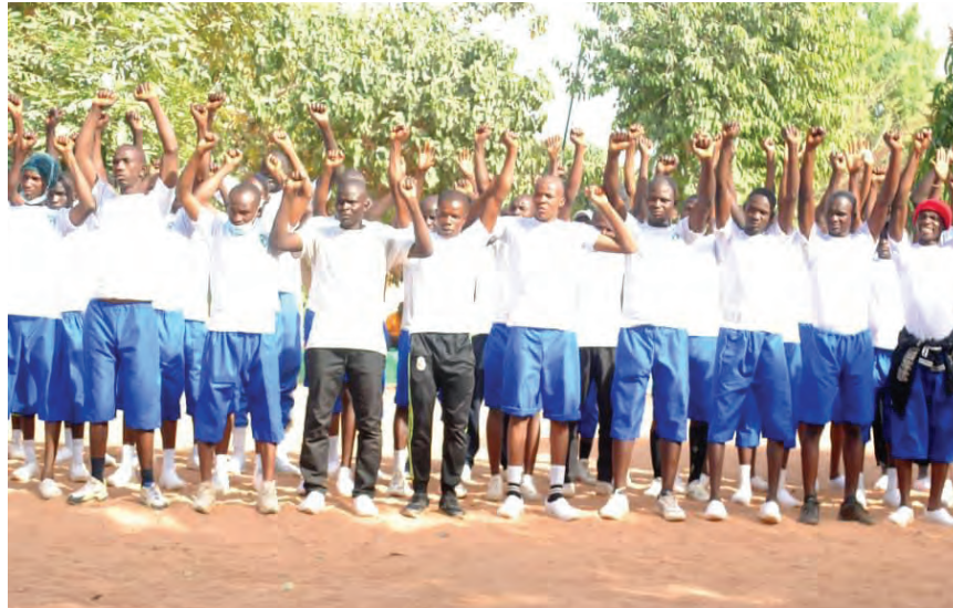
■ Cross section of Batch A trainees of the newly introduced GoSTEC during a morning drill at Amada camp

2019, Yahaya had vowed to reduce crime rate to the barest minimum and mitigate security threats.