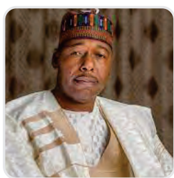
His Excellency, PROF. BABAGANA UMARA ZULUM, Mni, FNSE Executive Governor, Borno State Chairman, North East Governors' Forum (NEGF)

We wish you and the entire good people of Ekiti State long life, happiness and prosperity.