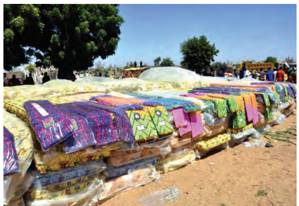
■ Clockwise: Governor Zulum at the resettlement of Malari village returnees with provision of cash support for livelihoods, food and non food items, yesterday in Malari,,Konduga LGA.