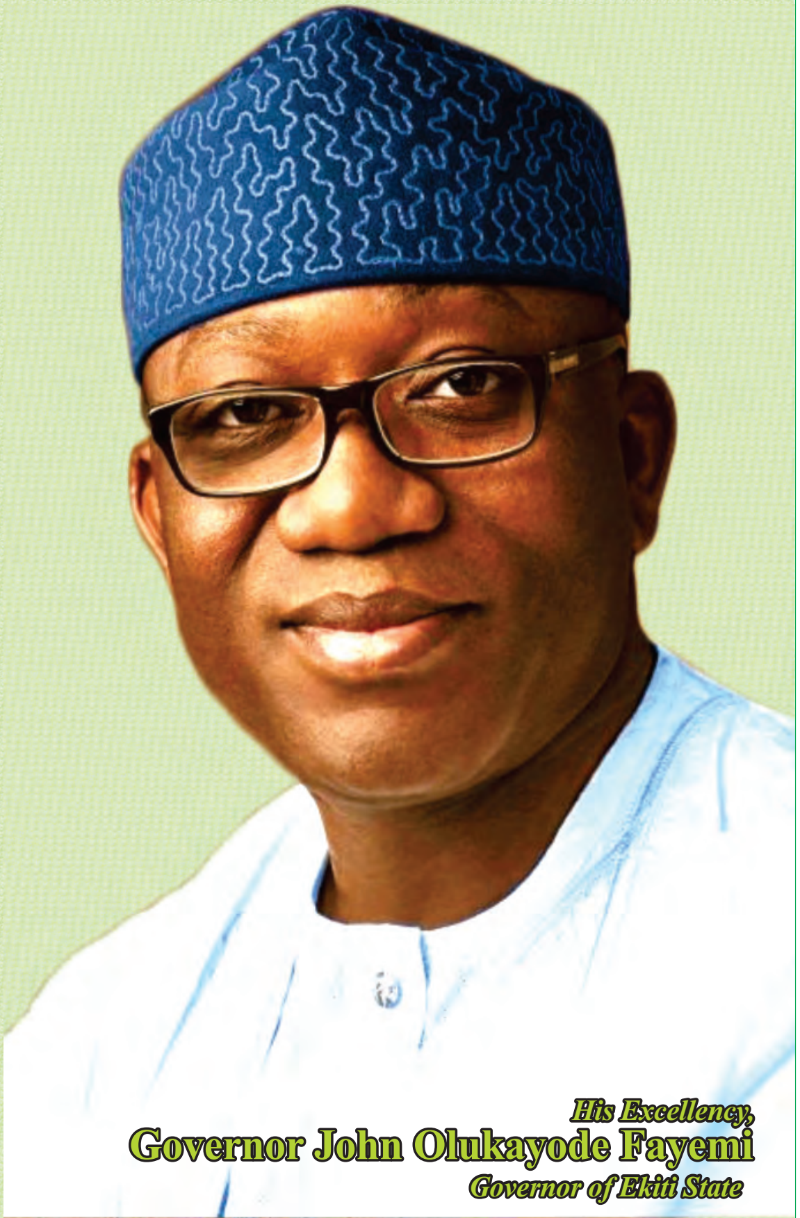
His Excellency, Governor John Olukayode Fayemi Governor of Ekiti State

Governor John Olukayode Fayemi has at various times led Governors to parts of the Northeast as a show of solidarity and support over the security challenges faced by the subregion.