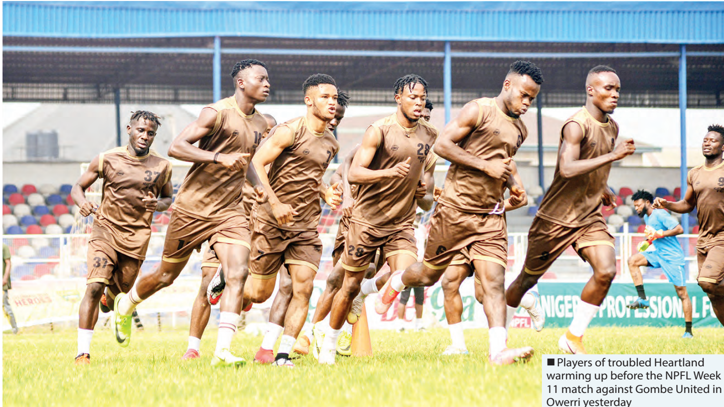
■ Players of troubled Heartland warming up before the NPFL Week 11 match against Gombe United in Owerri yesterday