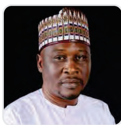
His Excellency, Rt. Hon. Ahmadu Umaru Fintiri Executive Governor, Adamawa State