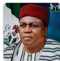
His Excellency, Arch. Darius Dickson Ishaku Executive Governor, Taraba State