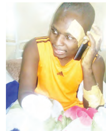
One of the victims of the attack

came out to help my neighbour. Immediately I came out one of them stabbed me on my head and I fell down. They continued stabbing all parts of my body. I heard one of them saying, 'Kill him, don't spare him.' When I realised they were targeting my head, I used my hands to block them, that was how one of them used a cutlass and cut my hand, including the bones, only the flesh was holding it."