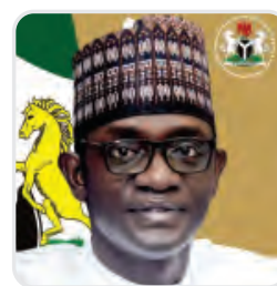
His Excellency, Hon. Mai Mala Buni Executive Governor, Yobe State