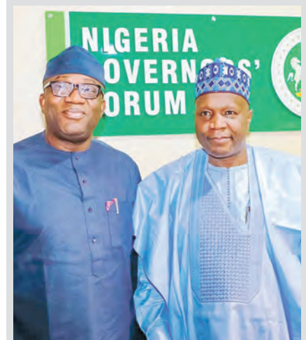
■ Governor Muhammadu Inuwa Yahaya (R) with Chairman of Nigeria Governors' Forum and Governor of Ekiti State, Dr. Kayode Fayemi

Also, Gombe State was recently adjudged the most peaceful state in the North-East by the forum of State Directors of Security.