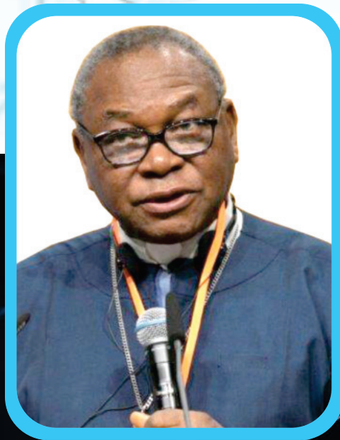
John Cardinal Onaiyekan Archbishop Emeritus of Abuja.