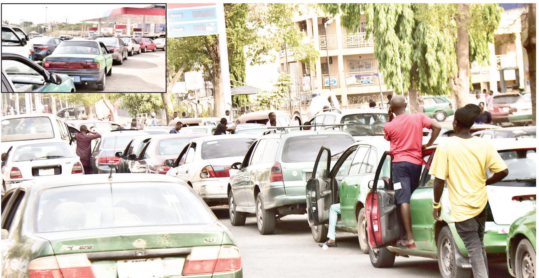
Motorists queue at a fuel station as scarcity worsens in parts of the Federal Capital Territory, Abuja, yesterday