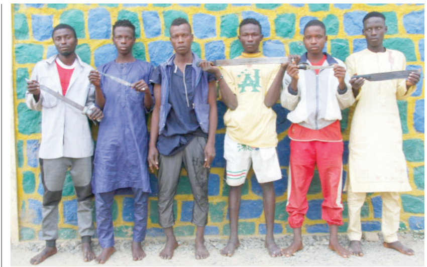
Suspects arrested by the police in Bauchi State recently