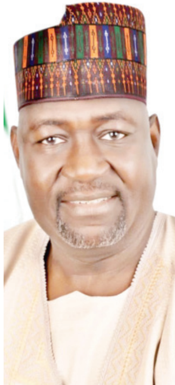
■ Minister of Power, Engr. Abubakar D. Aliyu

"I approached the Ado office of AEDC for a meter only to be told I have to pay N64,000 for a single phase. I did not have that money at once and there is no arrangement for instalment