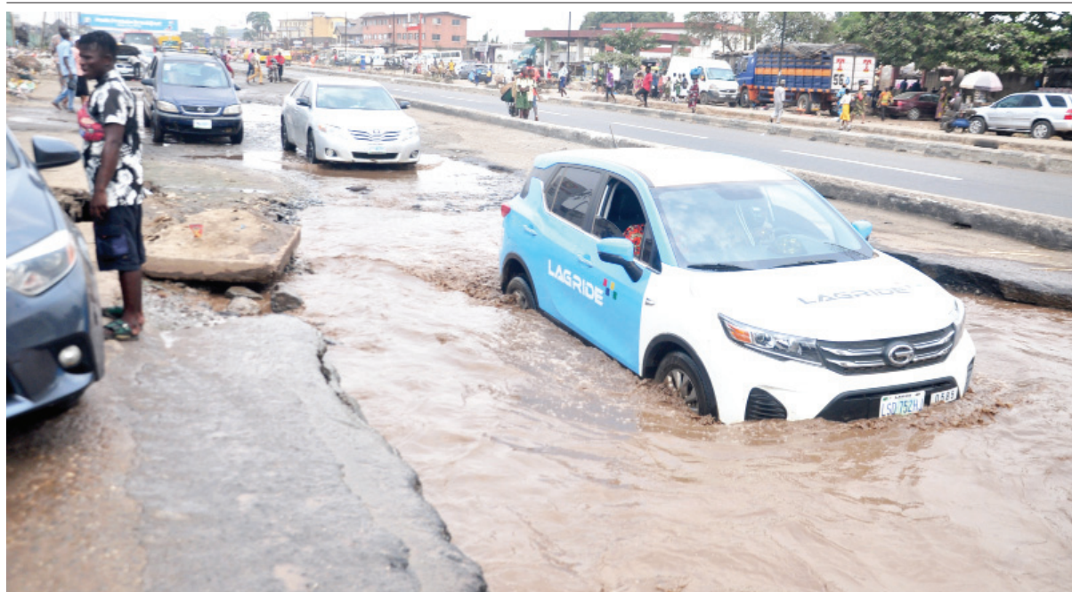
Motorists waded through a dilapidated portion of Lagos-Abeokuta Expressway at Ile-Epo Market in Lagos State

On what might have caused the derailment, he stated: "The cause of the derailment is not yet determined. Due to this incident, the service along the corridor has been suspended. Further details would be communicated to members of the public".