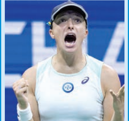
■ Iga Swiatek

World No 1 Iga Swiatek was bundled out of the Australian Open fourth round on Sunday, with title threat Coco Gauff also exiting in tears, as a pair of underestimated Grand Slam champions tore open the women's draw.