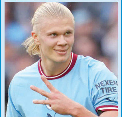
■ Erling Haaland

Norwegian goalscoring phenomenon Erling Haaland fired his fourth Premier League hat-trick of a remarkable season to earn Manchester City a comfortable 3-0 victory over Wolverhampton Wanderers on Sunday.