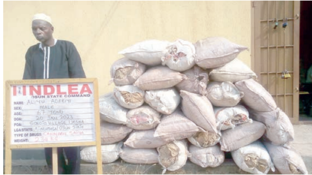
The blind suspect

Jajere, who noted that the federal government-funded project was expected to be completed in April, explained that the project involved the construction of three work stations with a joint capacity to produce 27 million litres daily. Jajere said that the three stations located at Sunsumma, Nayinawa and Mallamari areas had been completed. (NAN)