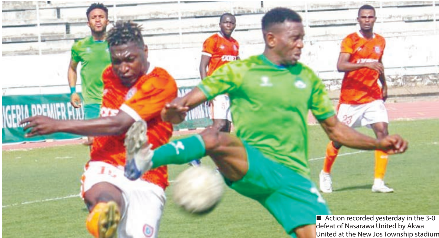
■ Action recorded yesterday in the 3-0 defeat of Nasarawa United by Akwa United at the New Jos Township stadium