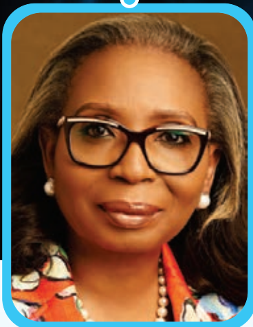
Mrs. Ibukun Awosika Former Chairman, First Bank of Nigeria (FBN).