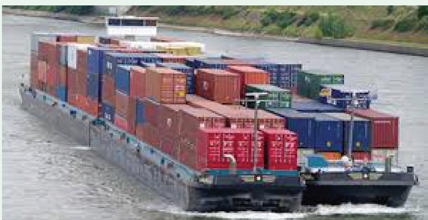
■ movement of cargo barge in Nation's waters

Despite the complaint of insecurity around the nation's waterways, the National Inland Waterways Authority (NIWA) says movement of cargo across the country remains the best option.