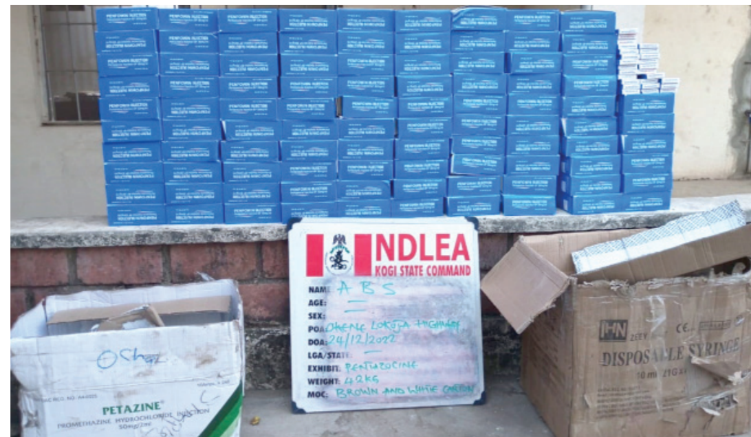
Some drugs seized by the NDLEA operatives in Kogi State recently