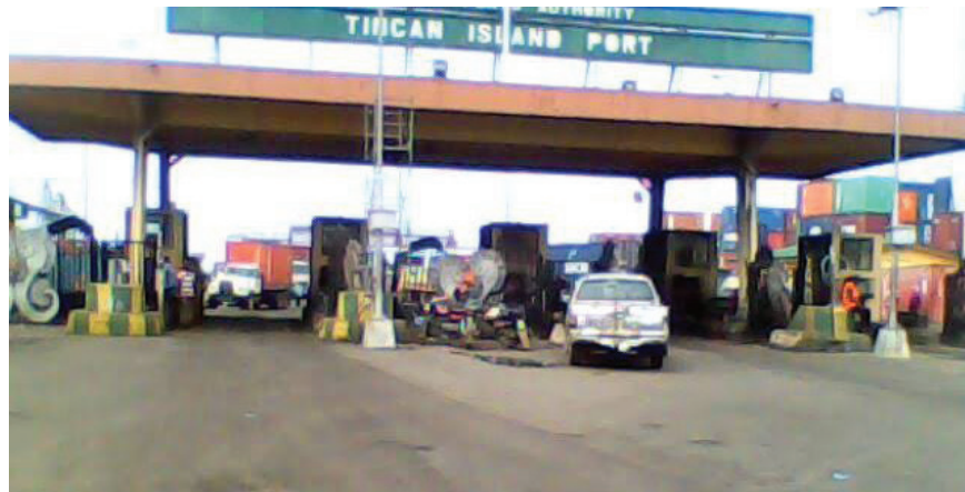
■ Tin-Can Island port, Lagos

appeal to all shipping companies and terminal owners to look into the current situation and use their good offices to grant a waiver to us so as to reduce the burden on both the importers and clearing agents' shoulders.