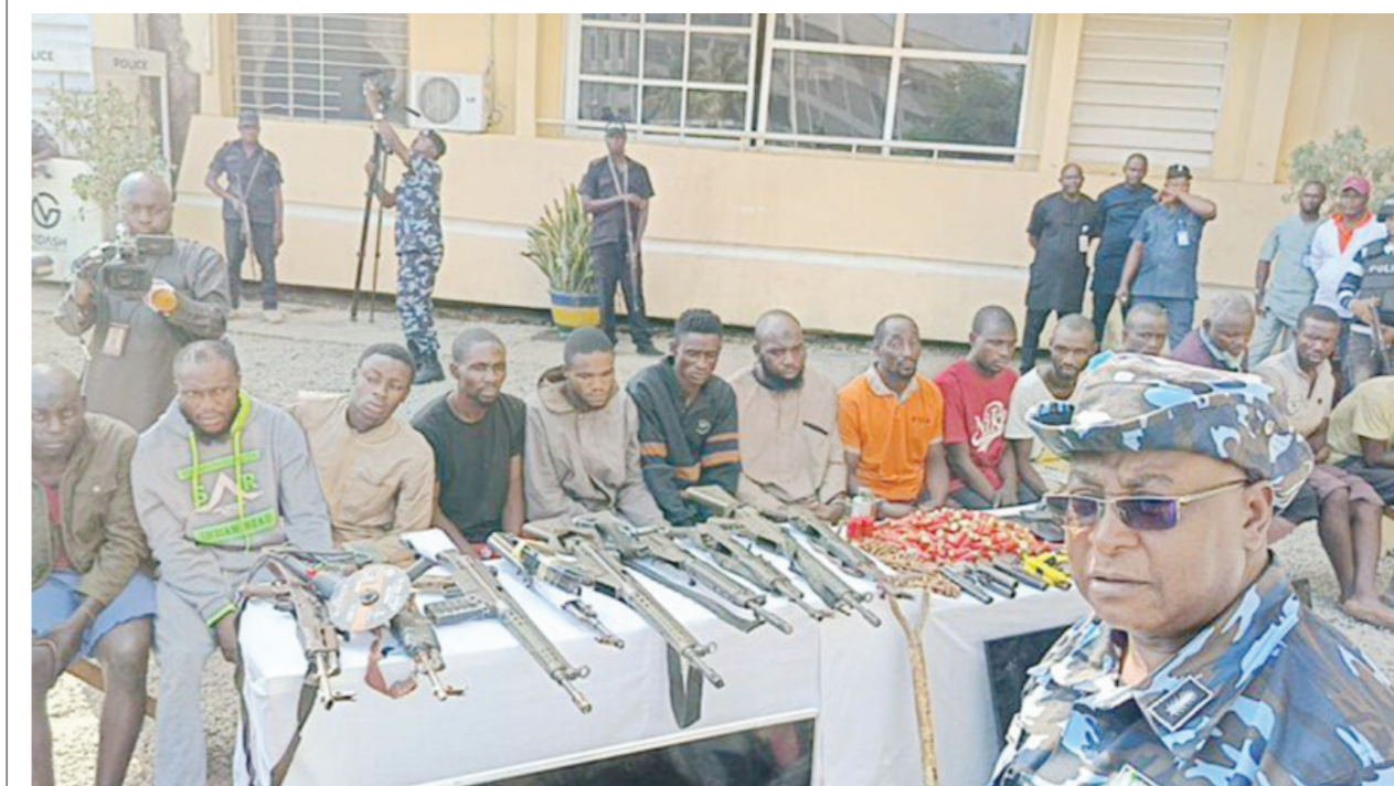
Some suspects paraded at the FCT police command at the weekend