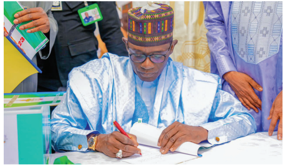
■ Governor Mai Mala Buni while signing the 2023 budget at the government house Damaturu