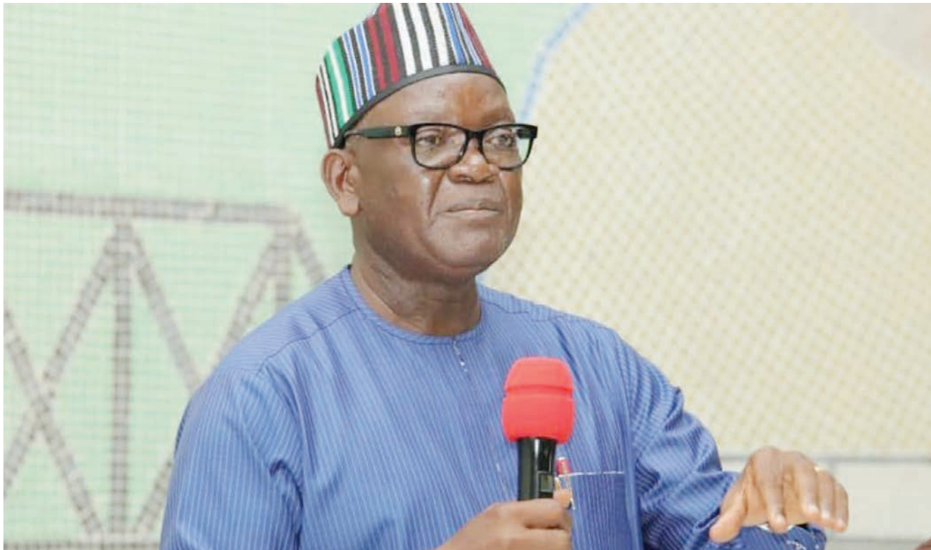
■ Governor Samuel Ortom