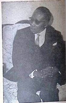
Senghor—promises for "our dear Casamance"

The President's sensitivity to these complaints may be seen from his promises of better things—not just a carrot in the mystical year 2000, which of late he has