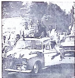
Celebration in the Streets of Bamako after the coup.

ning to realise the enormity of the job ahead.