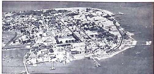
The City of Bathurst: the MacCarthy Square cricket pitch can be seen among the trees in the background.

All this has led to hotel development. The Atlantic Hotel, established by the Madi brothers, the old established