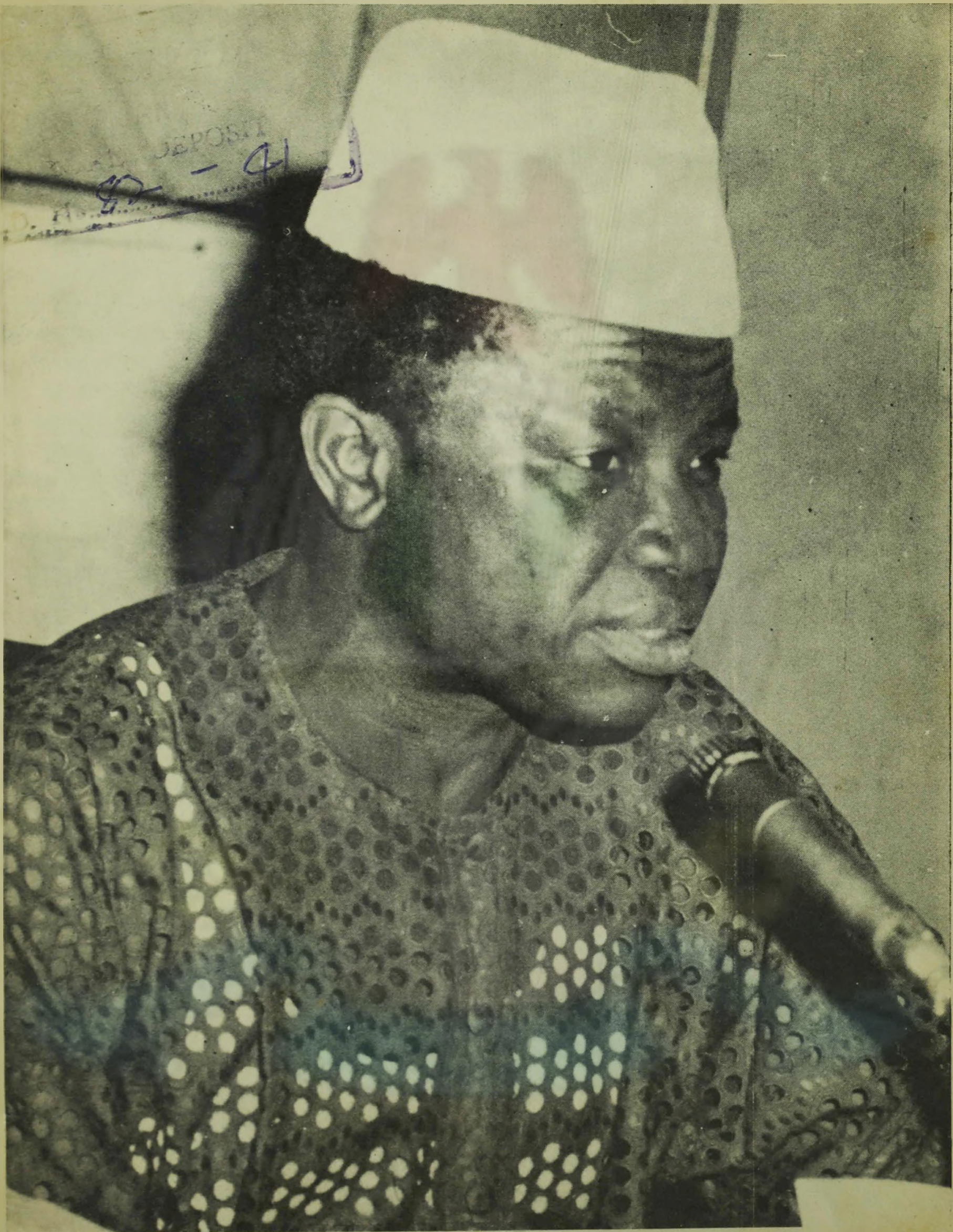
ALHAJI LATEEF KAYODE JAKANDE Governor of Lagos State