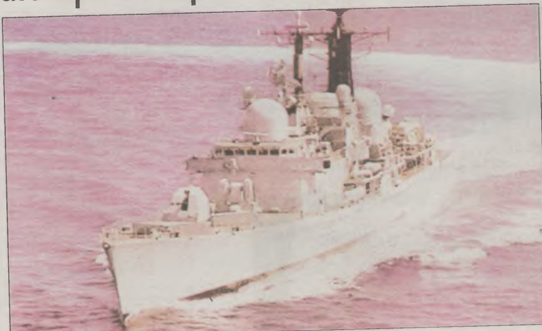
TYPE 2 destroyer the HMS York is patrolling waters off Port Stanley

Refuting claims that appeared in The Sun, the MoD said that the York was replacing another ship in the region during a routine