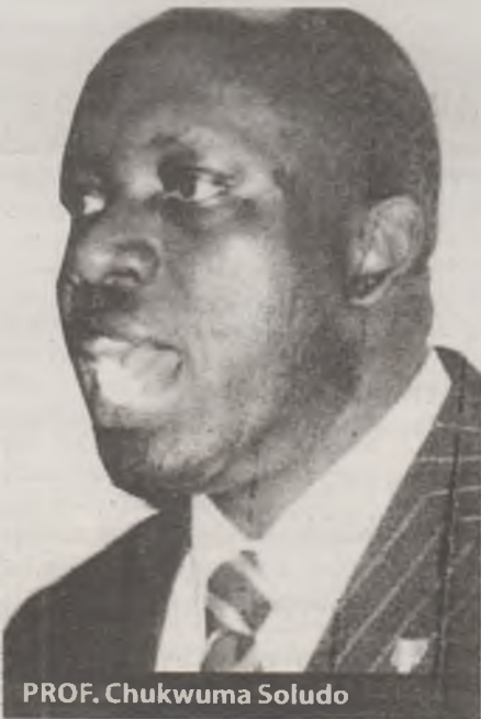
PROF. Chukwuma Soludo