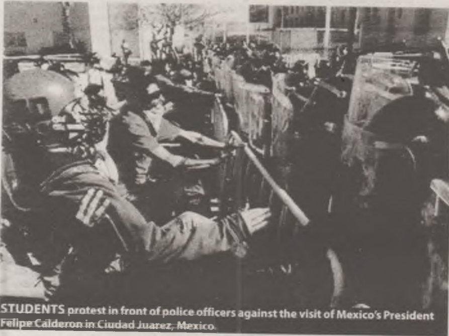
STUDENTS protest in front of police officers against the visit of Mexico's President Felipe Calderon in Ciudad Juarez, Mexico.