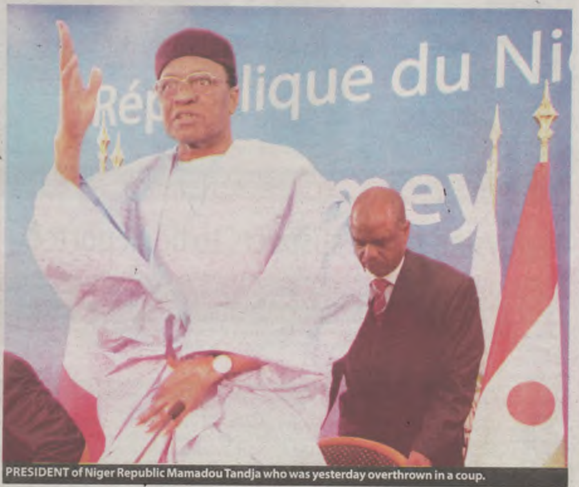
PRESIDENT of Niger Republic Mamadou Tandja who was yesterday overthrown in a coup.

He also wondered why people should be skeptical about the transaction, adding that the BPE couldn't have qualified them without passing the necessary process.