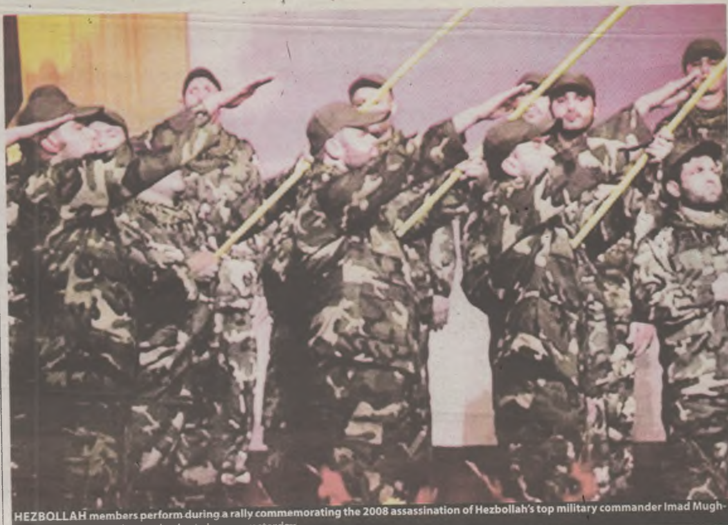
HEZBOLLAH members perform during a rally commemorating the 2008 assassination of Hezbollah's top military commander Imad Mughniyeh in Beirut's southern suburbs, Lebanon, yesterday.

THE leader of Lebanon's Shiite movement Hezbollah recently delivered an odd but deeply important political message to his followers: Heed traffic signs and pay your electric bills.