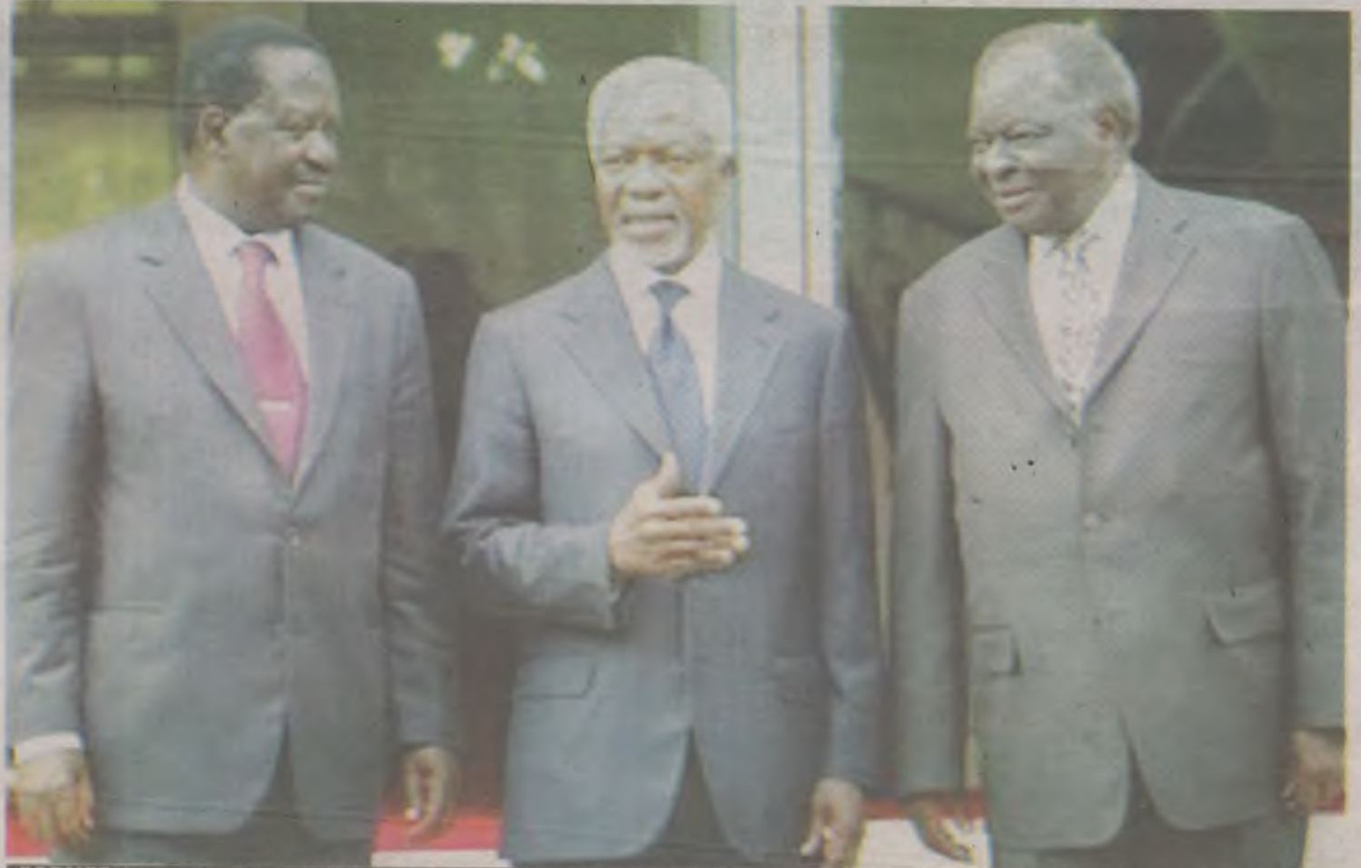
FORMER UN Secretary General Kofi Annan (centre) talks to Kenyan President Mwai Kibaki (right) and Kenyan Prime Minister Raila Odinga in Nairobi.

The accord resulted in a power-sharing deal between the two poll rivals, Kibaki keeping his job as president while Odinga became prime minister. Odinga had called on Annan to intervene earlier this week after Kibaki overruled his suspension of two