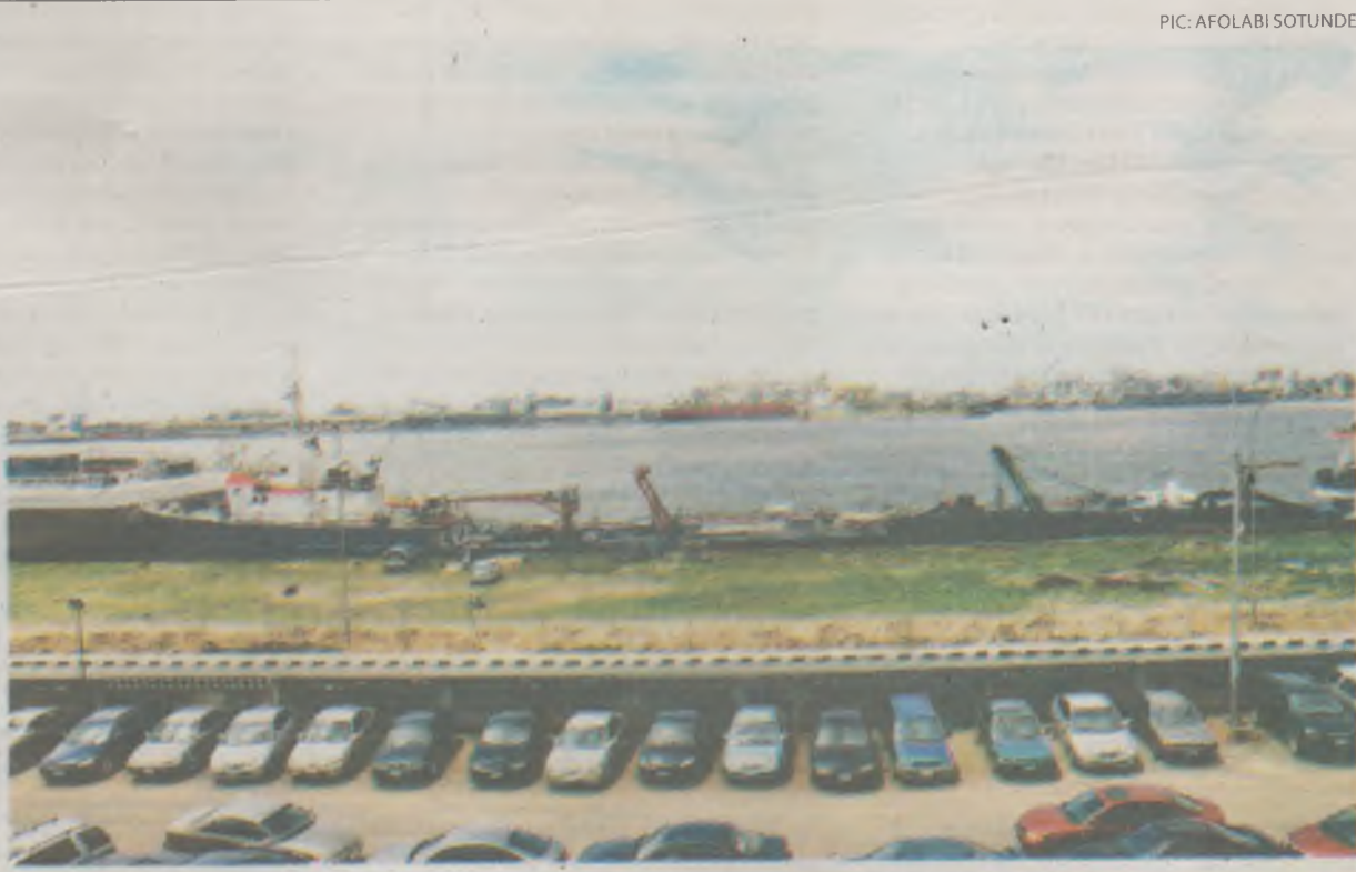
APAPA wharf, Lagos, viewed from the Marina.

"We have so many ongoing projects in the areas of water, roads health and education, among several others," he said. (NAN)