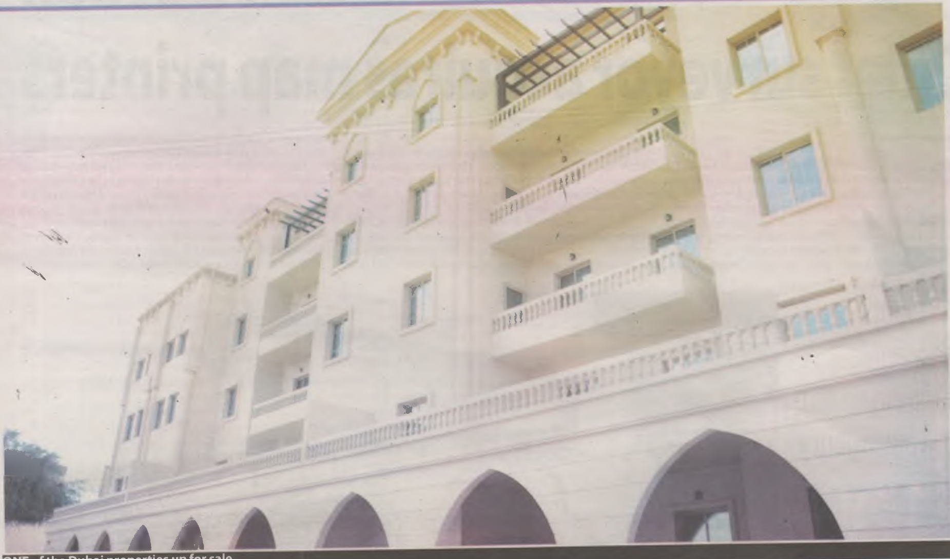
ONE of the Dubai properties up for sale