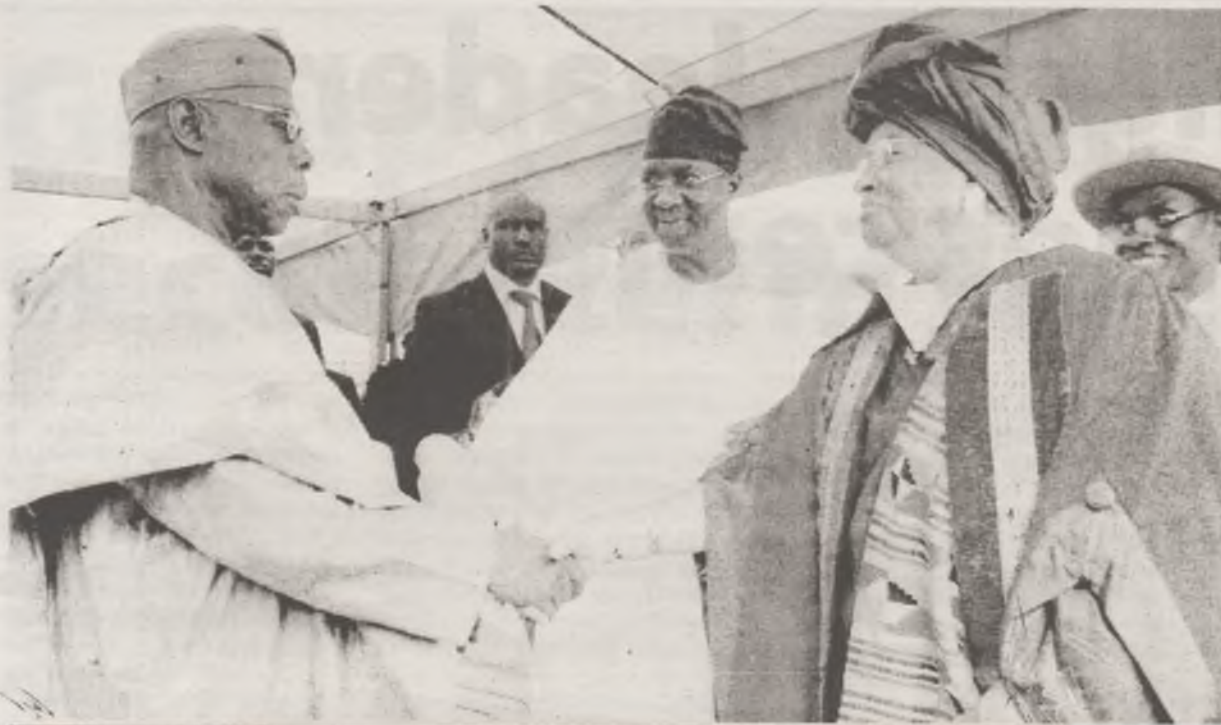
LIBERIAN president Ellen Johnson-Sirleaf (right), with former President Olusegun Obasanjo (left) and Governor of Ogun State, Otunba Gbenga Daniel (middle) after she was conferred with the Doctor of Science, honorary degree, by the University of Agriculture, Abeokuta at the 17th Convocation of the Institution yesterday.