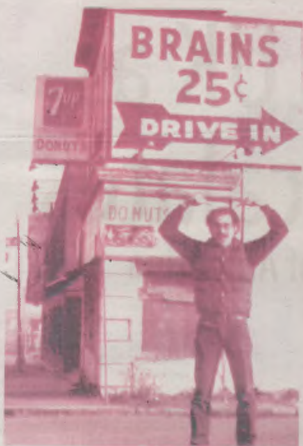
Brains for sale? Some people could use some now.