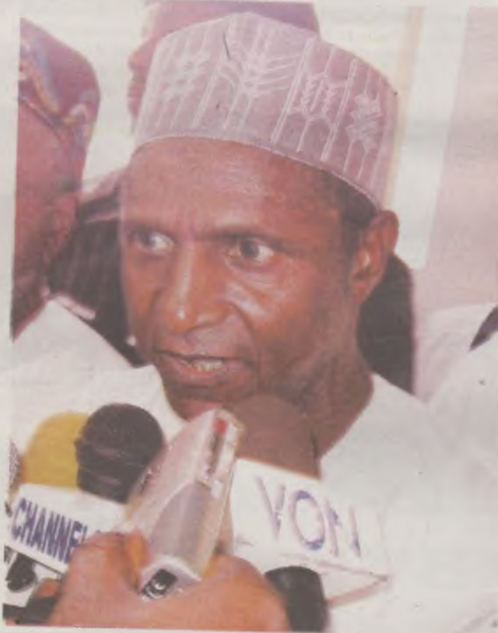
PRESIDENT Umaru Yar'adua