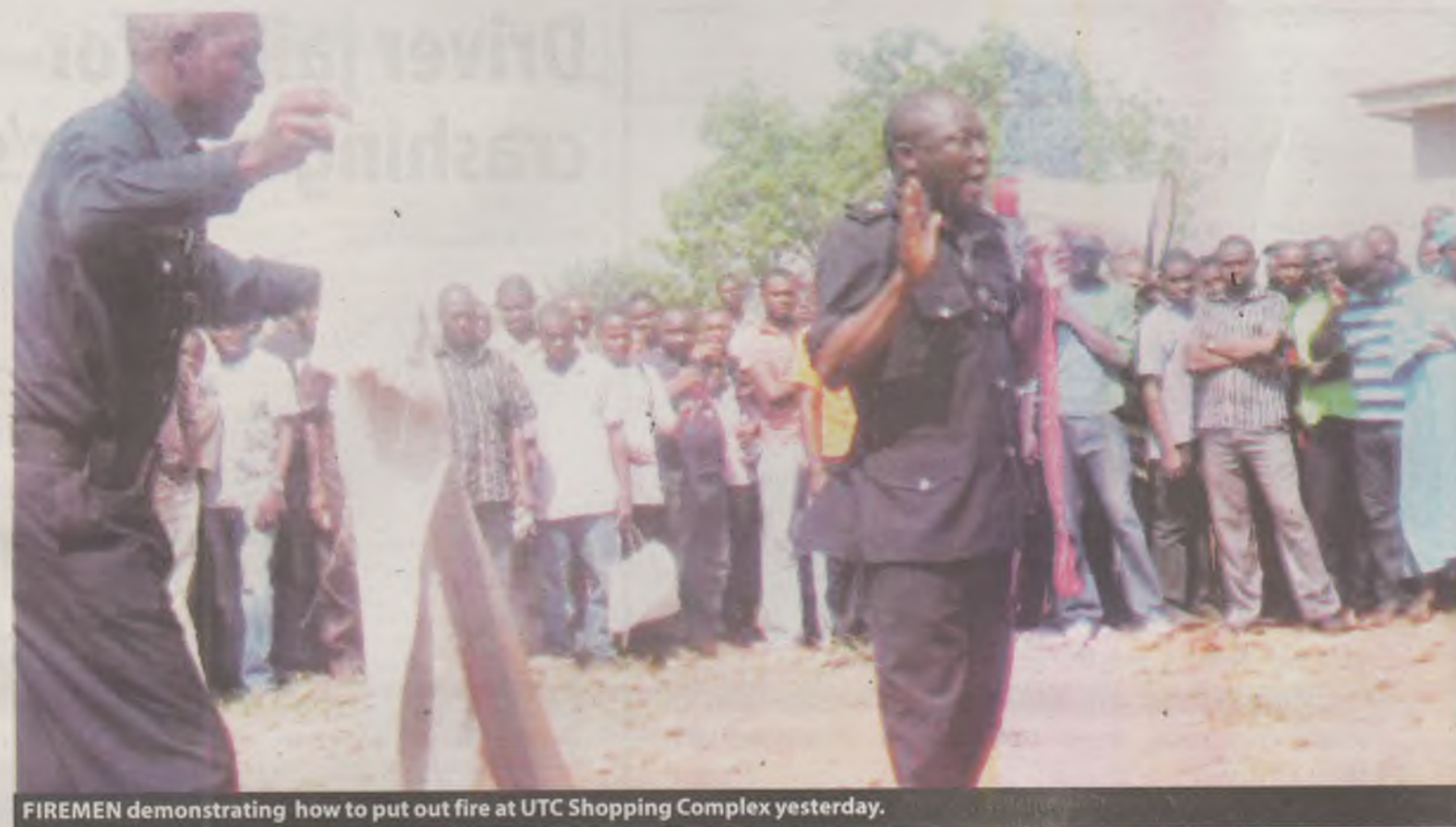
FIREMEN demonstrating how to put out fire at UTC Shopping Complex yesterday.