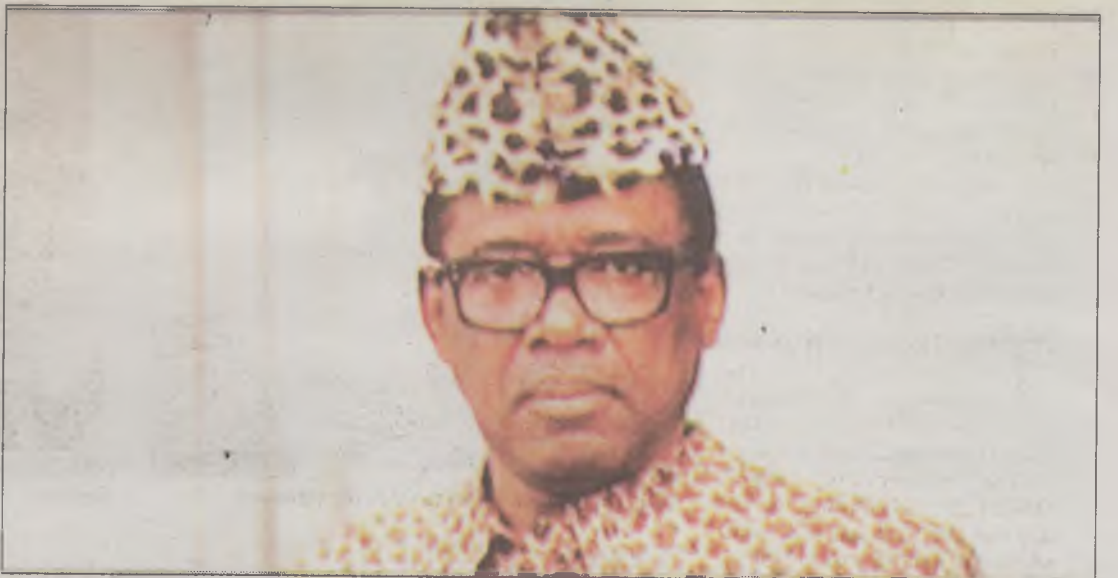
JOSEPH-DESIRE Mobutu changed his name to Mobutu Sese Seko Kuku Ngbendu Wa Za Banga and Congo's to Zaire

“After the third day I had to ask him why he was called Mistake ”