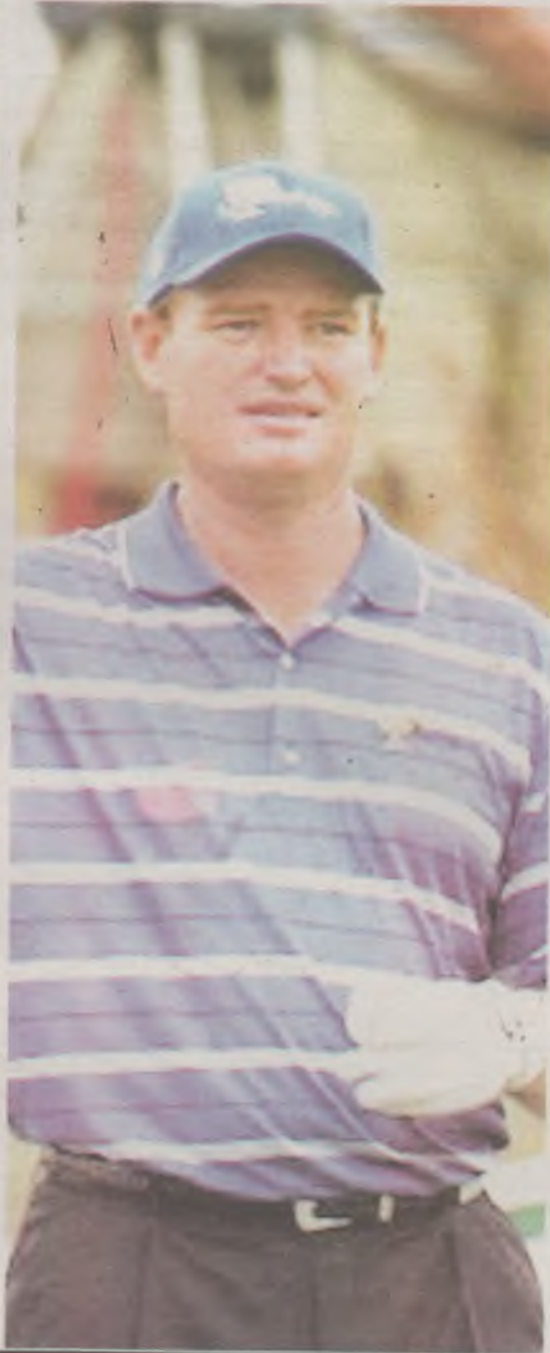
TIGER Woods, left, criticised by Ernie Els, right, for choosing today to break his silence having taken an indefinite break from golf.

responded: "It's always good to get your information right before