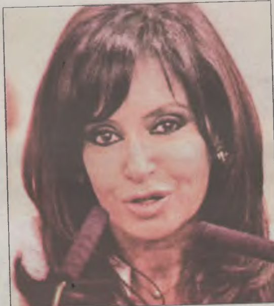
ARGENTINA President Cristina Fernandez de Kirchner