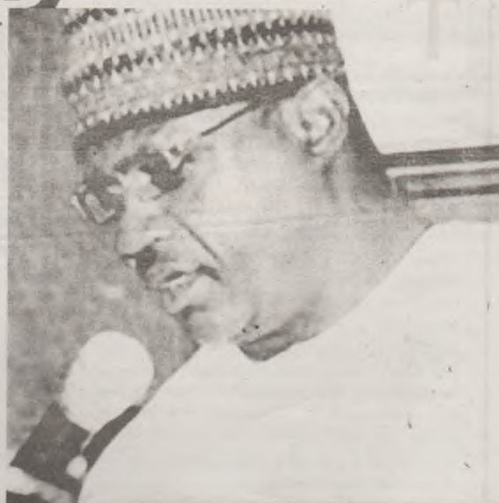
GOVERNOR Ibrahim Gaidam

The Supreme Court is likely to take a decision today, which will swing either way. If the Court upholds the decision of the Appeal Court in Jos, it will