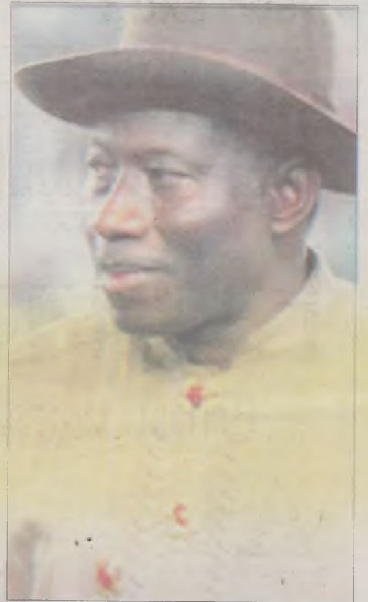
SOME say Nigeria's new president is a lucky man because of his name