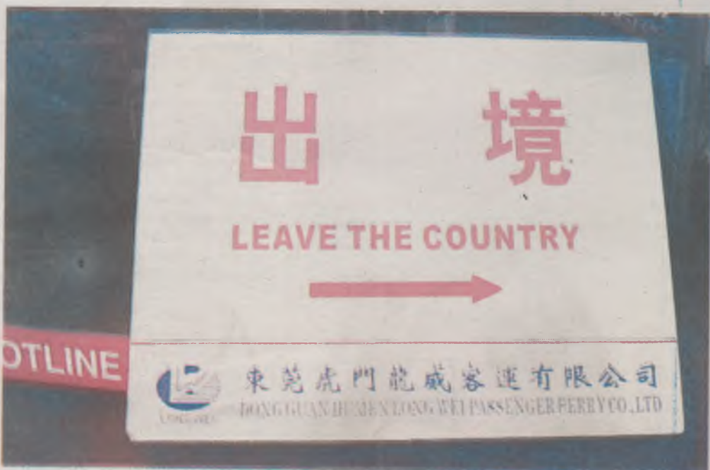
You've overstayed your welcome Photo location: Dongguah Ferry Terminal, China, by Poom Chantha Culled from the telegraph.co.uk