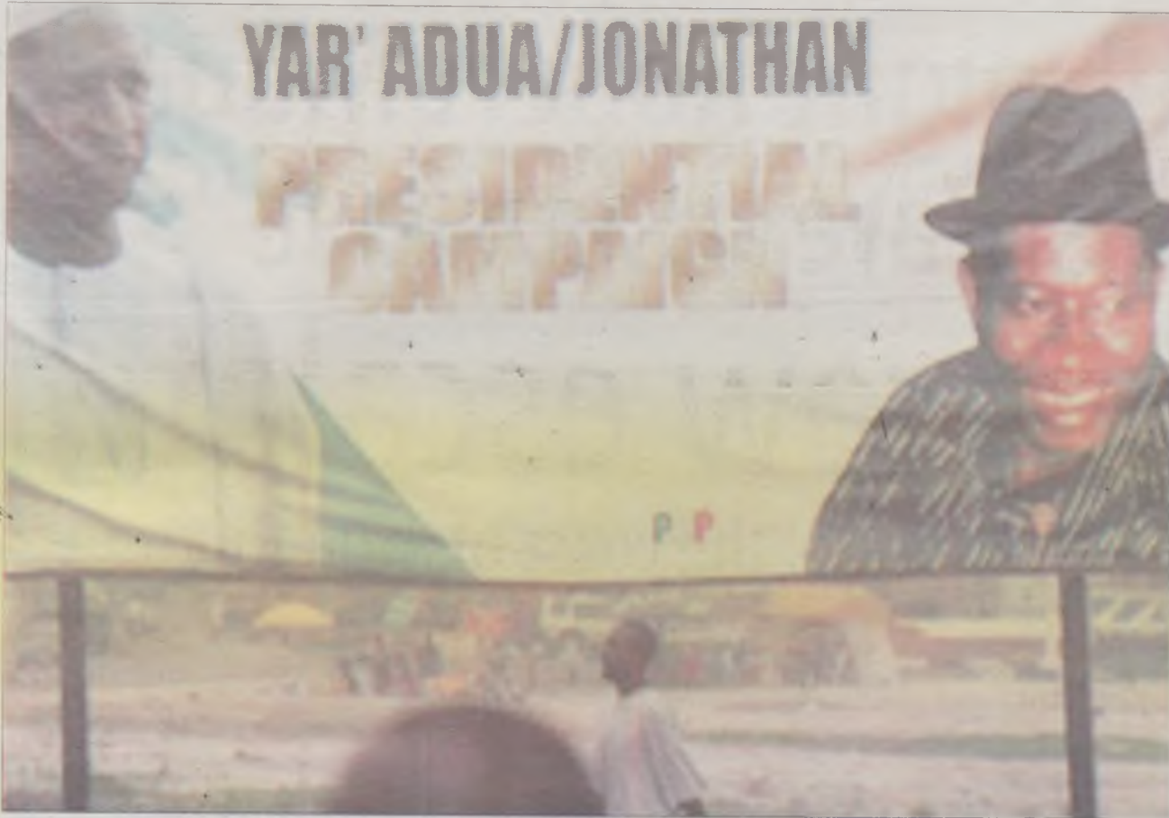
GOODLUCK Jonathan's rise to power has been described as "meteoric"