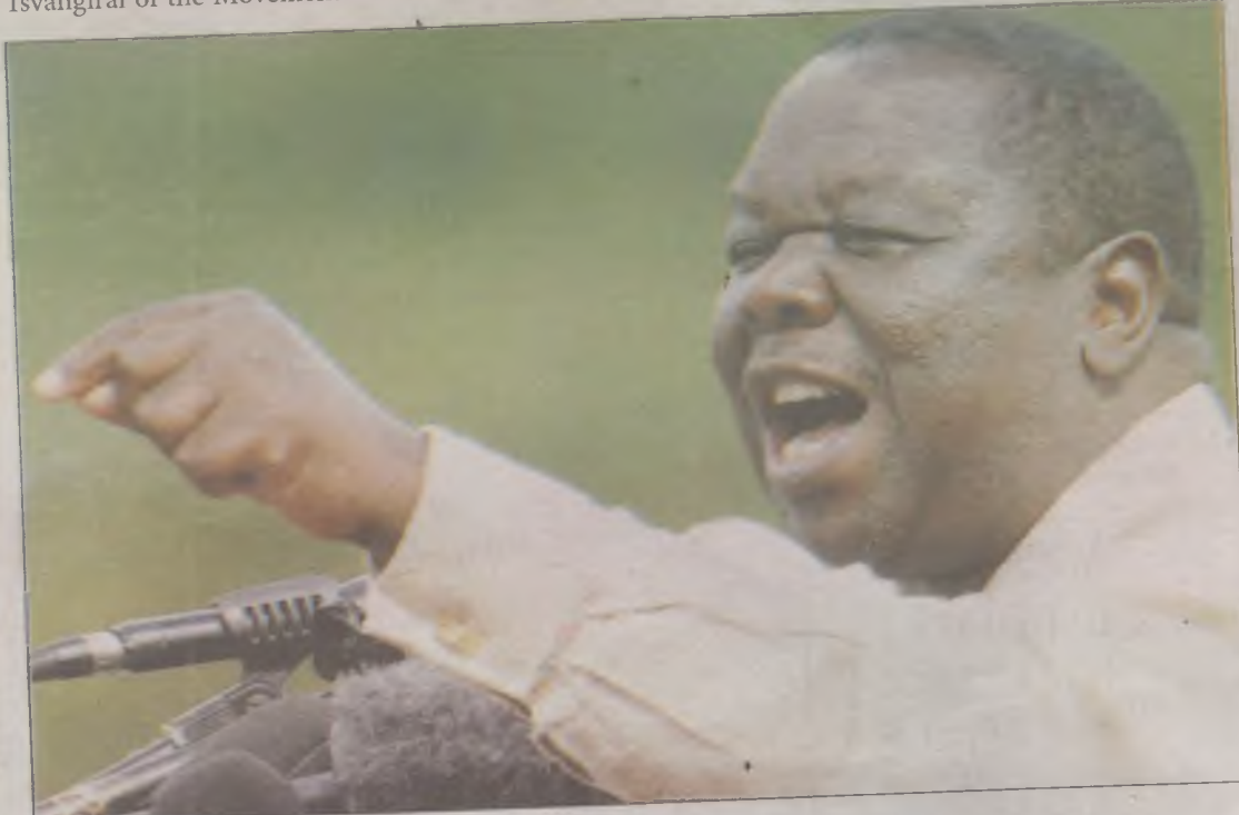
PRIME Minister Morgan Tsvangirai

The MDC said last week that fresh elections may be needed after the latest efforts to end deadlock with Mugabe in the one-year-old unity government ended in failure.