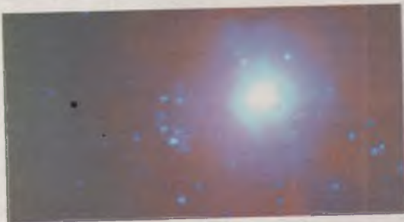
THIS is from the Chandra X-Ray Observatory and shows evidence from Nasa's Chandra X-ray Observatory and the Magellan telescopes

ASTRONOMERS who have long used supernovas as cosmic markers to help measure the expansion of the