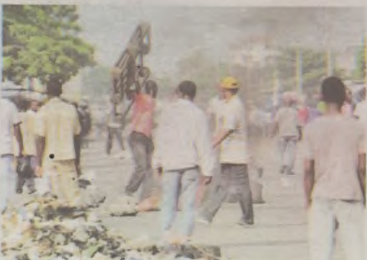
SEVERAL dozens of Ivorian opposition youth man a barricade during a demonstration in Abidjan.