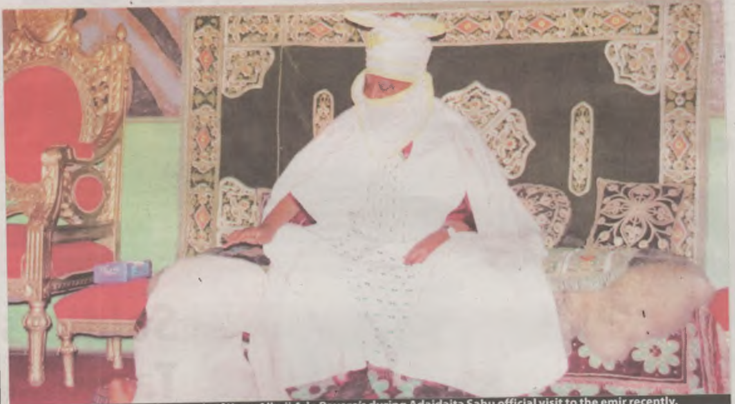
A boy receiving blessings from Emir of Kano Alhaji Ado Bayero's during Adaidaita Sahu official visit to the emir recently.

The suspects were found with a large sum of 5, 10 and 20 Naira denominations. They will soon be charged to court.