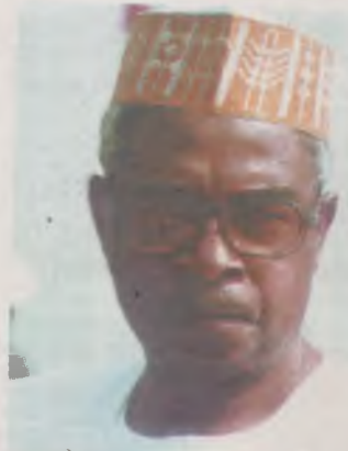
GENERAL T.Y. Danjuma