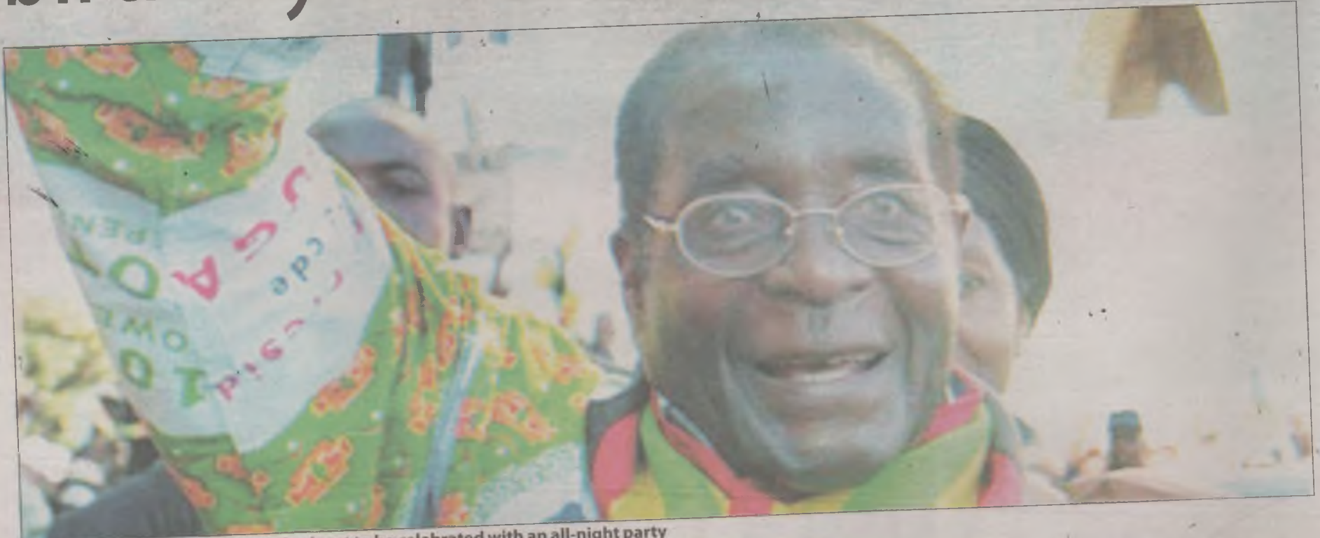
ROBERT Mugabe: His 86th birthday is set to be celebrated with an all-night party

Plans to hold a lavish all-night birthday party for the Zimbabwean president, Robert Mugabe, have been condemned as insensitive to the suffering of the country's people.