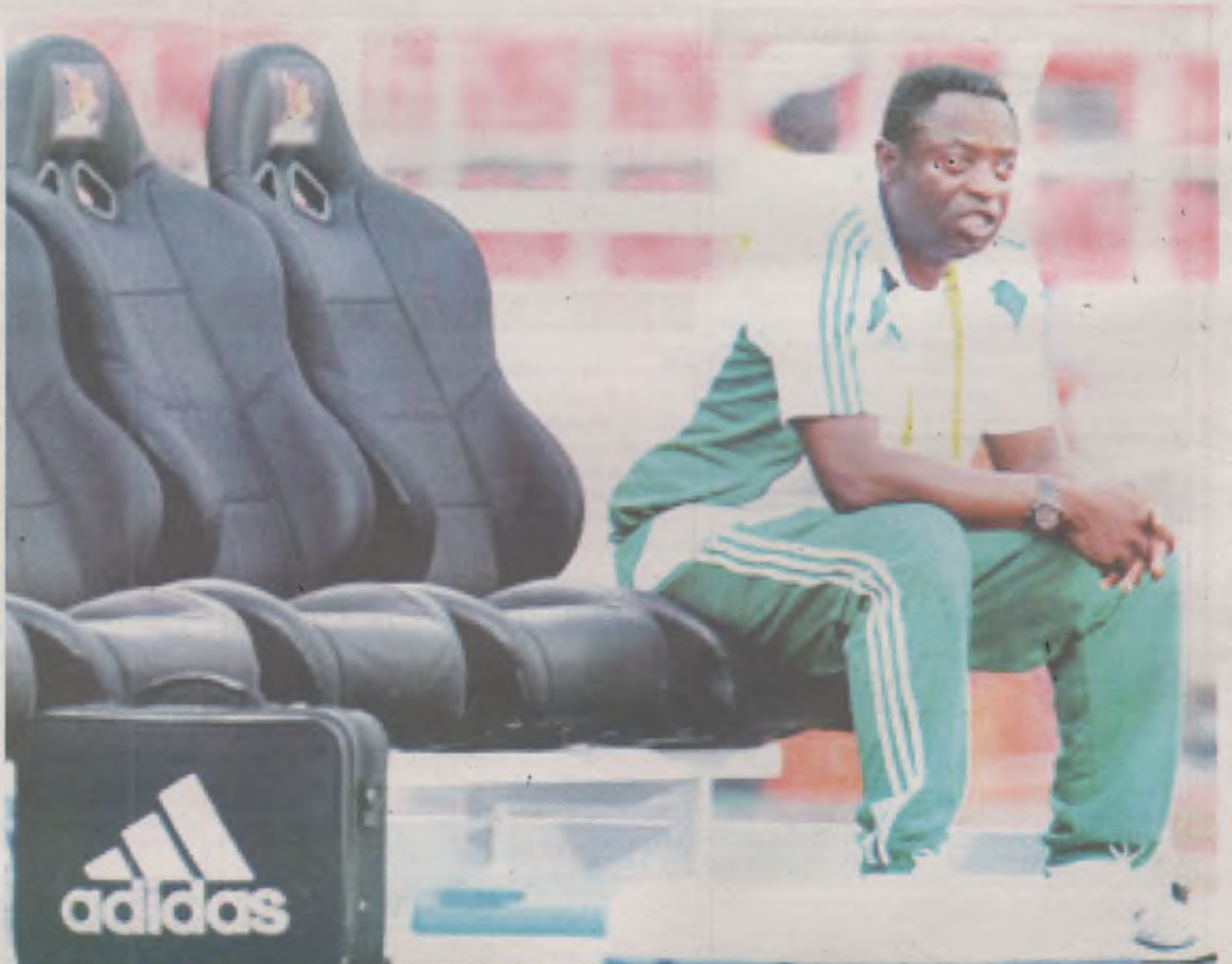
DEMOTED Super Eagles coach Shaibu Amodu still wants to sit on the bench and assist the foreign technical adviser at the 2010 World Cup finals in South Africa.

He defended his choice of a half-fit Obafemi Martins ahead of Michael Eneramo and also picked Nwankwo Kanu to lead