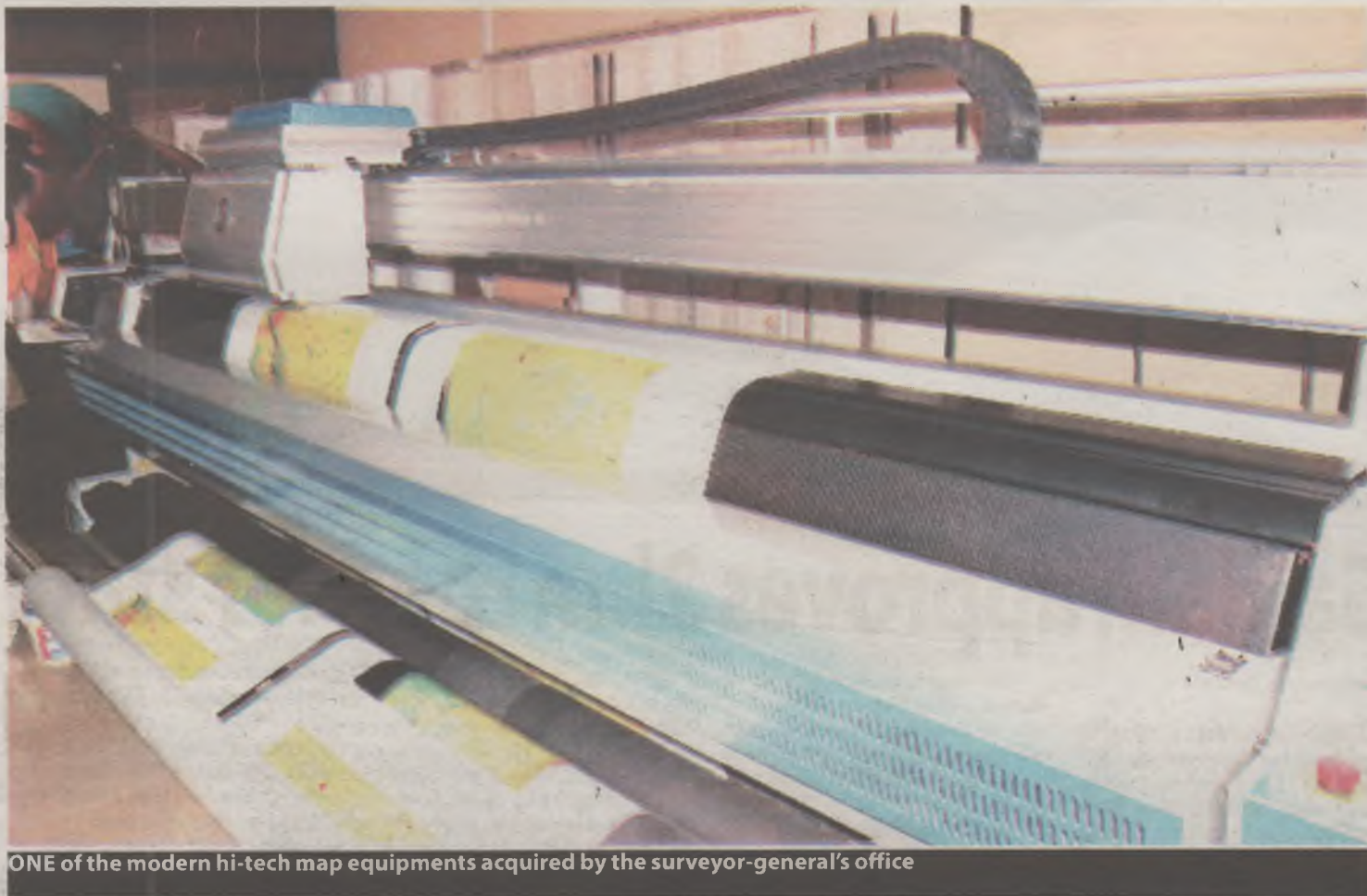
ONE of the modern hi-tech map equipments acquired by the surveyor-general's office

He appealed to the government to provide modern, drilling equipment and geographical instruments to assist the water agency to be abreast of latest digitalisation in water drilling. (NAN)