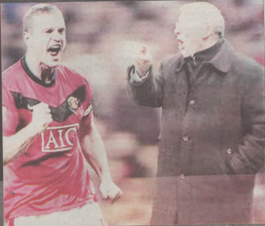
NEMANJA Vidic, left, insists he is happy at Old Trafford and has not fallen out with Alex Ferguson.

"That's something we have to be patient with, which we are doing at the moment."