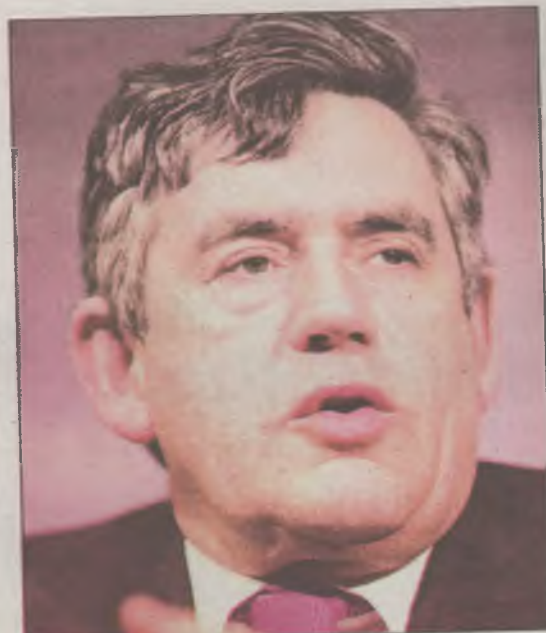
BRITISH Prime Minister Gordon Brown