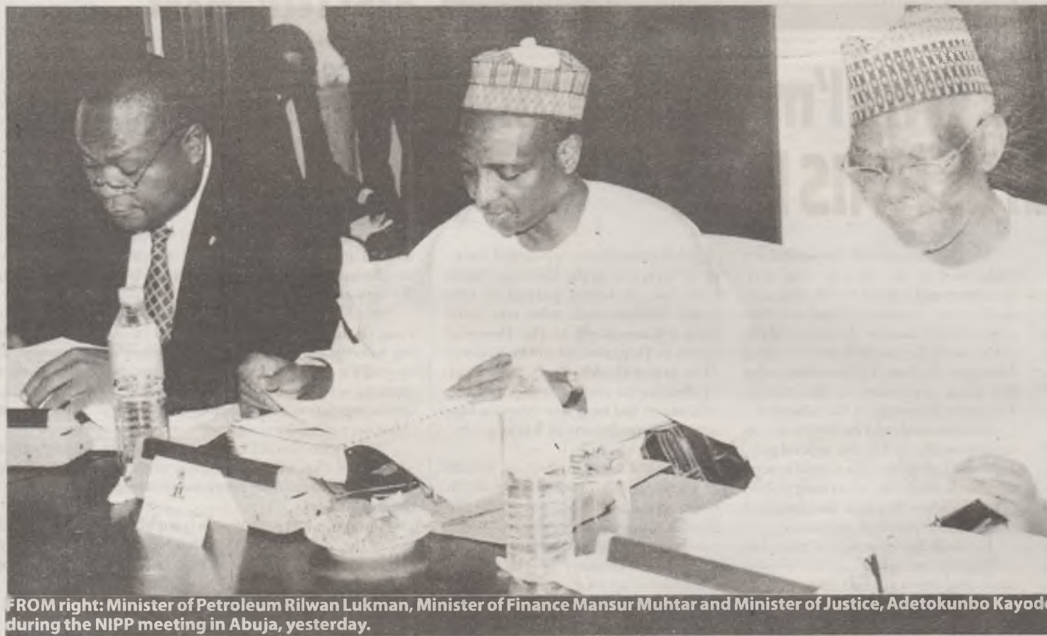
FROM right: Minister of Petroleum Rilwan Lukman, Minister of Finance Mansur Muhtar and Minister of Justice, Adetokunbo Kayode during the NIPP meeting in Abuja, yesterday.