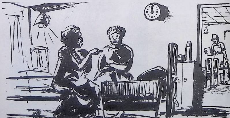
A nurse (extreme right) busy in the female ward. "Health is wealth" on

3.00 ABDU'A TASKIRA 3.30 GIDAN KASHE AHU 4.00 NEWS IN BRIEF DAGA JARIDU 4.30 NATURE TRAIL 5.00 NETWORK SPORTS 7.00 NEWS AND REPORTS 7.15 GIZAGO 8.00 SHOW TIME 9.00 NETWORK NEWS 9.30 LABARAI 10.00 GUEST OF TH WEEK 11.00 SATURDAY FEATURES