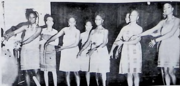
FRCN Choir, Enugu. "Music In perspective," on Tuesday at 12.30 hrs.