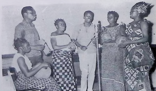
A Musical group with the traditional instruments, entertaining its audience. "Orin Ibile", on Sat. at 2030 hrs.