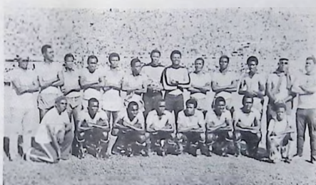
Bendel Insurance of Benin pose for a snap-shot before the kick-off.

Stationery Stores of Lagos suffered a great blow midway into the league by the two year ban placed on it by the Nigeria Football Association fol-