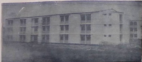
One of the many houses built by the Federal government at Abuja. "Abuja A Yau" (Abuja Today) in Hausa, on Friday, at 08.55 hrs.