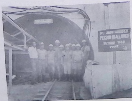
Coal Miners busy on the field. Coal is one of Nigeria's energy sources.

In the process, the total mass of the two combined hydrogen atoms (helium) is found to be less than the sum of the masses of the individual hydrogen atoms. According to the celebrated physicist, Albert Einstein, the missing mass is not actually lost in the process of fusion of the two