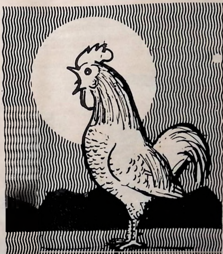
"Cock-crow At Dawn" - a network Programme for your delight on Fri. day, at 8.30 p.m.