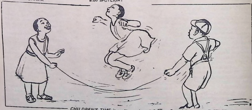
CHILDREN'S TIME is on Network at 5.00 on Sundays