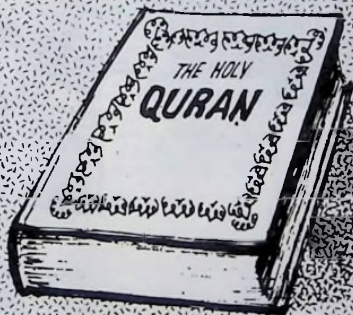
Reading from the Holy Quran, Fridays, at 0550 hr