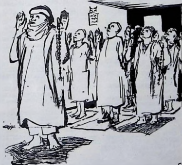
Muslims observing the Jum'at Service, "Barke Da Yau" on the air, on Friday, at 1930 hrs.