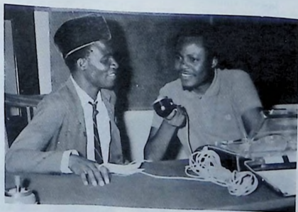
A producer (right) having a Chit-chat recording with an artist. "People and Events" comes to you on Tuesday at 2:030 hrs.