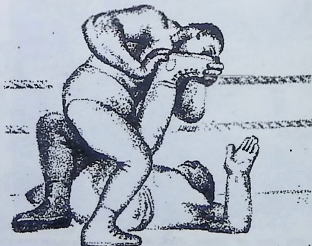
At 11.15 every Monday on NTA Ibadan is a special treat in wrestling. -