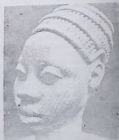
Terra Cota head from Ife-Ife "Images and Rhythms" takes the air on Sat. at 23.03 hrs.