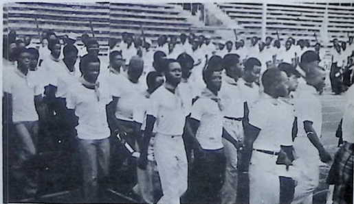
Workers marching during the May Day parade

This makes it all the more appropriate at this time to stress that more than ever before, employers and the labour force should find common ground on which to work together towards industrial peace and harmony.