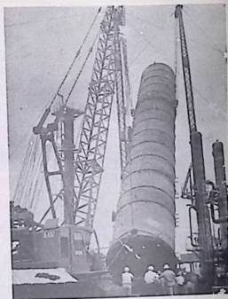
The site of oil refinery at Elese Eleme near Port-Harcourt

Our oil is reputed to be of a high class, having a low sulphur content. Assuming a daily production rate of 1.5 million barrels per day, our reserves/production ratio could be in the order of 30 years. If this estimate is correct, it follows that the nation has just 30 more years of rendezvous with oil, provided that the rate of