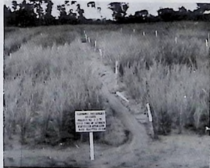
Rice field like this contributes immensely to the country's agricultural products.

That is why president Shahu Shagari's determination to choose on his own those who will execute the tasks ahead in the next four years is most welcome. Indeed a rational choice of these men is the first step towards carrying out the tasks ahead.