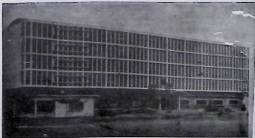
University of Ibadan.