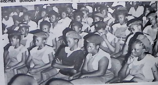
Cross section of students who attended the inaugural part of the lectures.

In order to use coal as fuel for the transport, industry, the nation has to resort to production of the so-called synthetic fuels, such as those developed by German scientists during the second World War when Germany lost her sources of crude oil, first in Rome-