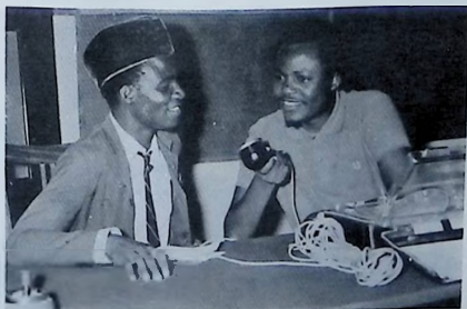
A producer (right) having a Chit-chat recording with an artists. "People and Events" comes to you on Tuesday at: 2030 hrs.