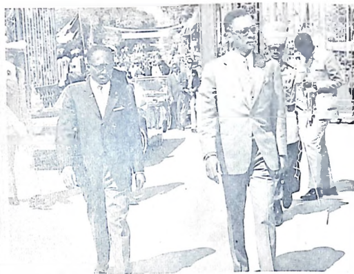
General and Zaire in happier times. Presidents Mobutu and Senghor in Dakar last year.

to damage the new relationship built up with Senegal after Mobutu's official visit there in February 1971. In particular a Zaire-Senegal trade agreement was nearly rejected by the National Assembly in Dakar, in an unwonted demonstration of independence of mind.