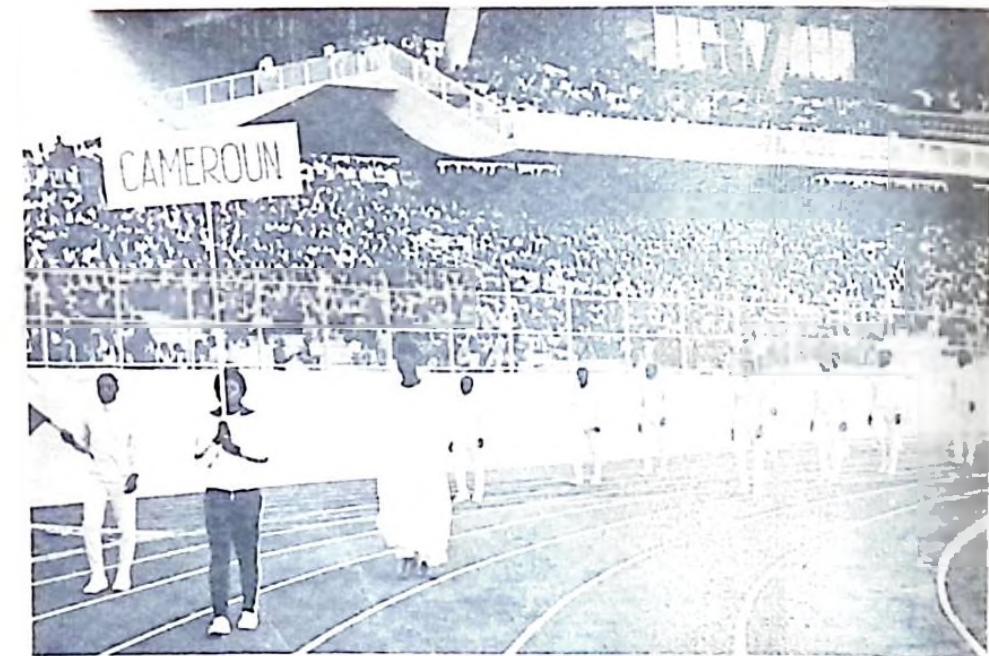
Cameroon's national eleven march past in the new Ahmadou Ahidjo stadium, Yaounde at the opening of the African Football Cup Series

In the Group 'B' elimination matches played at the Douala Re-unification stadium the results were: Morocco had a