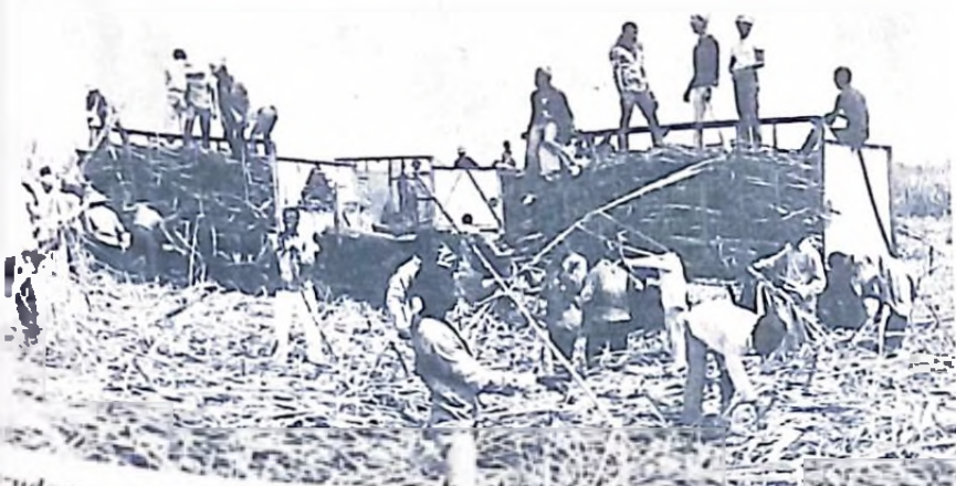
Student volunteers from Legon University and Mount Mary Teacher Training College, Kumasi, harvesting over 100 tons of sugar cane to feed the sugar factory at Asutsuare in response to the NRC's call for patriotic service