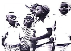
CHILDREN'S TIME is on Network at 6.30 on Sundays