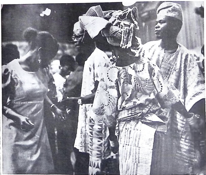
OSBC features WEEKEND DANCE TIME every Saturday at 9.10p.m.