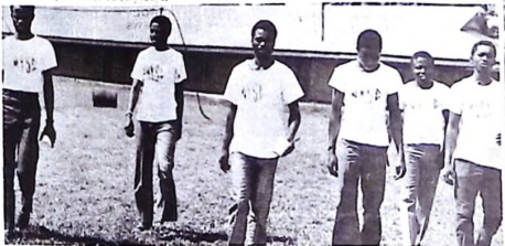
On Radio Borno is a regular Request programme titled NYSC CALLING. It comes up every Saturday at 21.30hrs.