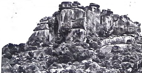
One of the hills on the Jos Plateau

Also a potential item on the tourist attraction programme is the topography of Plateau State itself with its undulating terrain and rocky outline. One can easily see the whole city of Jos by standing on a hill at the Jos Hill Station Hotel. Leather crafts such as bags, shoes, and other kinds of items made out of animal skins, are on display at the various craft centres in the State. The visit to Jos will be incomplete without seeing the mining industry in Bukuru where work is still going on.