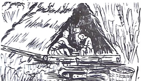
Two farmers having a break in a hut after the day's hard labour. "LABE ABA" is a Yoruba programme for farmers every Wednesday at 12.30hrs Don't miss it.