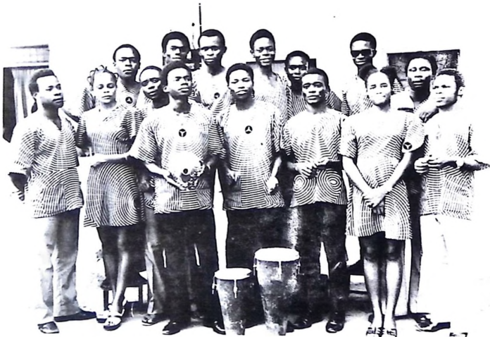
The Akai-Ubium Community Singing Group from Cross River State. Beautiful voices like theirs can be heard on Radio Cross River every Saturday at 10.15hrs on "MUSIC OF OUR LAND".