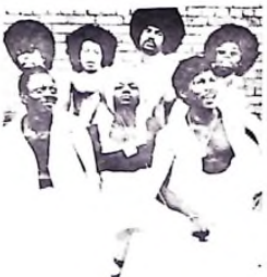
The Ohio Players. "Afro stars like them can be heard on FRCN Lagos every Friday at 09.03hrs. So, make it a date

15.03 KALEIDOSCOPE 16.00+ THE NEWS 16.10 KALEIDOSCOPE (Cont'd) 17.00 NEWS ON THE HOUR 17.03 KALEIDOSCOPE (Cont'd) 17.30 FEATURE (From: Wed. 21.30) 18.00 NEWS ON THE HOUR 18.03 SPOTLIGHT (From: 07.15) 18.08 LET'S GO FARMING 18.15 MUSIC OF OUR AGE (From: Mon. 21.30) 18.30 MEETING POINT (From: Wed. 30) 19.00 NEWS PANORAMA 19.30 FOLK MUSIC (From: Wed. 22.30) 19.45 FROM THE LEGAL STAND POINT (From: Sun. 09.45) 20.00 NEWS ON THE HOUR 20.03 TOMORROW ON F.R.C./LIGHT MUSIC/PUBLIC SERVICE ANNOUNCEMENTS 20.15 EDUCATIONAL SERVICE 20.30 SPORTS PREVIEW 20.45 CHRISTIAN COMMENT 21.00 NEWS ON THE HOUR 21.03 MOMENT FOR THOUGHT (From: 06.55) 21.06 FOLK TUNES ON PIANO (From: Sun. 18.03) 21.20 EVENING WORSHIP 21.30 EDUCATIONAL SERVICE 21.45 SPECIAL READING FROM THE HOLY QURAN 22.00+ THE NEWS 22.10 NEWS ANALYSIS (Rpt. Sat. 07. 10): WEATHER NEWS 22.15 EDUCATIONAL SERVICE 22.30 THIS WEEK'S COMPOSER 23.00 NEWS ON THE HOUR 23.03 STRINGS/LETTER FROM. (From Tues. 19.30) 23.20 KHUTBA 23.50 AL-AISH 00.00 NEWS AT MID-NIGHT 00.05 CLOSE DOWN 00.05.30 NATIONAL PLEDGE AND ANTHEM