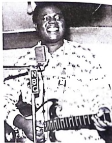
"Commander" Ebenezer Obey

"I don't play politics," he dismissed the whole talk. "I do not intend to go into politics — I am a musician and music is meant for peace and love. And, until a new government is elected, I'll continue to play music for peace and love of the nation, while at the same time, supporting the government of the day."