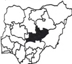
Map of Nigeria showing Plateau State

Plateau State is situated on that part of the northern plateau about