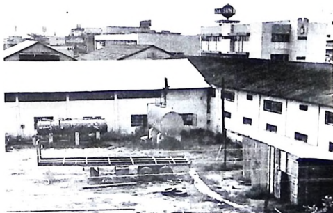
Waste from a big industrial complex like this constitute a lot of environmental problems.

Sanitary landfill: This is an engineered method of disposing of solid wastes on land. It involves spreading the waste in thin layers, compacting it to the smallest practical volume and covering it with soil by the end of each day so as to prevent access to rodents and flies. It is actually a biological method of anaerobic waste decomposition which converts previously non-usable, nuisance causing lands to useful nuisance-free areas suitable for parks or other recreational uses and for building developments. Sanitary landfill is capable of disposing of all types of solid wastes irrespective of size, moisture content and other characteristics.