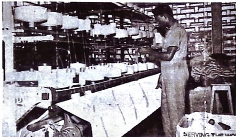
A textile industry. Workers should be protected against hazards from such Machines.

One of the practical measures on industrial safety was the creation of the Factory Inspectorate Division in the Ministry of Labour. Some of the senior officials in the division have been trained in modern techniques of safety management. They are also to receive special training in areas like testing and inspection of boilers and other pressure vessels, as well as inspection of lifting appliances like cranes in anticipation of the enforcement of the relevant provisions of the law. Other in-