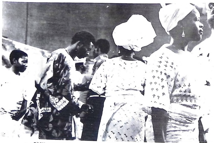
FRCN Lagos presents SATURDAY JUMP every Saturday at 14.08hrs Why don't you stay tuned