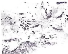
A roadside refuse heap — a major health hazard

Marine Disposal: Dumping refuse at sea or into large bodies of water has been practised on a large scale by some coastal and lakeside cities. The unsorted wastes are loaded in boats and are emptied some distance in the open sea. In general, less is yet known about the fate and effects of solid wastes and industrial sludges barged to sea.