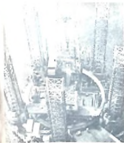
PORT GENTIL: Oil and Okoume