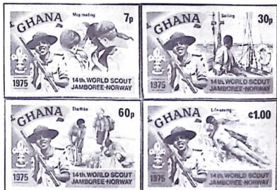
Ghana recently issued a set of stamps to commemorate the 14th World Boy Scout Jamboree.

• The Government has directed all motor parts dealers to register with the Prices and Incomes Board.