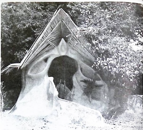
The gate of the Arugba's shrine