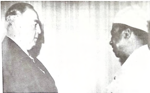
February meeting in Monrovia

In Liberia's history President William Tolbert has an assured place. He is and may remain the only President who not only succeeded, as Vice-President, on the death of the President, but who then served not only his predecessor's unexpired term of some five months, but Mr. Tubman's next term of four years without himself being elected. This was because President Tubman had already been elected for the next term when he died, and the law was changed to allow Mr. Tolbert, who had been elected Vice-President to Mr. Tubman, to serve the 1972-76 term as President, as he had been for the previous five months, instead of as "acting President". After being elected unopposed last year, he has been formally inaugurated for the eight-year term which is now prescribed for Liberia's Presidents.